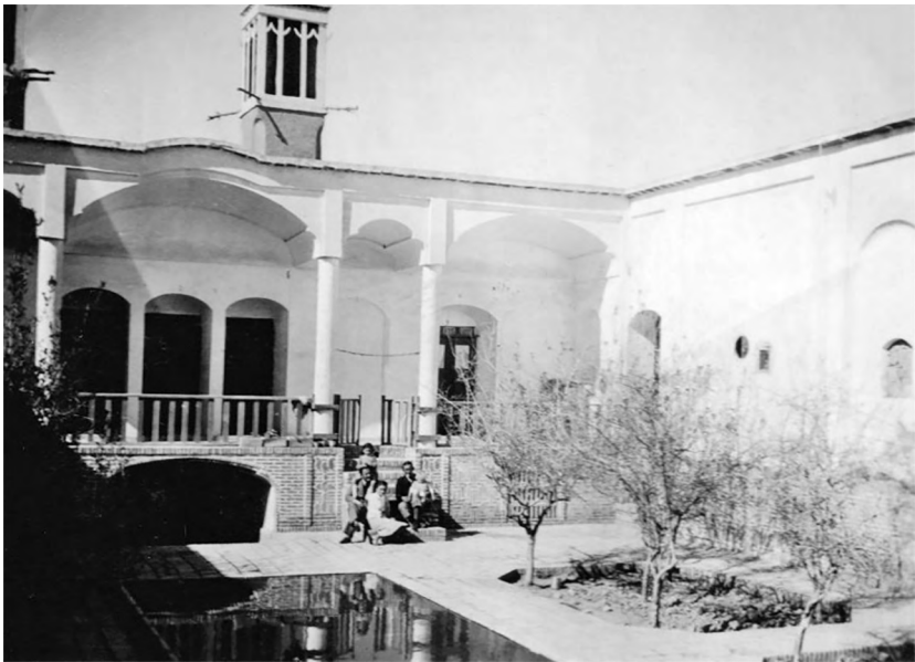
Christmas at home in Khaladabad, south of Kashan, Iran, 1939.