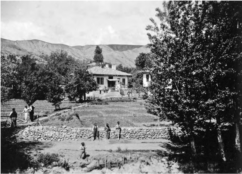
The house in Çankiri Village, Turkey, in which Helga was born.