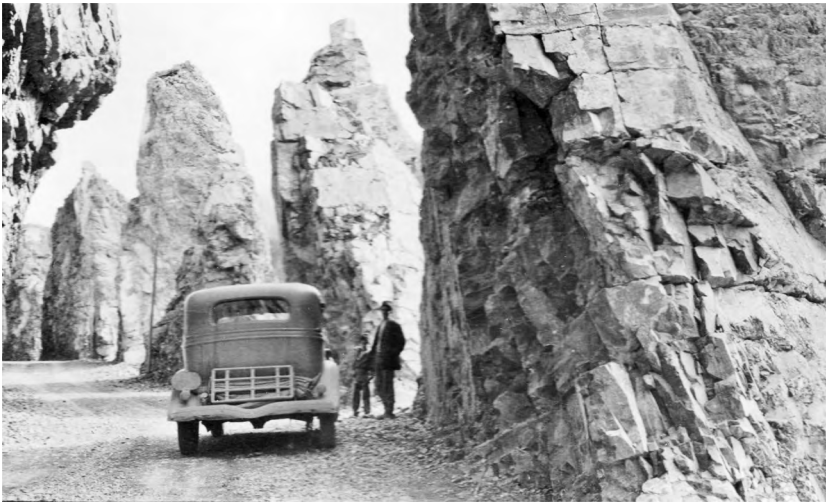
Cliffs by the road outside Karind, Iran, July 1941.