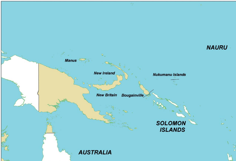
Map 1. Area of the Territories of New Guinea and Papua under Military Control pursuant to the National Security (External Territories) Regulations 1942

been under military control. The Commonwealth Government imposed military control, as it was termed, in the territories of New Guinea and Papua, as well as the Northern Territory and the northern parts of Western Australia and Queensland in February 1942 after the effective collapse of civilian administration in these places in the face of the first Japanese military attacks (see Map 1). 150