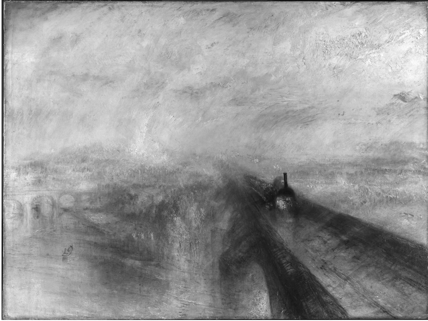
Figure 1. Joseph Mallord William Turner, Rain, Steam, and Speed—The Great Western Railway (1844).