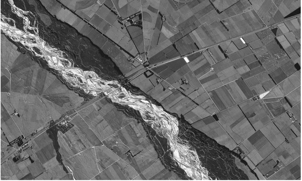
Figure 5. Satellite map of the Rangitata River amid grids of farmland across the floodplain.

snagged trees that our narrator describes suggest the presence of riparian and catchment forest. If Butler was, indeed, thinking of the Rangitata when he wrote this section of Erewhon , the reference is likely drawn from the podocarp forest—kahikatea and matai trees—that once dominated the river's swampy floodplain.