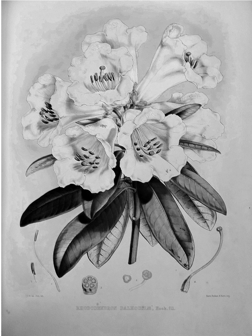
Figure 2. Rhododendron Dalbousiae , an example of a species description provided by a single specimen (1849–51). (Image from Joseph Dalton Hooker, The Rhododendrons of the Sikkim Himalaya , reproduced by kind permission of the Board of Trustees of the Royal Botanic Gardens, Kew.)