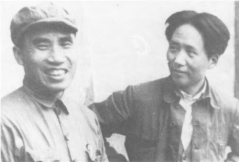
The "Chu-Mao" CCP leaders: Chu Teh (left) and Mao Tse-tung, in north Shensi, 1936.