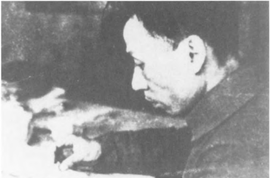
Liu Shao-ch'i in the 1930s.