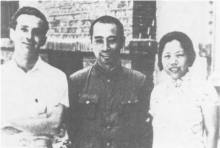
Chou En-lai and his wife, Teng Ying-ch'ao, with Edgar Snow in Wuhan, 1938.