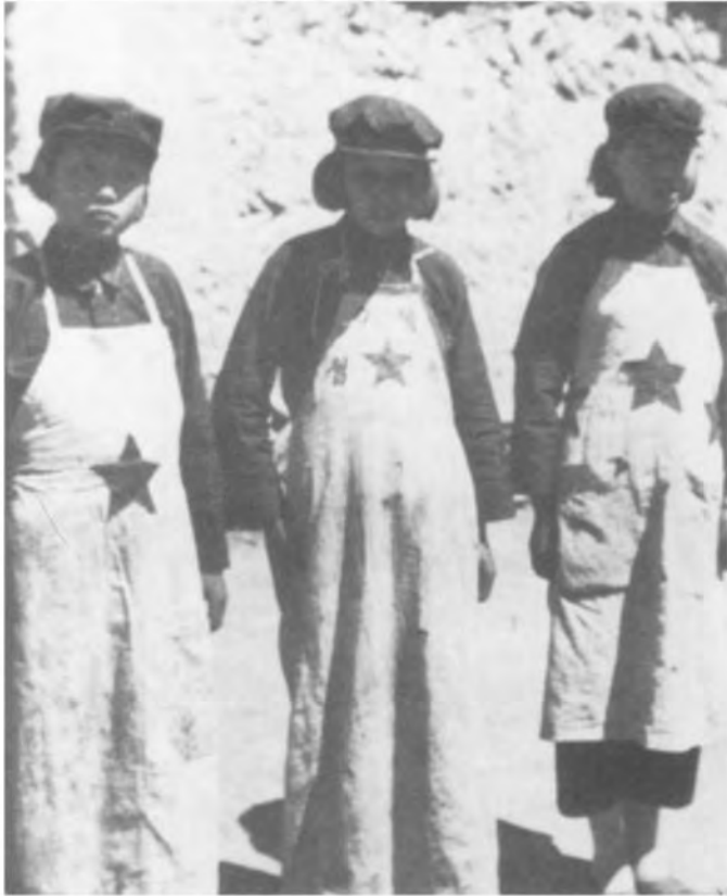
Women factory workers in Wu Ch'i Chen, north Shensi, in 1936.