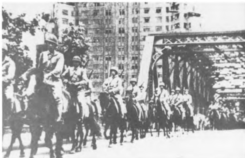
PLA troops entering Shanghai, 25 May 1949.