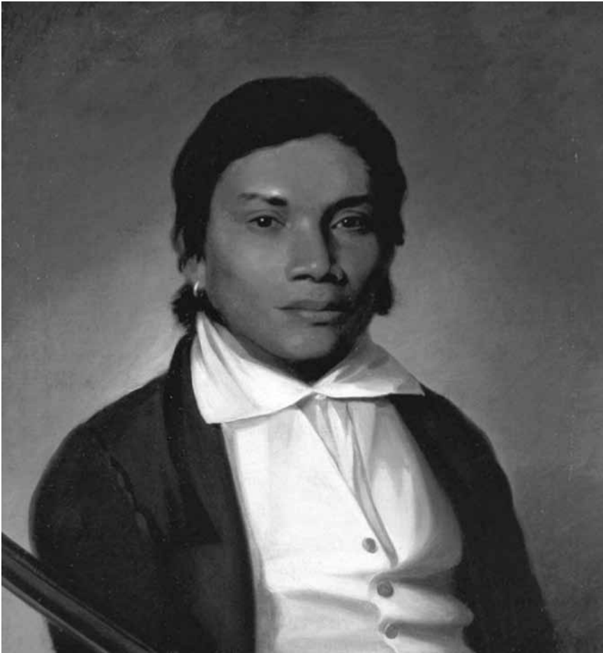
Figure 2.1 Portrait of Jonathas Granville (1824). Oil on canvas. Philip Tilyard. Baltimore Museum of Art.

detail how and why the project started. Yet, nestled within the mundane and the tedious are comments and articulations that turn away from the moral suasion seen in Boyer's earlier exchanges of letters with the agents.