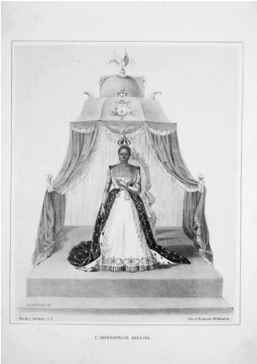
Figure 3.3 L. Crozelier after a daguerreotype by A. Hartmann, “L’Impératrice Adelina,” lithographic plate 4 from Album Impérial d’Haïti , New York: Th. Lacombe, 1852. © The British Library Board. HS.74/2132.