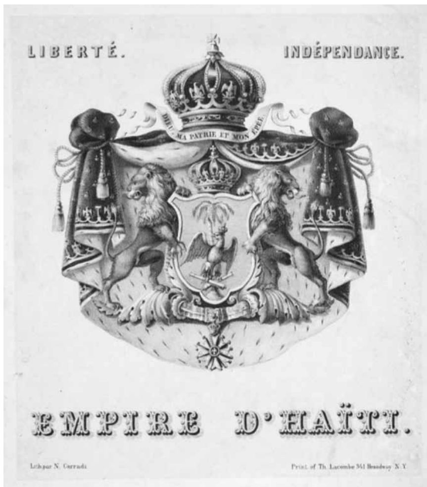
Figure 3.1 N. Corradi, “Empire d’Haïti,” lithographic plate 1 from Album Impérial d’Haïti , New York: Th. Lacombe, 1852. © The British Library Board, HS.74/2132.

Although we do not know every detail about the album and its commissioning process, we do know that it had an impact on visual attempts to configure Haiti. One example comes from an 1856 article in the Illustrated London News (ILN) . A weekly British newspaper that boasted a large readership, the ILN aimed to provide its avid readers with visual content. This particular article does not disappoint. Entitled “His Imperial Majesty Faustin, Emperor of Hayti,” the article casts Haiti as the Atlantic world’s dark-skinned—and distempered—foundling: an aggressive and bumbling