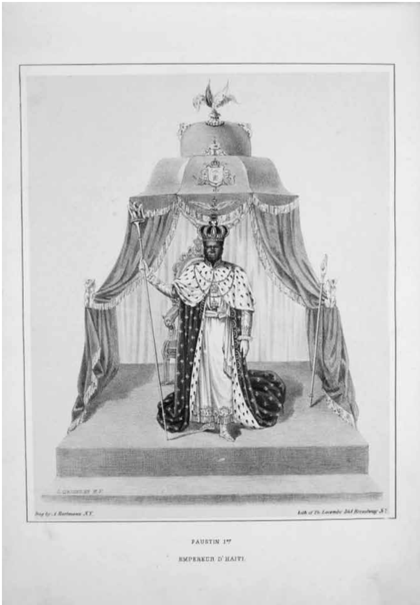
Figure 3.2 L. Crozelier after a daguerreotype by A. Hartmann, “Faustin ier Empereur d’Haïti,” lithographic plate 3 from Album Impérial d’Haïti , New York: Th. Lacombe, 1852. HS.74/2132.