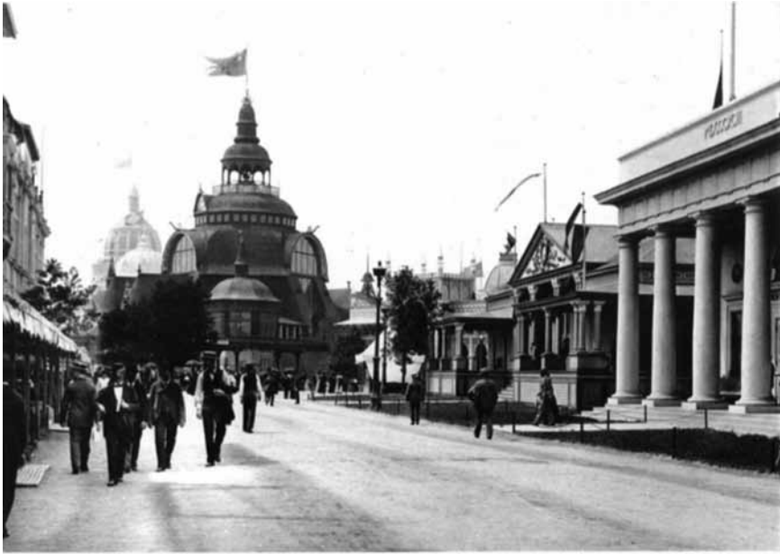
GOVERNMENT BUILDINGS, SWEDEN, HAYTI AND NEW SOUTH WALES.

Figure 4.1 C. D. Arnold and H. D. Higinbotham, Official Views of the World's Columbian Exposition (Chicago: Press Chicago Photo-Gravure, Co., 1893). Plate 75.