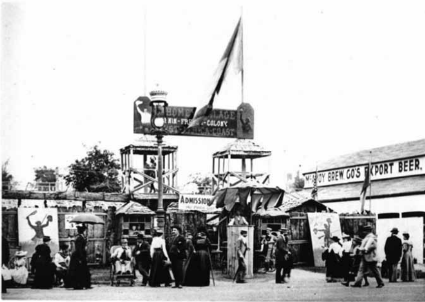
DAHOMEY VILLAGE.—ON THE MIDWAY.

Figure 4.1 C. D. Arnold and H. D. Higinbotham, Official Views of the World's Columbian Exposition (Chicago: Press Chicago Photo-Gravure, Co., 1893). Plate 110.