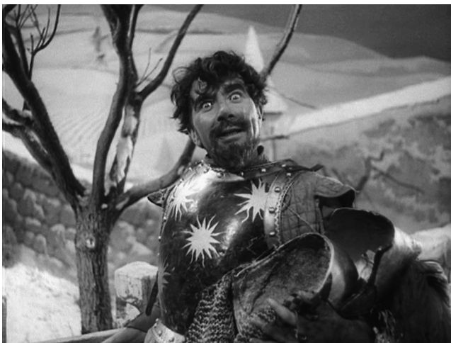
"To England will I steal, and there I'll steal."

The scene is notable for a few reasons. First, this is the only moment in the film's naturalistic third act when an actor turns to the camera in order to address to the audience directly. As already described, Olivier represents both Henry's soliloquy on the eve of Agincourt and Falstaff's dying memory of Hal's rejection as voiceovers spoken while the camera lingers closely on their pensive faces. His handling of those moments would seem to suggest the film's adherence to naturalistic rules governing the impermeability of the fourth wall. It is for that reason all the more striking that, between his beating and his departure, Pistol turns to the camera in order to engage the audience directly. This helps in part to solidify Newton's late place in the tradition of the clown or the Vice; as I said before, what differentiated the clown from other types of performances was exactly his tendency to break the performance's frame to improvise and to stake a claim as an actor or celebrity as much as a character. And, while Pistol's brief speech is not