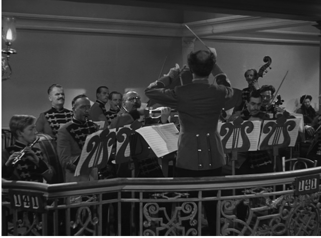
I am Titania.

challenge, one that forces singers to show off and swoop gratuitously up and down the scale (it was, said one critic with distaste, an “obvious concession to the virtuosity of the soprano”), but also a canny musical representation of its character’s essential and, one might say, natural artifice. 47 Goethe’s seductive, artlessly artful Philine is a consummate actor, a figure who thrives precisely because she treats identity as a protean form of play; it is no coincidence that she loves the role of Titania, Shakespeare’s wonder-working queen of the fairies. The several associations embedded in the tune—its cosmopolitanism, its culture, its relation to play and to style—come together to stand in for a European milieu that the film sets implicitly against the present of realpolitik and twentieth-century modern war. Indeed, this, the film suggests, might be one reason why the opportunistic proto-fascist Kaunitz can’t stand it; “I am Titania” represents not only a moment in the history of operatic style but also a system of values on the verge of extinction.