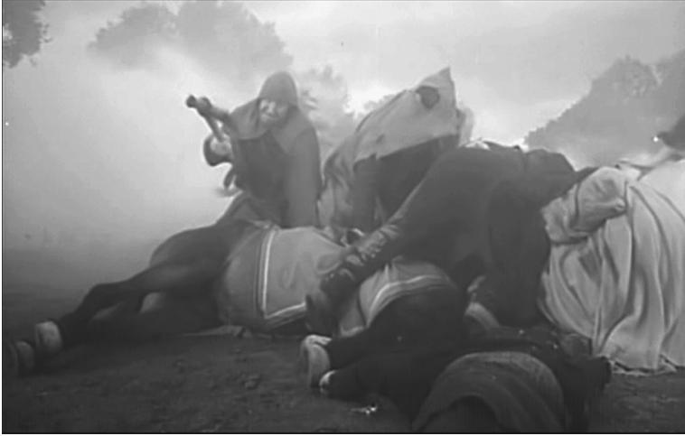
The fog of war.