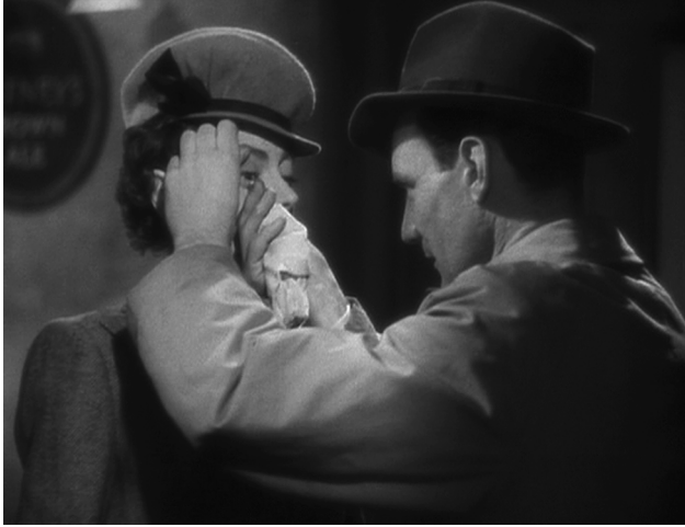
A bit of grit.

The moment is notable both for its ultimate effect and for the fact that one can follow the lights dimming as an obviously contrived process: “When I was directing Brief Encounter we experimented with an extreme technique of emphasis. In the closing scenes of the picture, when Celia Johnson is sitting in the railroad station and listening to the train that is taking her lover away for the last time, we took down the lights of the room behind her and even faded out the voice of the woman talking to her, so that all the emphasis was on her face and the sound of the departing train.” 140 In a sense, the cinematographic change of emphasis is a culmination of the film’s visual logic, a shift from the film’s putative domestic realism to an exaggerated chiaroscuro more appropriate to The Cabinet of Dr. Caligari or The Third Man ; it is, in other words, late visual proof of a stylization that had been at work all along.