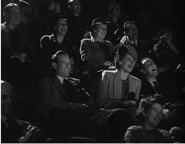
At the movies.