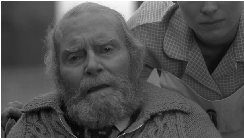
The world at war.

It is clear that this is part of what Jarman heard in Britten's piece, and his initial close-up of an aged and frail Olivier works to connect his film to the formal logic of Britten's score as well as to the wartime films discussed in the previous chapters. Olivier's presence as the quasi-allegorical Old Soldier recalls Powell and Pressburger's effort to embody the similarly archetypal figure of Colonel Blimp, an aging warrior invoked to help understand a larger history of violence. Olivier was Powell and Pressburger's first choice for the role of Clive Candy; they turned to Roger Livesy only when Churchill's government refused to give Olivier leave from the Fleet Air Arm to make the film. As a result, Jarman seems in War Requiem to make good on the counterfactual promise of The Life and Death of Colonel Blimp ,