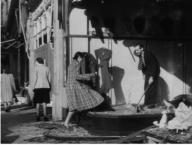
London can take it!

other avant-garde film makers—recognized how technical advances in film could be used to expand the image space and the promise of modernity to the masses: the possibility of combining collective activity with individual agency into free identity. 68 Seen in these terms, Jennings’s films are maybe the best because the richest expression of what we might think of as an official eccentricity , of minorness strategically cast as an ideological alternative to totalitarianism; they are instances of eccentricity—a free identity—put to work for the collective activity of national propaganda. 69 Jennings made the difference between his local, regionally specific, and recalcitrant propaganda and that of the Nazis explicit: “In a BBC broadcast, Jennings told listeners that [his film] The Silent Village portrayed ‘the clash of two types of culture,’ what he called ‘this new-fangled, loudspeaker, blaring culture invented by Dr. Goebbels’ against ‘the ancient, Welsh, liberty-loving culture which has been going on in those valleys way, way back into the days of King Arthur.’” 70