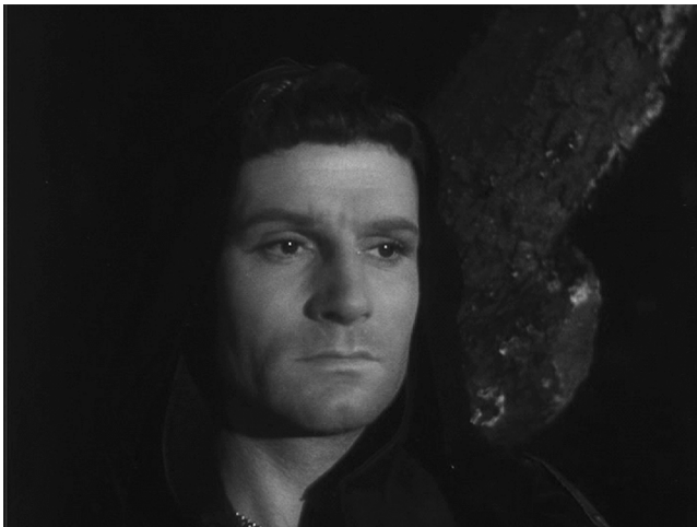
"What must kings forgo?"

Olivier thus uses specifically cinematic effects in order to offer the transformation of actor into character, exterior into interior, public into private as an allegory for what Ernst Kantorowicz famously referred to as the king's two bodies, the idea that the king brought together in one person