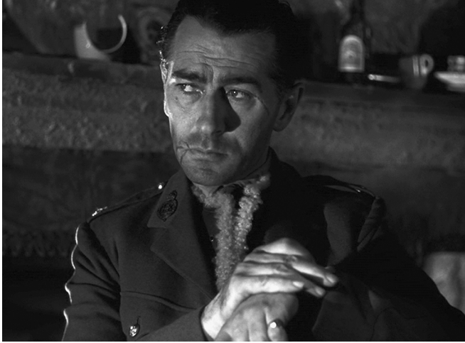
“A simple South African.”

otherwise committed. 80 Indeed, the appearance of the brutally effective South African officer, Major Van Zijl, in the film’s middle section suggests as much: “Now listen! I am in command here now and I know how to deal with you scum. I am not a simple English gentleman but a simple South African and I assure you that I have means to get what I want.” 81 While the film draws a clear and immediate distinction between his apparent willingness to torture World War I German prisoners and Clive’s more humane and less successful approach, the scene and Van Zijl’s scarred face seem tacitly to suggest that his expertise might have been hard won at English hands a decade and a half before, a possibility that hints at something darkly tenacious within Powell and Pressburger’s history of British violence.