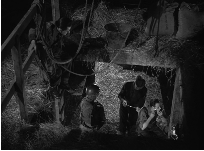
“The real thing!”

civilian and soldier that defined the conduct of almost all parties during World War II: “The preponderance of [civilian deaths] was no accidental or peripheral feature of [World War II]; it reflected the central significance of civilians in the conflict, the indispensable roles that they played in the war’s outcome, as well as the vulnerabilities that they shared, as a direct consequence, with the soldiers.” 39 In addition to reflecting technological advances and, in particular, the exponentially expanded reach of aerial warfare, the broad militarization of the home front had far-reaching effects on the very idea of what war was and what it meant to imagine an end or an outside to war. As I suggest in the introduction, total war was as much a concept as a situation during World War II; it was how people thought about themselves and each other during war time.