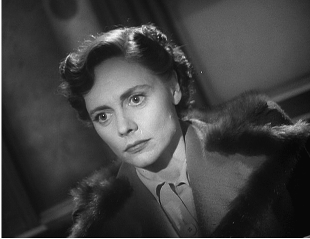
An extreme technique of emphasis.

the audience. It is a moment of emotional intensity powerful enough to tear the barrier that would keep the world of Brief Encounter separate from our own: “the camera tilts over, making her seem drunk or distraught as she goes to meet [the express]. It’s a calculated effect, and Lean easily gets overcalculated—but in this case the vibrato works just because the image seems to be willed by the actress.” 141