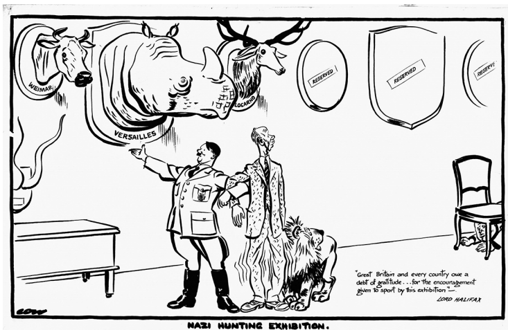
Nazi hunting exhibition.

Such a connection between these images in 1937 and Powell and Pressburger's 1943 film might seem strained if it weren't for the fact that David Low, creator of the original Colonel Blimp character, had himself used the image of Halifax surrounded by mounted heads as the basis of a pointed caricature printed in the Evening Standard on November 19, 1937. Entitled "Nazi Hunting Exhibition," it shows a doddering Halifax arm-in-arm with Hitler in front of mounted heads labeled "Weimar," "Versailles," and "Locarno," suggesting that Hitler's choice of game included the governments and treaties that had stood and might continue to stand in his way. Next to those heads are three or more empty plaques, each about ominously to be filled with another treaty, another government, or, indeed, another country. Mussolini giggles in secret beneath a nearby chair while the British lion looks with appropriate anxiety at the wall's waiting vacancies. Powell and Pressburger gesture toward and add to Low's list in their second hunting sequence when the montage of appearing heads culminates in an otherwise inexplicable shot of a map of Munich, using a series of juxtapositions to suggest that the conference turned out indeed to be another of Hitler's