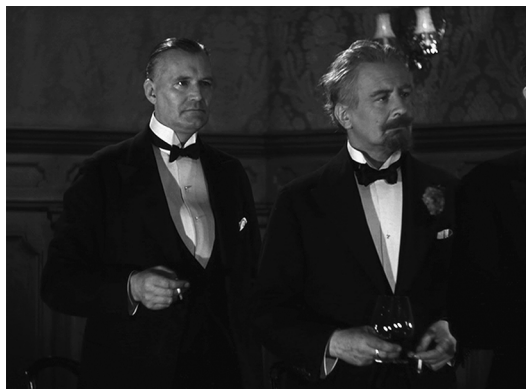
The dinner party.