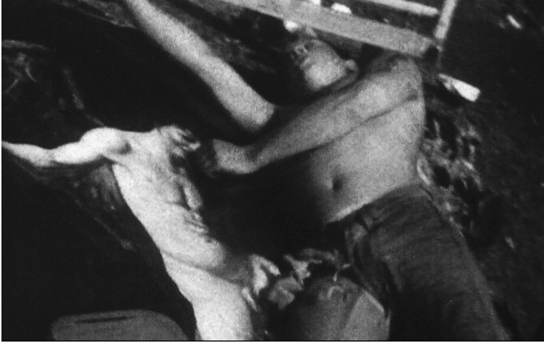
Boy with Caravaggio.

past, its broken present, and the future that seems the likely and tragic result of that present, stands as a powerful argument about the historical and social tenacity of violence: “In The Last of England the devastation wrought by Margaret Thatcher’s social and economic policies is represented as a continuation of the Blitz as London burns before being reduced to rubble.” 13