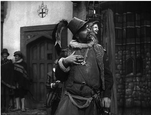
Enter ancient Pistol.