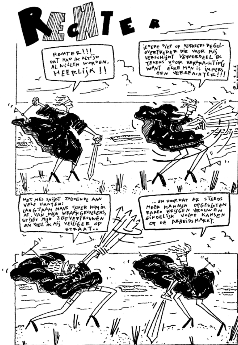
FIGURE 2 Rechter [judge]. "Judge!!! I've always wanted to be a judge!! Lovely!!!" "All thieves and road traffic offenders who appear before me will be sentenced for rape too, because every man is a rapist!!!" "Slowly, this will satisfy my feelings of revenge, increase my self-confidence, and make me feel safer on the streets..." "... and since an increasing number of men will spend time in prison, there will finally be far more employment opportunities for women" [translation by author], Elderen, van (2009, 24). Courtesy of caricaturist Karin van Elderen.