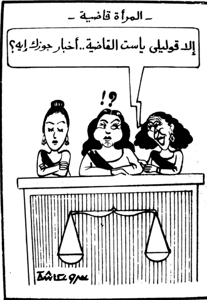
FIGURE 1 The Woman Judge. The judge on the right asks the presiding judge: "Come on, tell me, madam judge, how is your husband doing?" Al-Wafd, June 17, 1994. Courtesy of Amr Okasha, caricaturist, political writer, and deputy manager of al-Wafd newspaper.

of their husbands, and where the presence of female judges has long since become a common sight, women's capacity to adjudicate objectively is still put into question. Skeptics frequently make references to their alleged soft and emotional nature to debase women's credibility within the legal system. Hence, the issue of women's authority in the courthouse, on the one hand, and