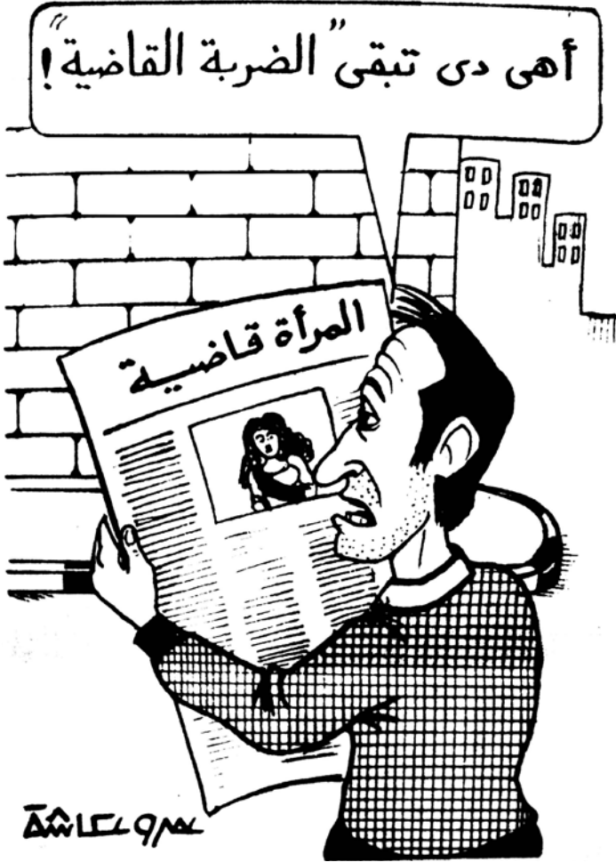
FIGURE 3 Women Judges. When the man reads in the newspaper that women have become judges, he says: "Now this is the blow of the woman judge" [this will be the final blow to men, personal communication Amr Okasha, September 29, 2014]. Amr Okasha, al-Wafd , June 19, 1994.

as judges in the Family Courts, they should be barred from entering the criminal law courts (e.g. al Jazeera Net 2007). A survey conducted during a general assembly meeting in the Judges' Club in November 2005 indicated that 85 percent of the judges did not accept the appointment of women to the civil or