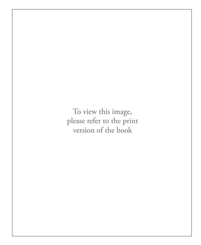
Fig. 4 – In this image, engraved to commemorate the death of Rudolph II in 1612, the emperor can be seen being driven to the Sala d'Olimpo in a vehicle drawn by a lion and some eagles (FBG Biogr. fol. 593/1 (98)).

Eucharist.<sup>55</sup> It is significant that, on the death of emperor Rudolph II in 1612, an engraving should be made, depicting his ascent to heaven in a carriage, an illustration of the degree of interest in such topics in the courts at the time (fig. 4).<sup>56</sup> The sacred character of kingship