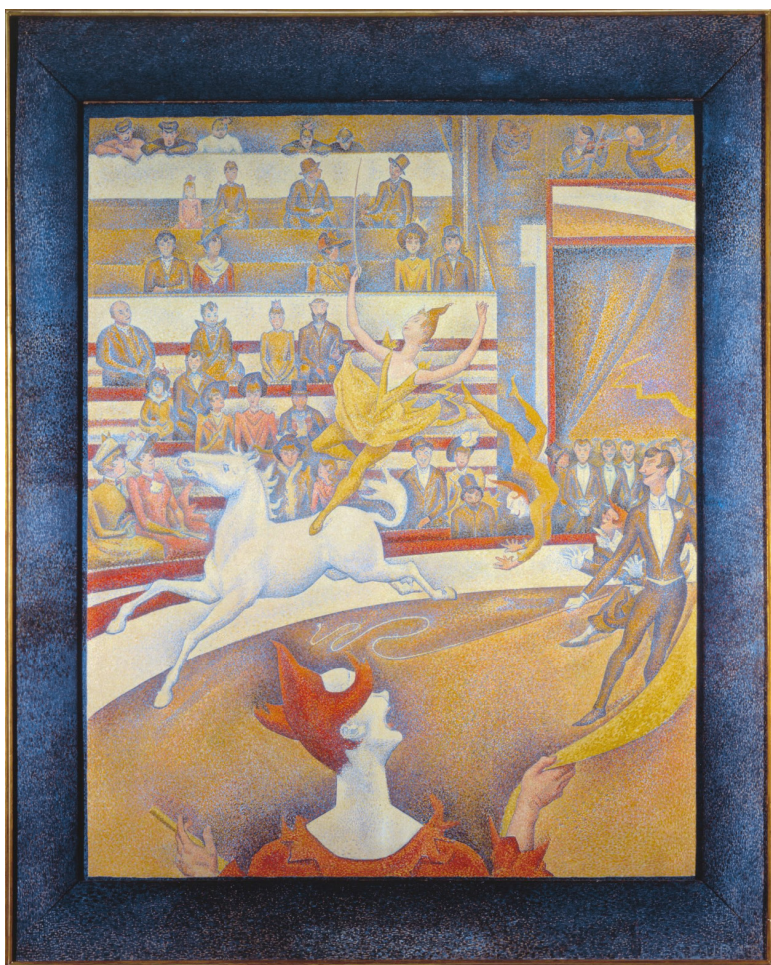
Georges Seurat, Le Cirque , 1890-91. Collection of the Musée d'Orsay, Paris.