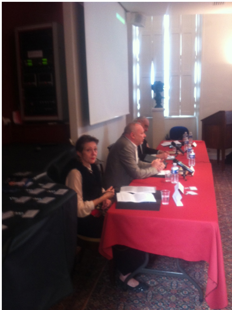
NZ at Tadeusz Kantor centennial conference, la Sorbonne, April 2015.