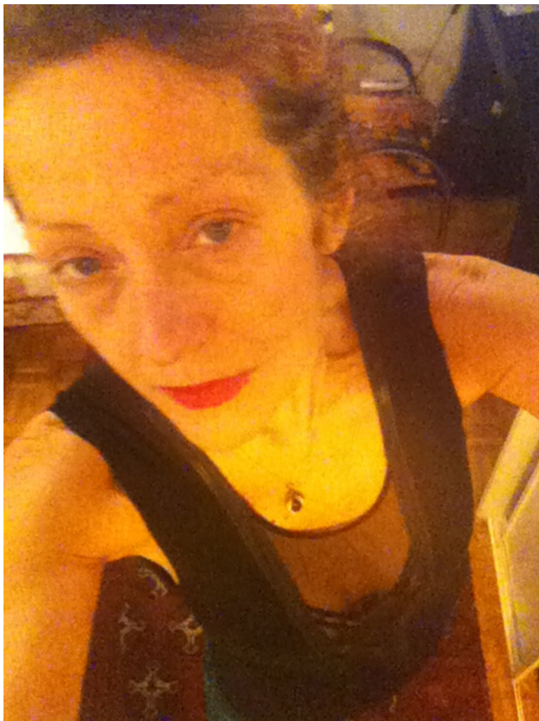
New NZ gmail avatar with orange skin, as of April 29, 2015.