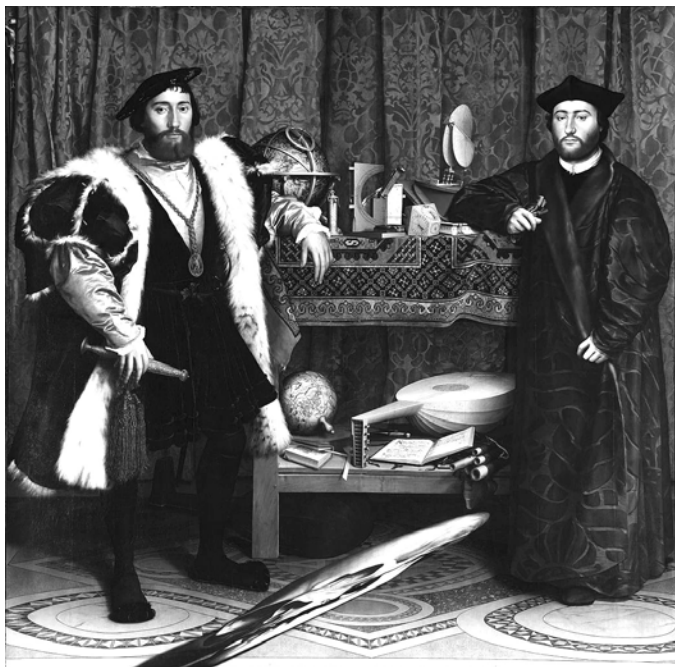
Hans Holbein the Younger, The Ambassadors , 1533 (National Gallery, London)

position, or turn my book at an angle, the stain becomes magically legible.