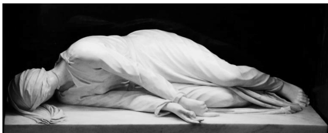
Figure 1. Stefano Maderno (1575-1636), Martyrdom of Saint Cecilia , S. Cecilia in Trastevere, Rome. 1

percutis, ut sanes, et occidis nos, ne moriamur abs te ~Augustine, Confessions