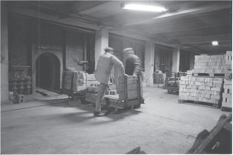
These brick-drying kilns provided the best protection from the icy winds.

One night I lay hidden inside a large warehouse used for storing timber, which was kept locked for the night. I was up in the loft, just below the eaves, resting on a stack of timber boards and trying to settle down, curled up with my knees drawn high. From there, I was able to observe the outside through a small window. I was dozing restlessly, waiting for dawn to break, mindful of any sign of danger. Somehow, I had a gut feeling that perhaps I should not have chosen this place on this particular night.