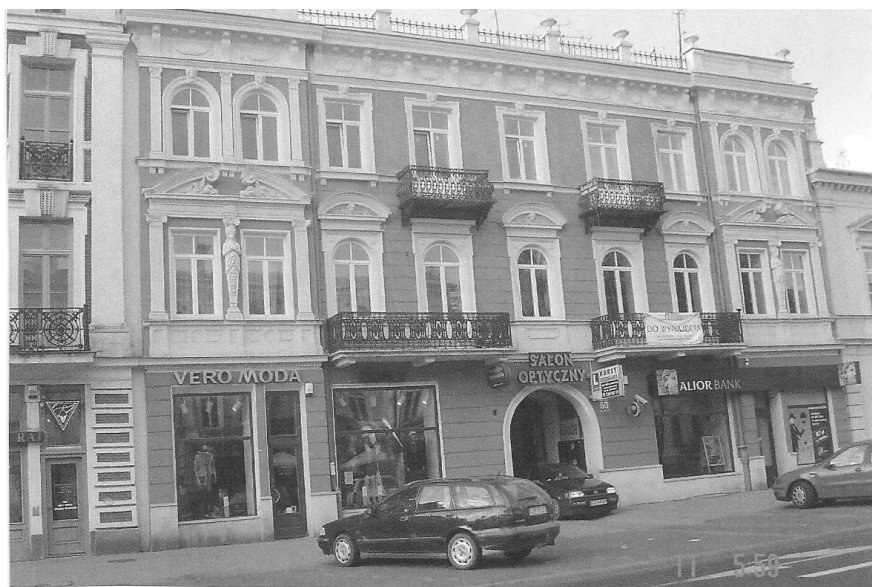
The Jewish orphanage in Lublin was housed in this imposing building.