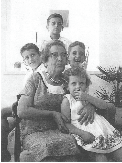
My mother in Israel in 1963. She was always at her happiest when surrounded by her grandchildren.

after a funeral: “Blessed be the True Judge.” It was only days before the liberation.