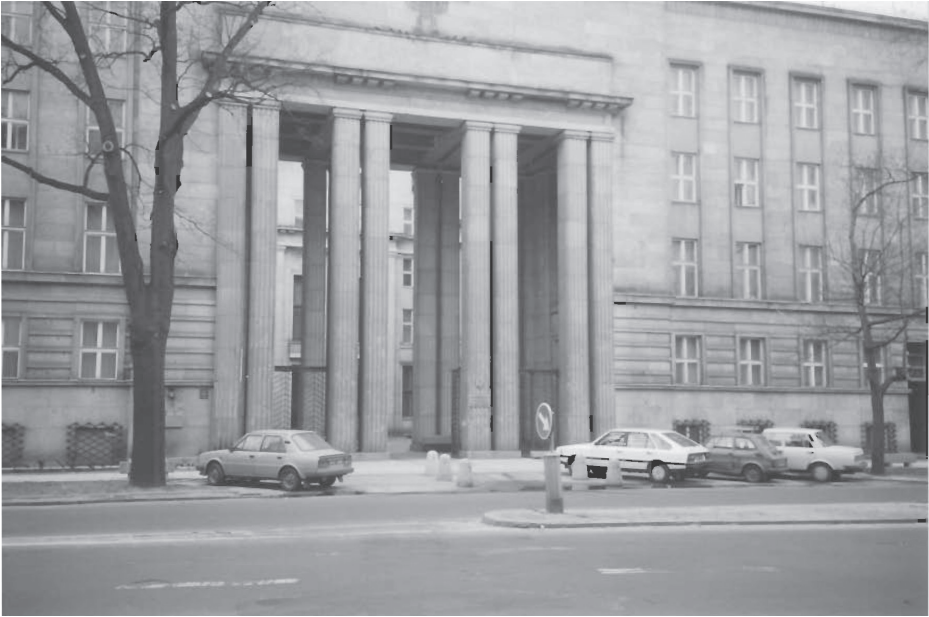
The former Aleja Szucha Gestapo Headquarters in Warsaw.