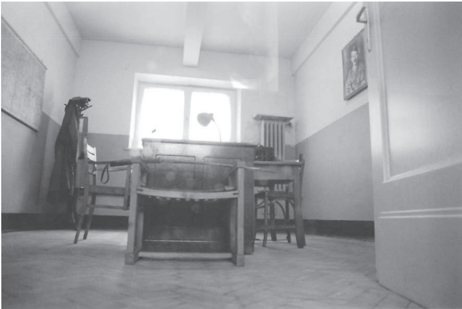
An interrogation room at Aleja Szucha Gestapo Headquarters, now the Museum of Martyrdom. A portrait of Adolf Hitler hangs on the wall with torture instruments resting on the table and chair.