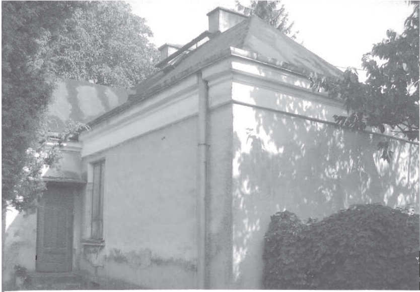
The tiny cottage in Włochy we and our friends sheltered in. We only had the use of this rear door, everything else having been boarded up.

An additional problem we encountered when winter set in was, surprisingly, drinking water. There was no plumbing or running water in our dwelling, as it was only partly built, but there was a well in the landlord's garden which we had access to. Later on, during hard frosts, this became a problem. Although the hand-pump was lagged with sacking, it was not enough to stop it from freezing up. We stored all the water we could for drinking, cooking, and everyday usage, but we didn't have enough receptacles to store enough water for five people for long. For washing, we melted down snow. Luckily, we had a very basic cesspool lavatory at the cottage, though without the flush mechanism. Fortunately, it never filled up, but the room had a permanent reek to it. I never added to the problem: as I was always out and about, I got into the habit of doing what boys in the country normally did.