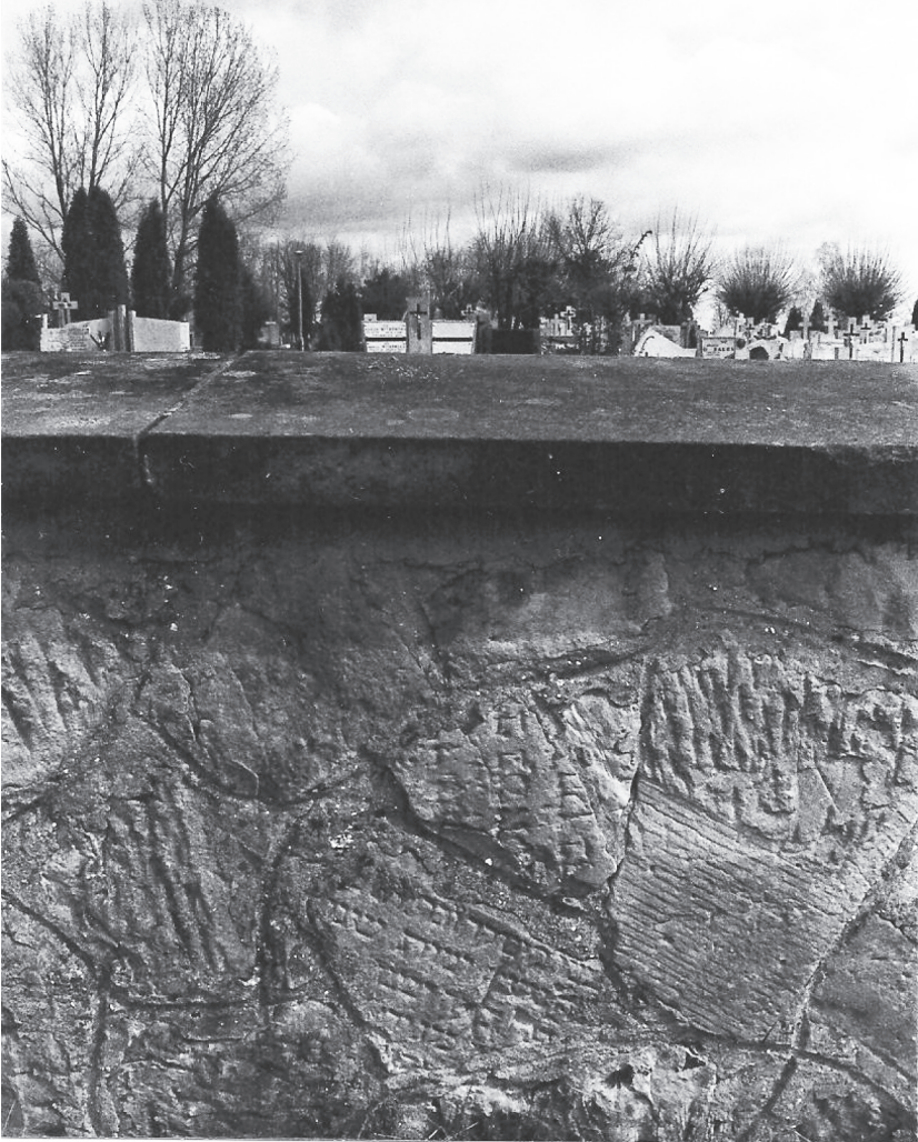
The perimeter wall of the Catholic cemetery in Ostrowiec, built with broken-up headstones taken from the Jewish cemetery, with the Hebrew inscriptions clearly visible.

testify against him, but Mother declined to set foot in Poland, saying, “I cannot go back to the place of Jewish martyrdom and tread the very soil that’s steeped in Jewish blood.”