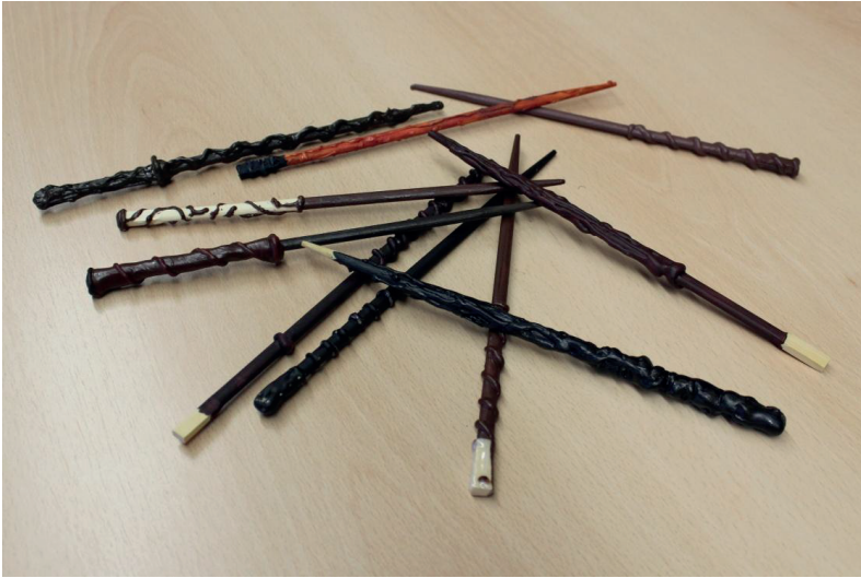
Figure 1 shows wands that were made by participants at the 2017 Inklings conference in Aachen, Germany.