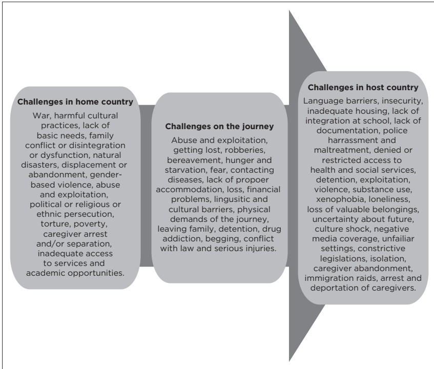
FIGURE 12.1: Migration challenges as understood within the migration framework.

Such a holistic approach is critical in designing appropriate individualised intervention for the child. Indeed, social workers who work with any migrant, irrespective of the migrants’ age, must first endeavour to understand their personal migration history in order to help them appropriately.