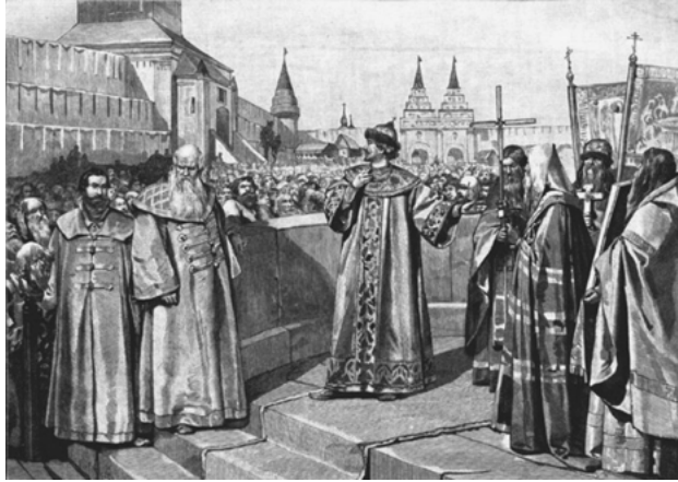
Tsar Ivan opens the first “zemskii sobor”, Klavdii Lebedev, 1894, National Library St. Petersburg.

Another interesting and unexpected aspect of Ivan’s legacy emerged within Stalinist Russia. 37 In an effort to revive Russia’s nationalist pride, Ivan the Terrible’s image became closely associated with Joseph Stalin. Historians faced great difficulties when trying to gather information about Ivan IV in his early years because early Soviet historiography, especially during the 1920s, paid little attention to Ivan IV as a statesman. This, however, was not surprising because Marxist intellectual tradition attached greater significance to socio-economic forces than to political history and the role of individuals. By the second half of the 1930s, the method used by Soviet historians changed. They placed a greater emphasis on the individual. The way was clear for an emphasis on “great men”, such as Ivan the Terrible and Peter the Great, who made a major contribution to the strengthening and expansion of the Russian state.