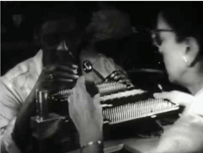
Figure 2. Teamwork was required to braid the wires through the cores. Screenshot from Computer for Apollo , directed by Russell Morash (Cambridge, MA: MIT Science Reporter, 1965).