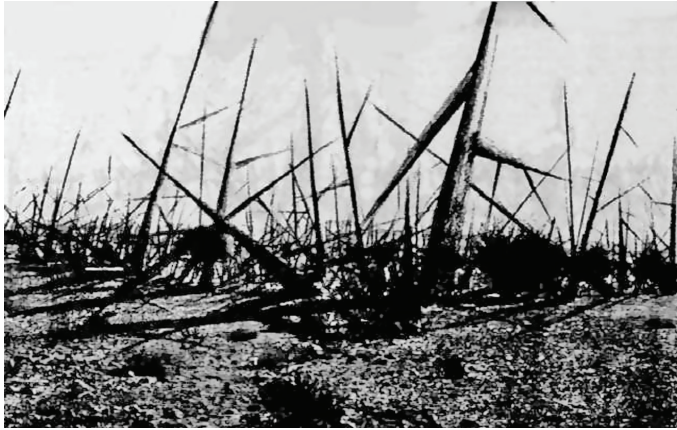
Figure 6. Proposed image for “Landscape of Thorns.”