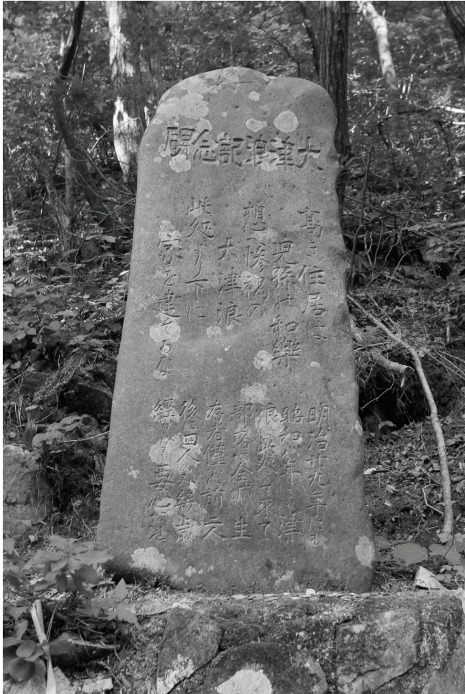
Figure 2. Aneyoshi Tsunami Stone. “The homes on higher places will guarantee the comforts of the descendants, Remind the horror of the tsunamis, do not build homes below this point. We suffered tsunamis in 1896 and also in 1933, only two villagers... survived [sic].” Photo taken June 14, 2013.