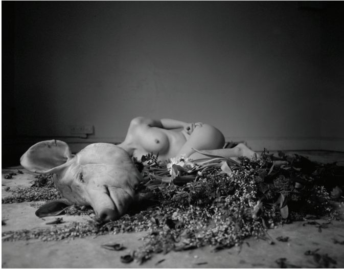
Figure 10: Sophia Schorr-Kon, Delphine's Call , 2012.

Goneril's argument against wasteful domestic management. 52 In this context, Lear's own defense of this lifestyle seems deliberately tuned to a logic of excess, as its prickly tone and outrageous analogies is one with the excessive scale of the class it means to defend: