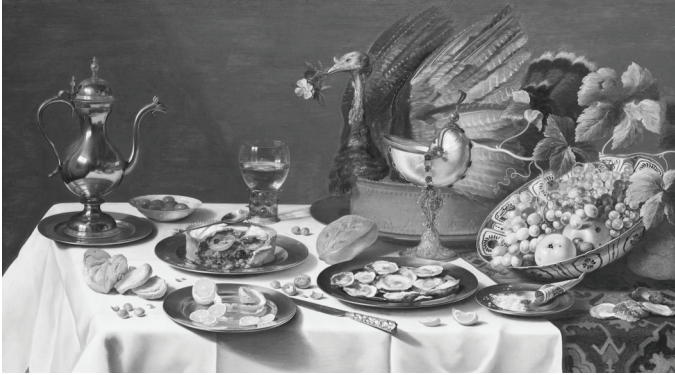
Figure 8. Pieter Claesz, Still Life With a Turkey Pie , 1627.

Albala never shifts his attention from cookbooks and dining guides, but he does reference comparable aesthetic styles of poetry and painting in the “baroque” attention to fine detail of the presentation of the food, “much like the attention to lavish ingredients used in baroque architecture: colored marble, and especially gold and silver ... [were both used] in decoration of building and food.” 38 The central dishes presented in each course are huge tableaux vivants of one main ingredient surrounded by a profusion of garnishes. “There is still,” he concludes, “far too much food for mortals to consume, and it is still served on a monumental scale.” 39