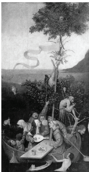
Fig. 1. Hieronymus Bosch, Ship of Fools (1490–1500)