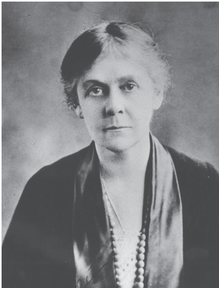
Figure 3.2. Alice Hamilton.