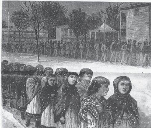
CHILDREN IN THE WAY OF INSTRUCTION