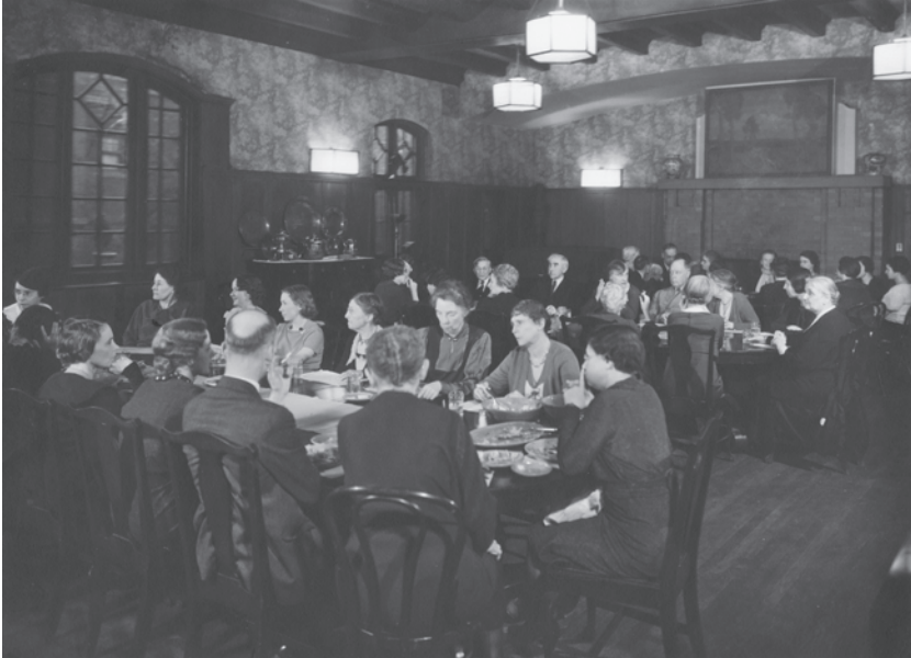
Figure 3.4. Hull-House Dining Room (with Jane Addams far right, top table).

Just so, across the pages of My Friend , Addams marshals narrative examples of Lathrop’s “disinterested virtue” to support her own contention that this trait enabled her friend to achieve a communal moral sense—an empathy free of egoism (36). Addams repeatedly returns to this idea, underscoring specific examples of Lathrop’s ceding credit to others for “accomplishments she herself inspired” (45) and giving generously of her time to social groups like Hull-House’s Everyday Club of “forty civic minded women” who met regularly to strategize approaches for addressing public issues (118). 67 As readers, then, we come to view “disinterested virtue” as a life goal through imaginative participation with these anecdotal illustrations more than through abstract theorizing.