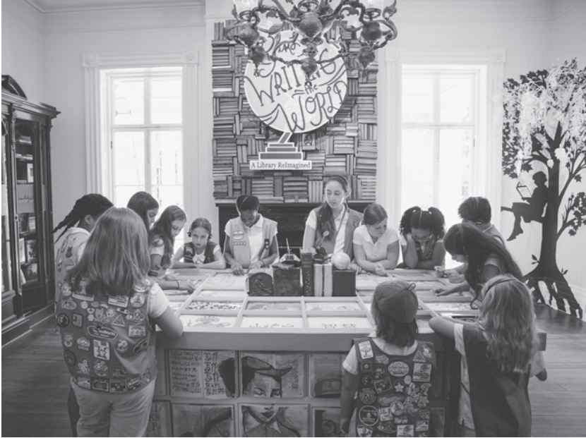
Figure C.1. Girl Scouts writing in response to the Re-Imagined Library Exhibit, Juliette Gordon Low Birthplace (JGLB), Savannah, Georgia.

and performative archive. We would need to interpret historically situated instances of this community's online rhetoric; to engage from a learner stance in shared reflection with its leaders; to locate the movement's activities within larger social networks; and then to tease out relationships among all these interactive elements of engagement. Exploring the cross-cultural public work of #BlackLivesMatter across time and within specific contexts, we could then identify particular learning legacies from its rhetorical efforts to construct shared knowledge and political commitment. That work, in turn, could support expansion of its goals into other contexts. As in earlier chapters of Learning Legacies , we might begin with a representative cluster of texts from the movement's record of cultural work—as specific as a string of associated tweets, perhaps. To illustrate, let me reference “The Disruptors,” a 2015 CNN online feature story about the coalition's leaders.