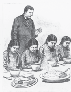
IN THE KITCHEN ROOM (CHILDREN OF THE FUTURE)