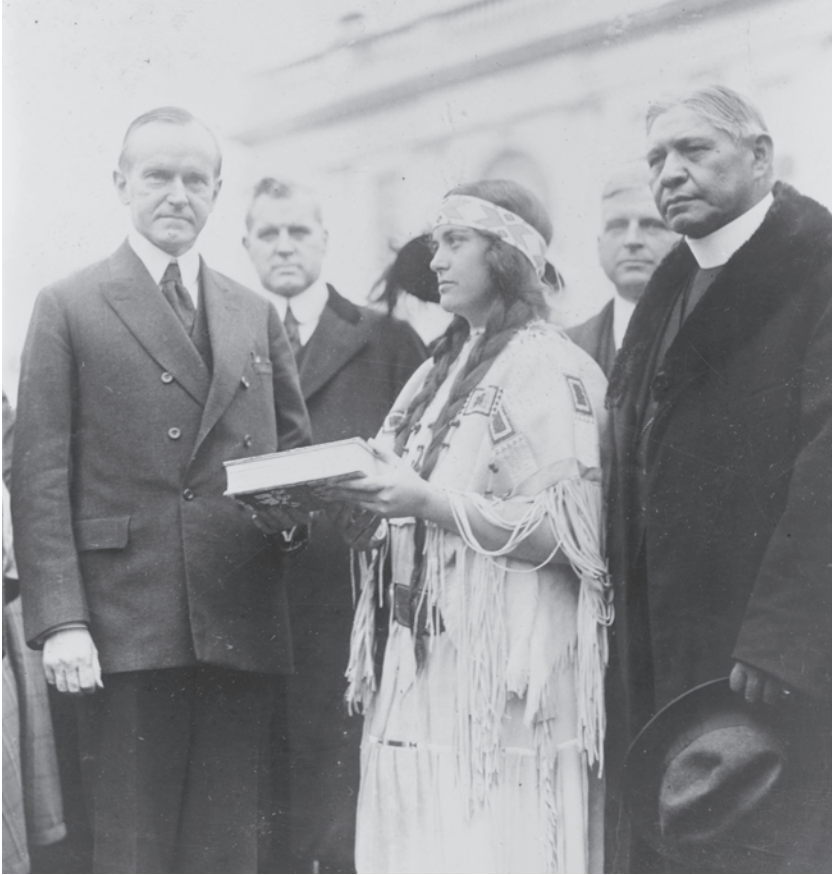
Figure 5.2. On December 13, 1923, Ruth Muskrat [Bronson] presented President Calvin Coolidge with a copy of The Red Man in the United States: An Intimate Study of the Social, Economic and Religious Life of the American Indian , by G. E. E. Lundquist (New York: George H. Doran Company). On June 2 of 1924, Congress would pass—and Coolidge would sign into law—the Indian Citizenship Act.