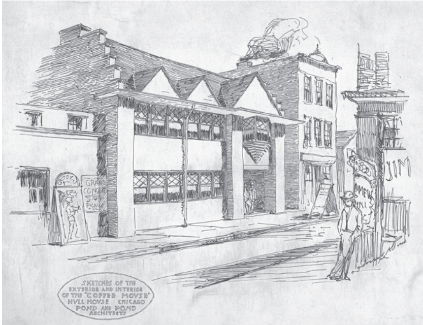
Figure 3.3. Hull-House Coffee House.