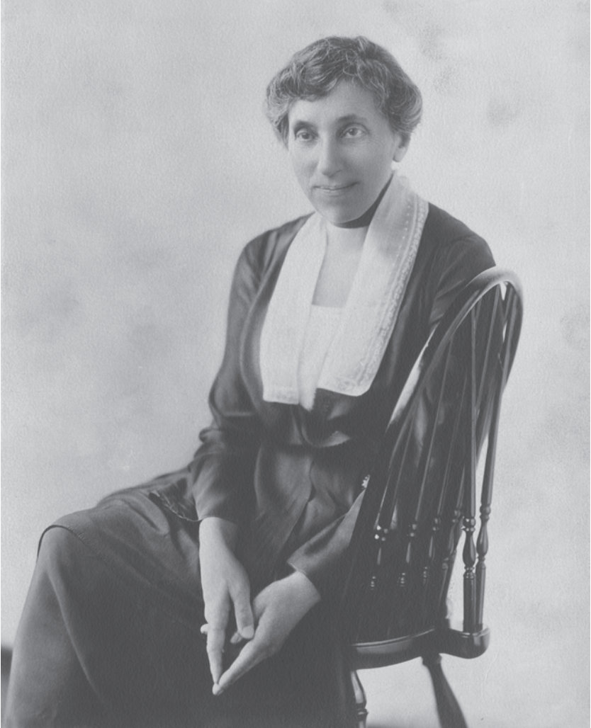
Figure 3.1. Julia Lathrop.