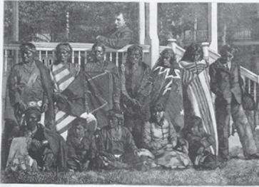
RECEIVING SUPPLIES AT THE RESERVATION