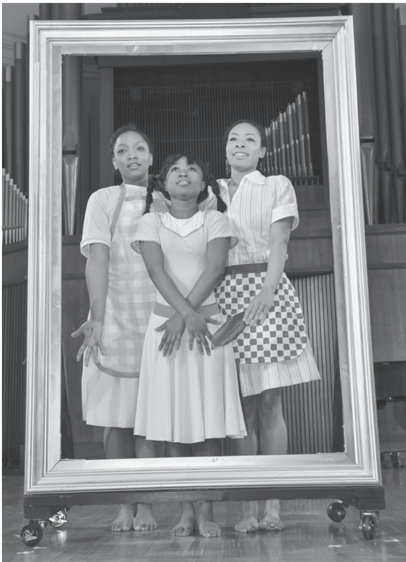
Figure 2.4. Story-portrait from the 130th anniversary Founders Day performance in 2011.