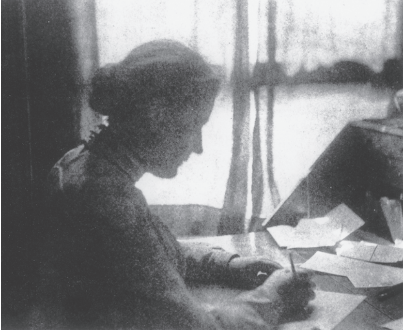
Figure 1.1. A youthful Jane Addams at her writing desk at Hull-House.

able community, historical movement, or site of inquiry—as in “I worked in an archive” of, say, periodical publications or public records or personal letters at a community-affiliated research site, or “I gathered an archive of oral histories” from a particular group of people. I use “Archive,” in contrast, for the multilayered set of cultural resources that accrue, over time, through assembling, saving, and sustained, culture-making use of texts and social practices linked to communities’ shared agendas. In particular, this project explores how an archive of learning legacies, over time, can grow into an Archive.