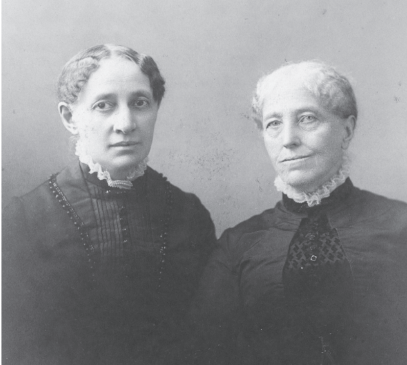
Figure 2.1. Sophia Packard and Harriet Giles, founding teacher-administrators at Spelman.

black community groups—was essential to Spelman’s success.