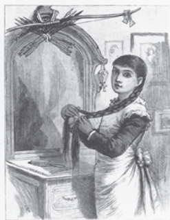
THE MOTHER OF INSTRUCTION IN HOUSEHOLD BY HER DAUGHTER