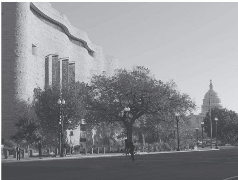
Figure 5.3. National Museum of the American Indian, Smithsonian Institution, Washington, DC, Exterior.

and again to reconnect with colleagues who are aiding my inquiry—such as making multiple trips to the NMAI and looping back to interviewees to share the evolution of my thinking and writing—rather than merely carrying out a single instance of “data-gathering” to inform analysis I would then do on my own.