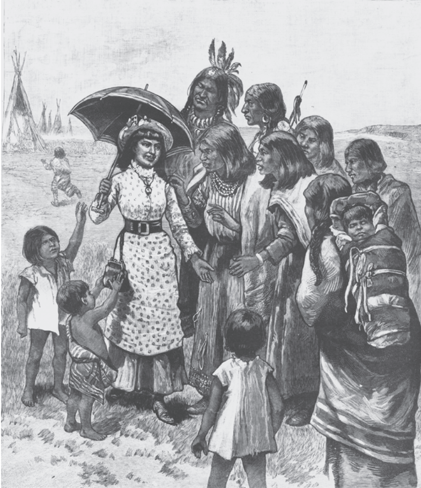
Figure 4.3. Female Student at Carlisle Visits Home at Pine Ridge Agency, from Frank Leslie's Illustrated Newspaper (March 15, 1884). **Per L, 3/15/4, p. 49.

to the boarding schools' Negative Archive. Native writers have made effective use of diverse literary forms to echo and reinforce her resistant rhetorical patterns. Plotlines, characterizations, and recurring imagery tied to the schools' past have coalesced in a body of texts that, taken together, achieve a powerful corrective to flawed prior histories. Key themes include running away to escape, abuses of authority by teachers and administrators, conflicts over language use (including renamings of students and suppress-