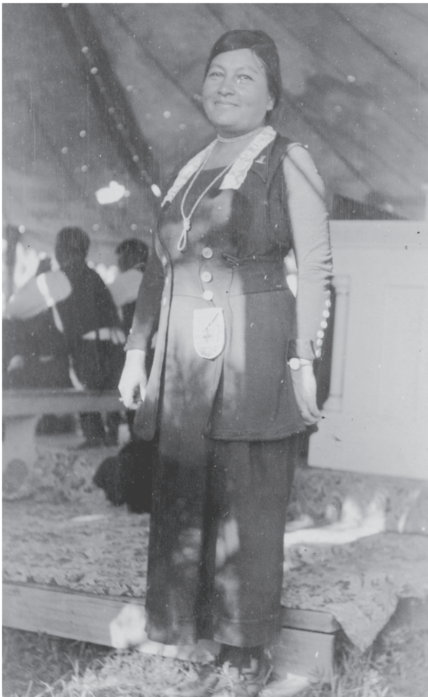
Figure 5.1. Gertrude Simmons Bonnin as a speaker at the Catholic Sioux Congress, Holy Rosary Mission, South Dakota, Pine Ridge Reservation, 1920.