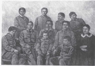
NATIVE AMERICAN (IN WAGON, SEEN) TWO YEARS AGO