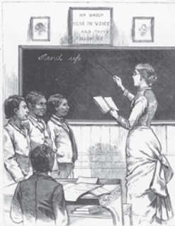
TEACHING IN THE CLASSROOM