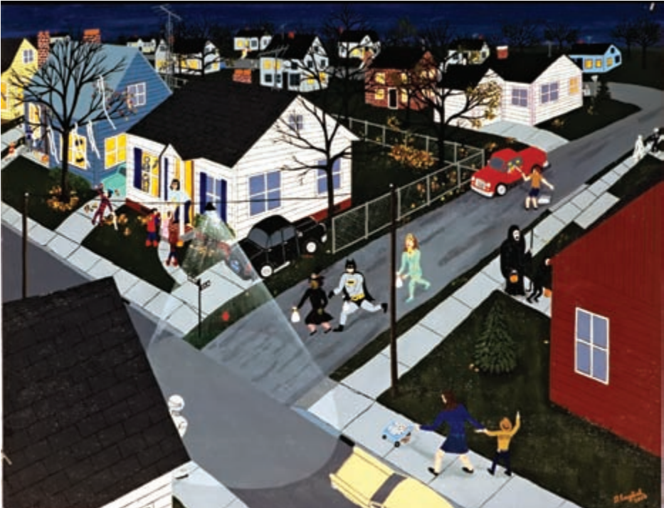
“Halloween: Fall Fun-time,” Gary English, 2008