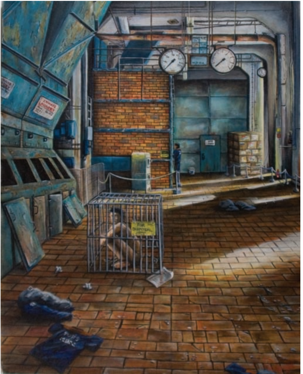
“Confiscated Goods,” Bryan Picken, 2009

Opposite page, top: “Omar’s Brothers: The Throw Away Generation?” Jamal Biggs, 2005