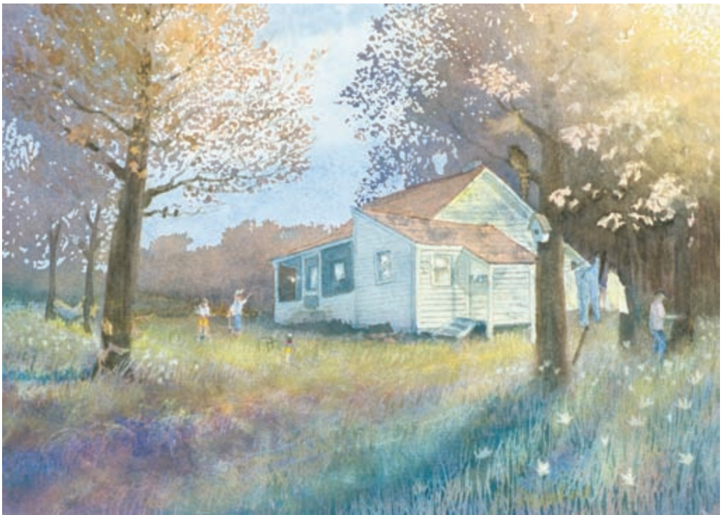
“Memory of Clark Lake Cottage,” Fred Mumford, 2005