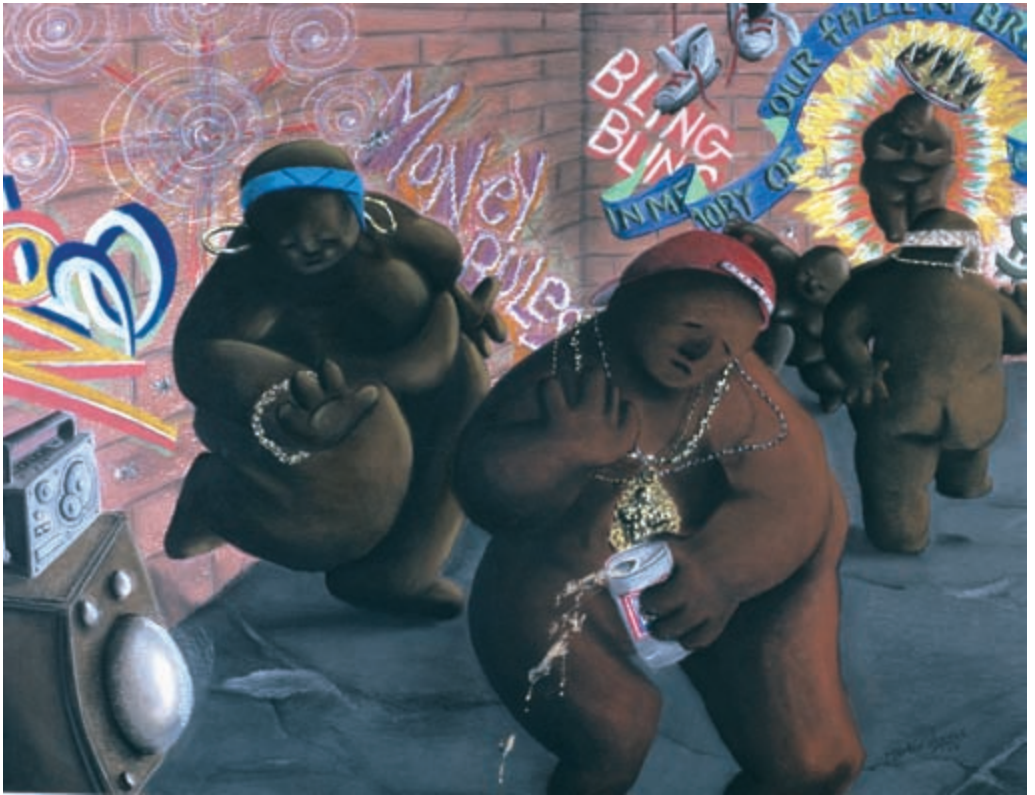
“Black Top Mourning,” Martin Vargas, 2000