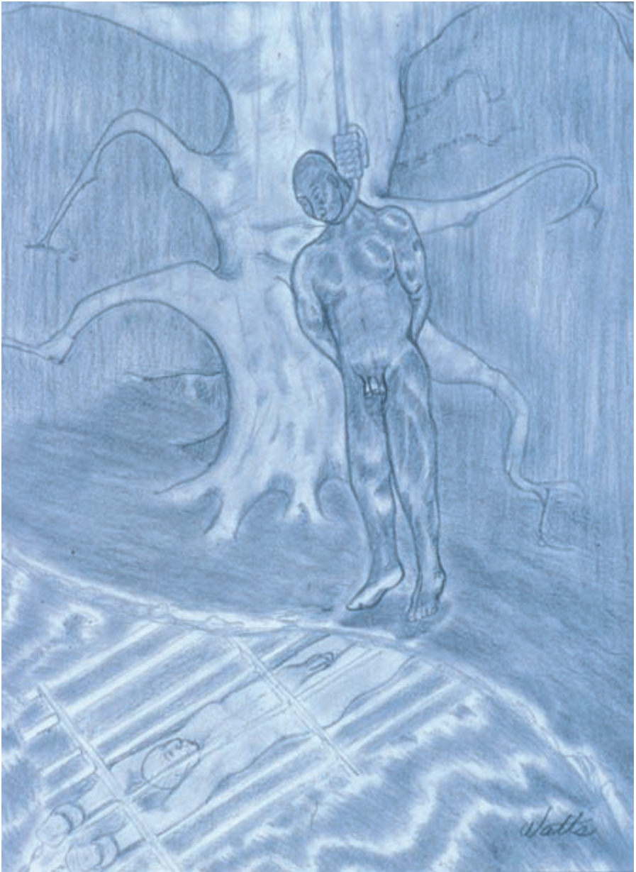
"From a Sea of Lost and Living Dead II," André Watts, 2002