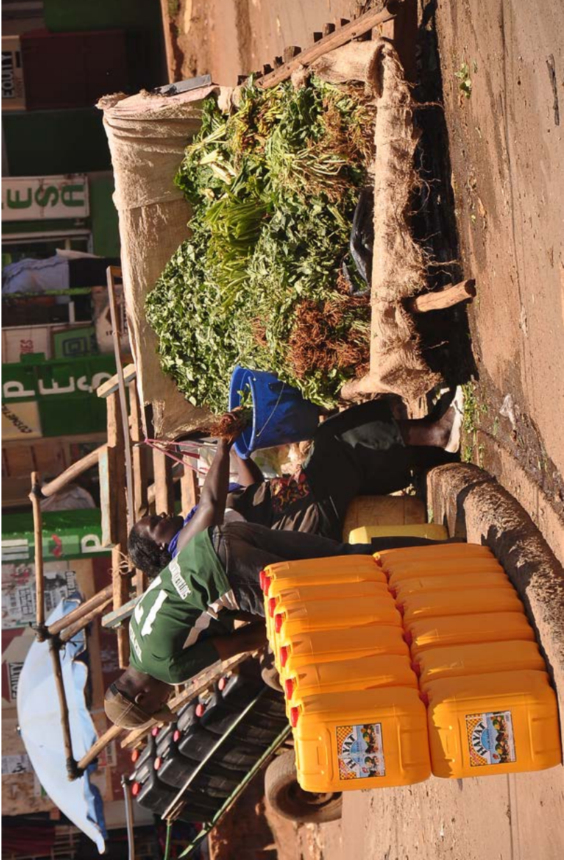
PLATE 13 Potable water for sale with fresh vegetables