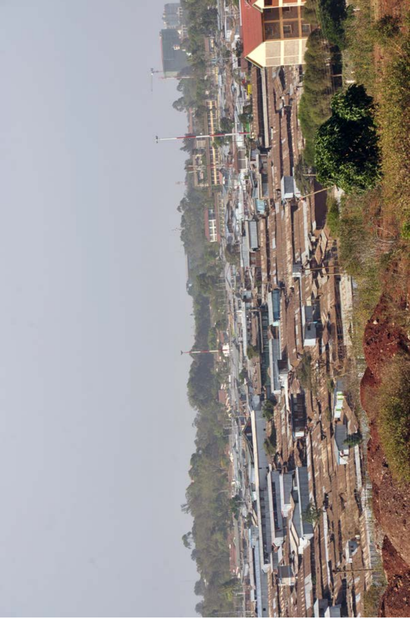
PLATE 2 A bird's-eye view of the African metropolis