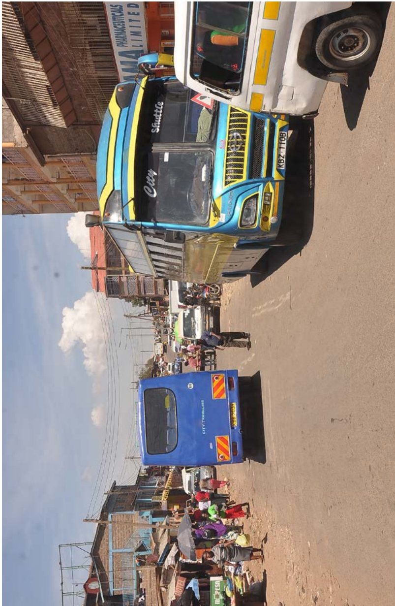
PLATE 7 Traders, vehicles and pedestrians compete for space in busy areas