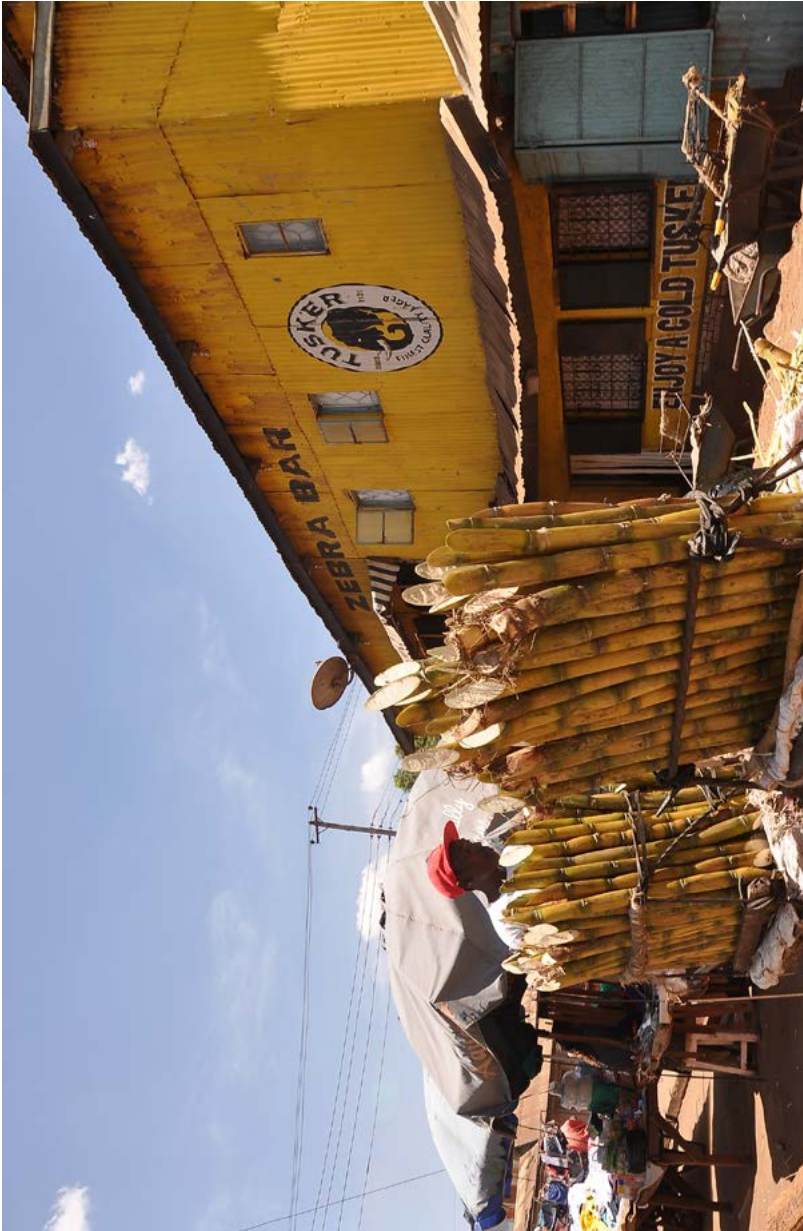
PLATE 12 Selling sugar cane