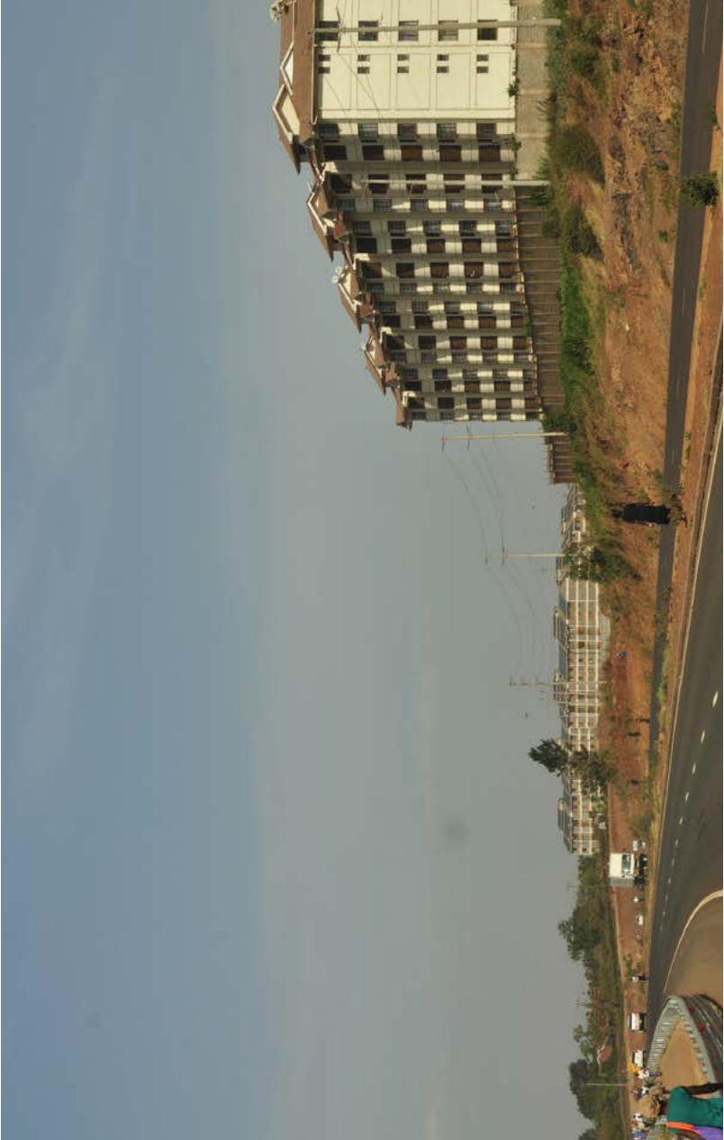
PLATE 4 City council-controlled and -serviced urban space