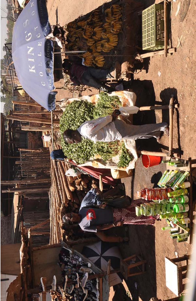
PLATE 10 Stalls selling wood, cosmetics, shoes and fresh produce