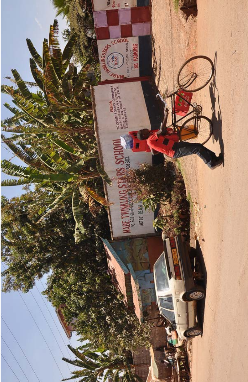
PLATE 8 Porters play a key role in transporting goods between the producers or wholesalers and the traders in the markets