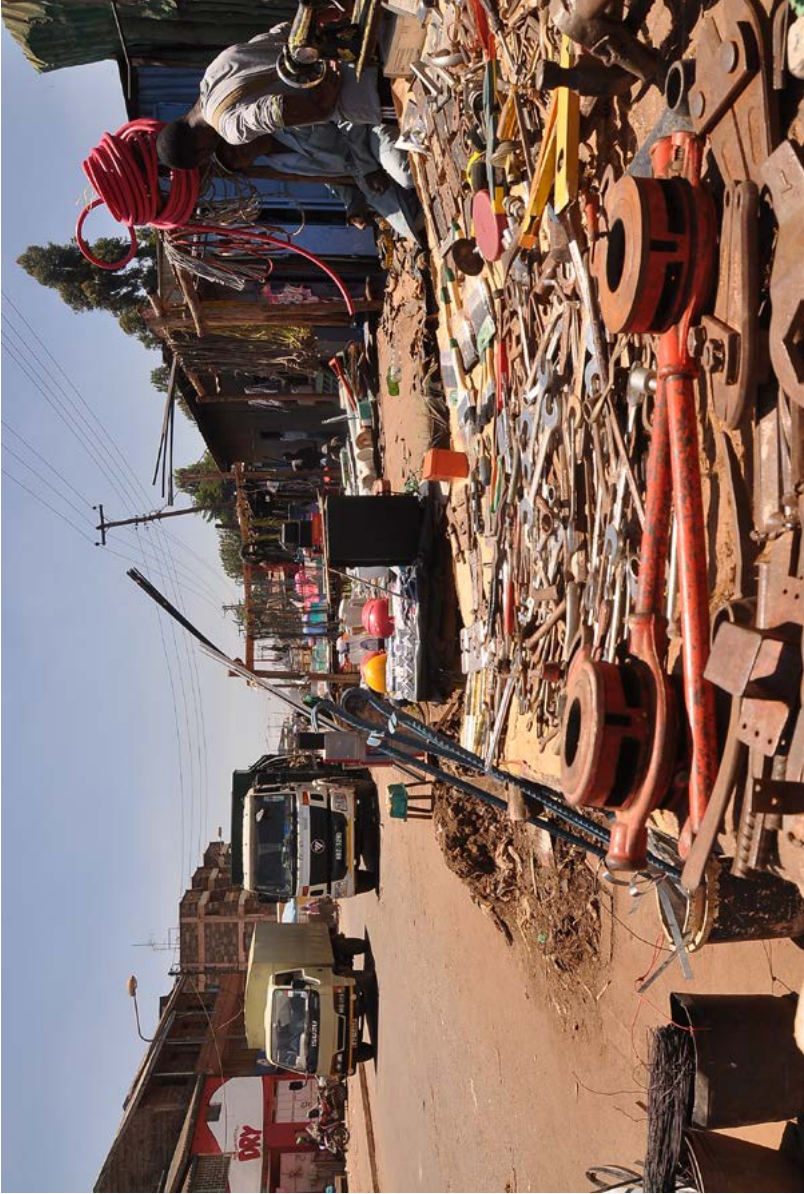
PLATE 15 Scrap metal, secondhand tools and electrical equipment