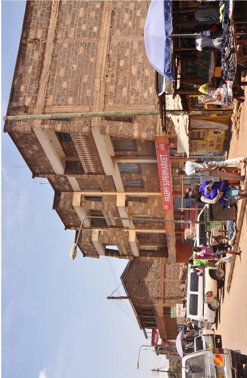
PLATE 5 Mixed trade and residential space in self-developed urban areas