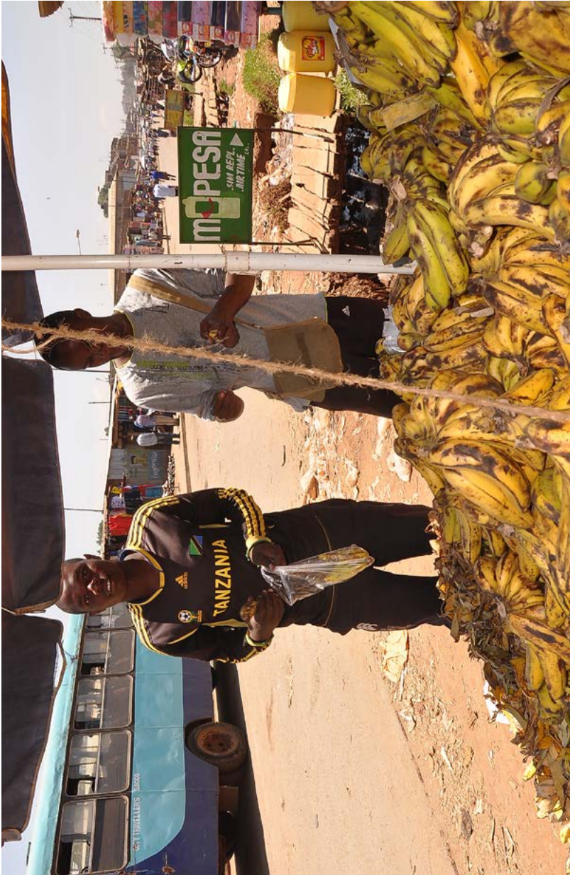
PLATE 14 Banana sellers outside an allocated market area