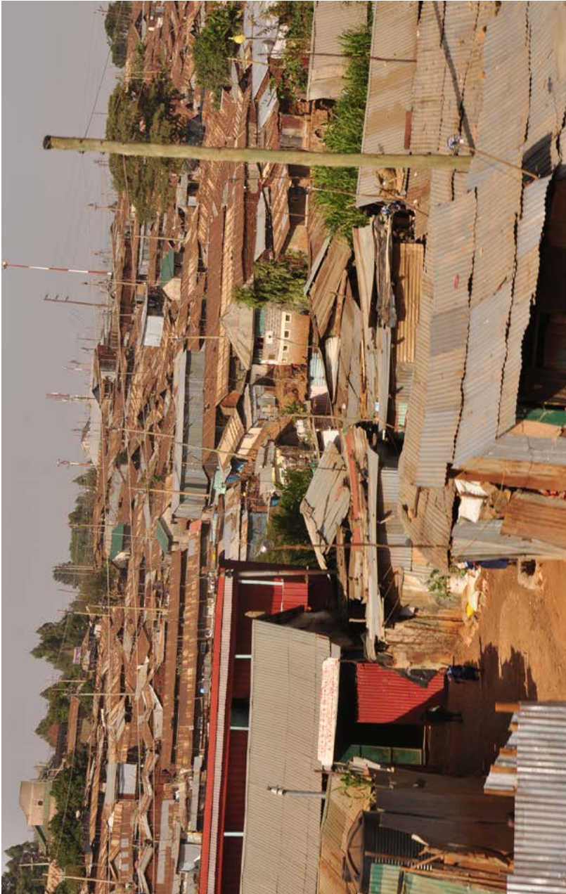
PLATE 3 An example of a slum settlement