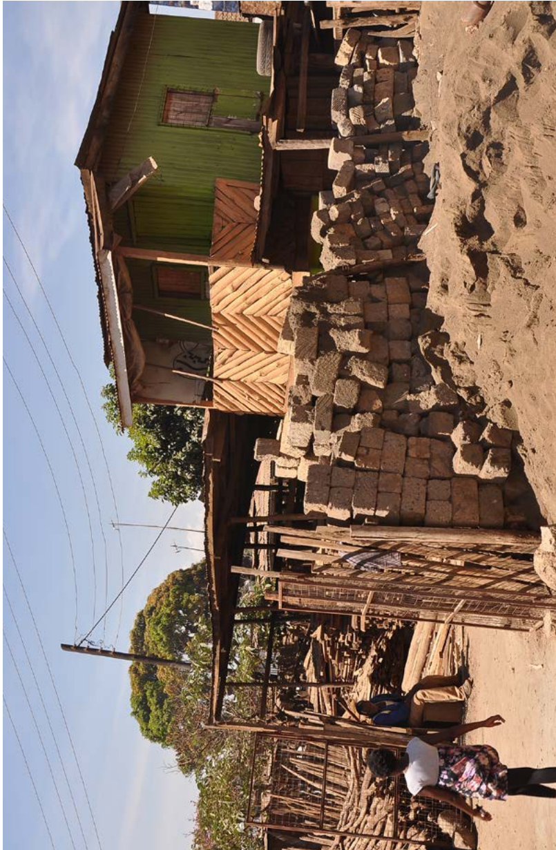
PLATE 11 A trader selling wood, sand, bricks and other building materials from his yard