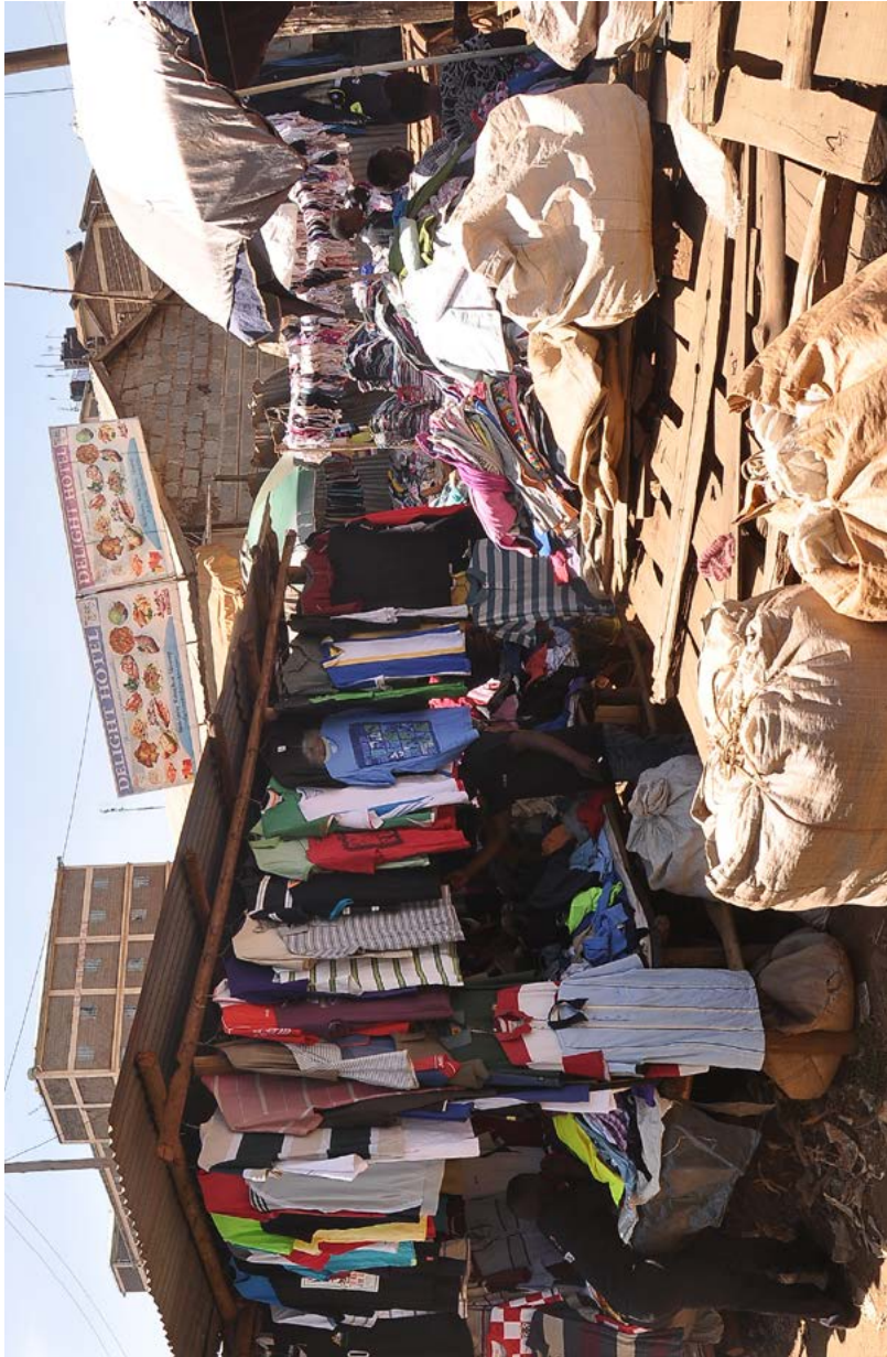
PLATE 9 A clothing market that sells both new and secondhand goods