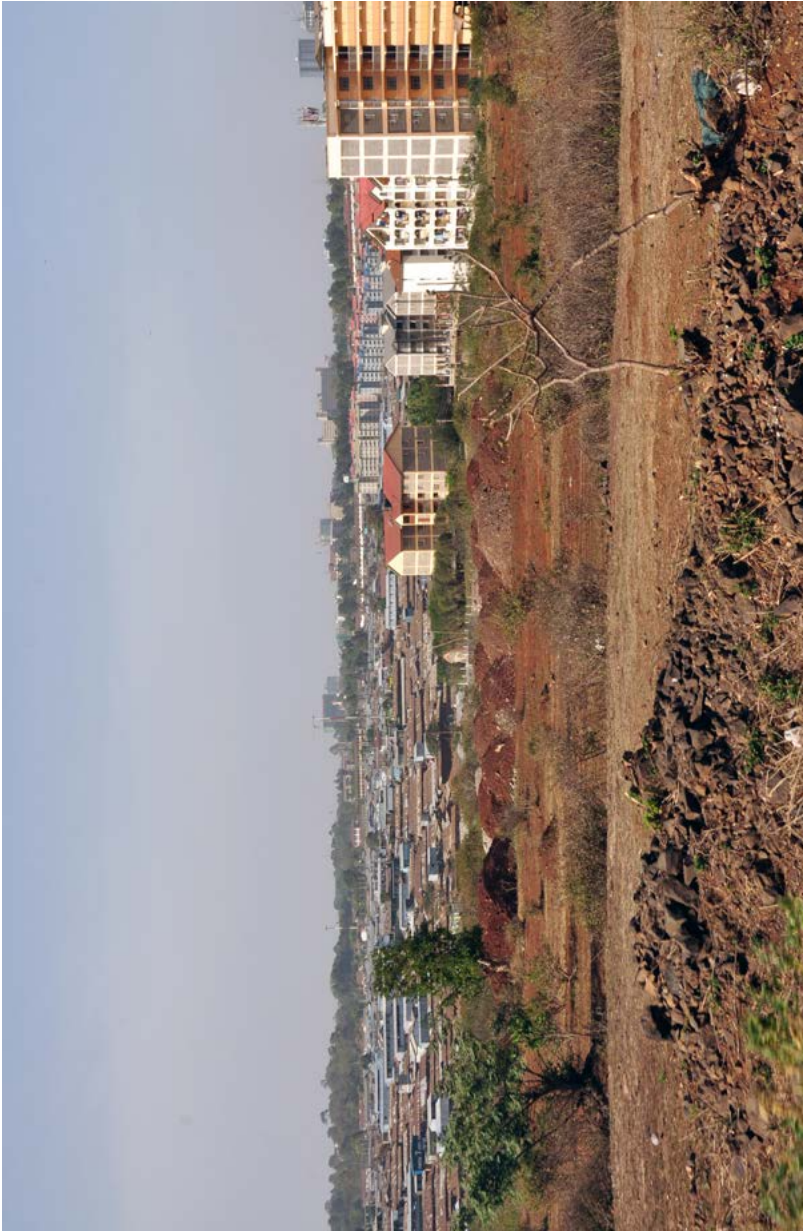
PLATE 6 An area typical of the self-developed urban fringes