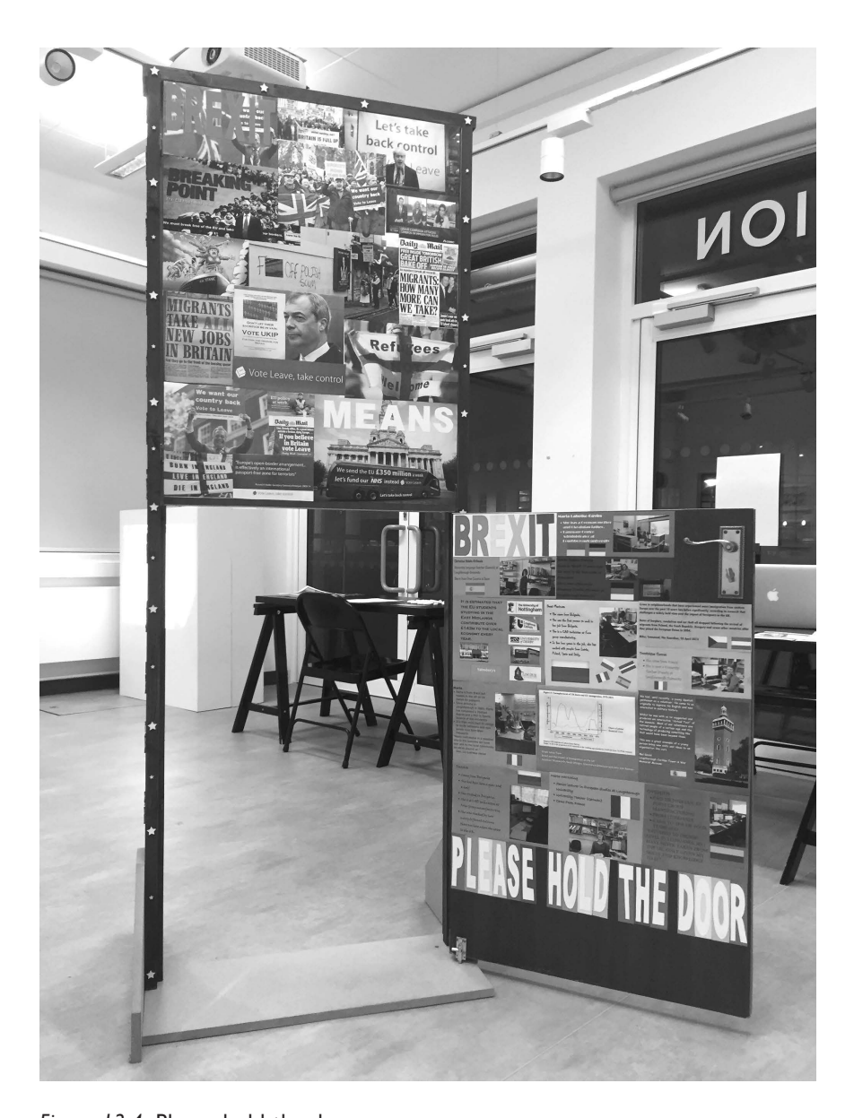
Figure 12.4 Please hold the door

ties between strangers in public spaces (Laurier and Philo, 2006). In their accompanying text, the participants recall how they were left 'in despair . . . hang[ing] our heads in shame' while watching the anti-immigration slogans from the Leave campaign on TV. Furthermore, inspired by Martin Niemöller's poem, 'First they came . . . ', the participants wanted 'to speak out' in favour of 'a post-Brexit Britain