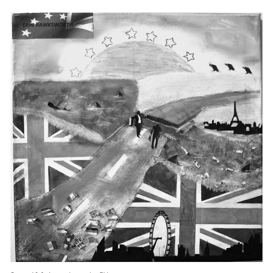
Figure 12.2 As we leave the EU