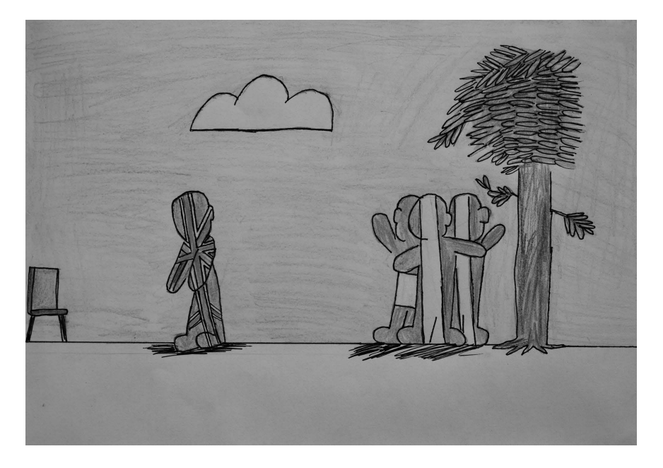
Figure 12.6 Conversation expectation

I am going to make a painting showing people wearing flags of their nation . . . and we will have a sad face . . . I feel that this will show how we will be left out of the group of friends, and I am concerned how that will feel. I am worried we may become isolated. It is like being left out of a group of friends you have had for a while.