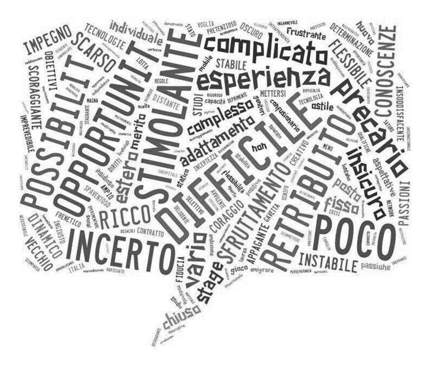
Figure 7.2 How would you describe work today?

A second open-ended question (the last question in the survey) asked participants to describe the work scenario from the perspective of a young adult. Similar to the other open-ended question, the body of text originating from this entry was processed to produce a 'content cloud' and an exploratory semantic analysis was performed. The word cloud in Figure 7.2 visually represents this analysis.