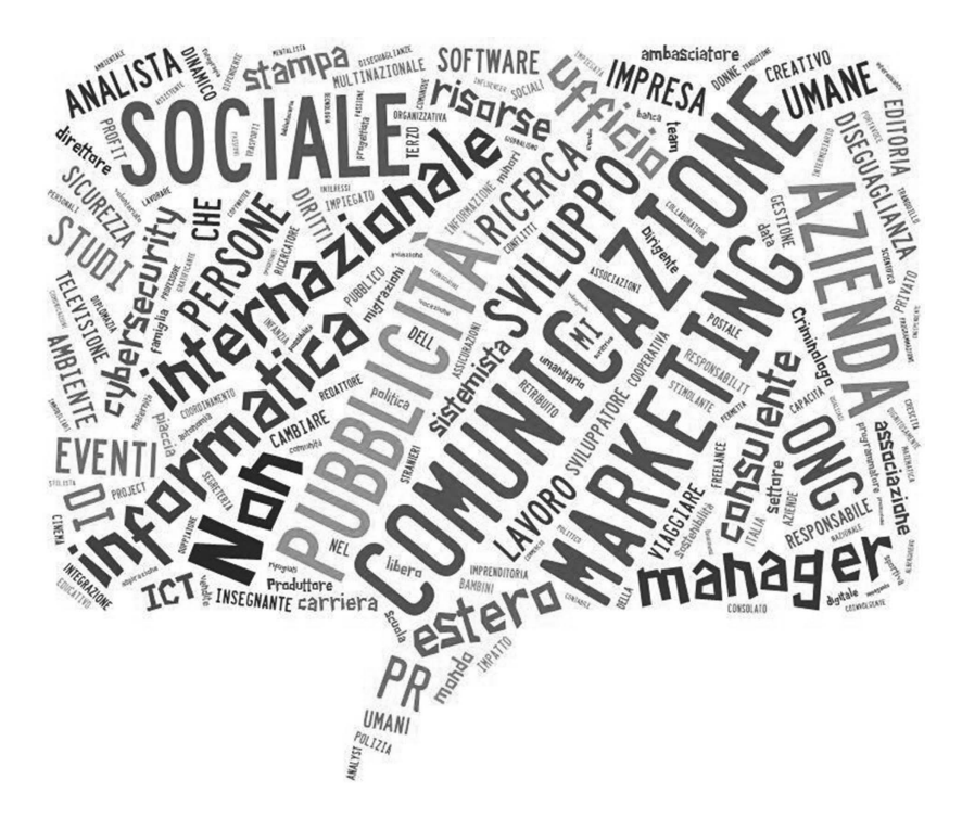
Figure 7.1 What work do you aspire to do?

On this same topic, the survey subsequently included two questions where participants were asked to determine the degree of agreement they had with the