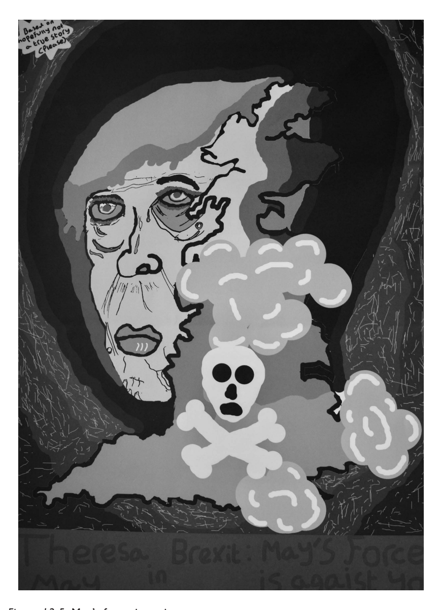
Figure 12.5 May's force is against you

A similarly unambiguous position emerges from Figure 12.5. The drawing symbolises the same traumatic experience and 'here and now' approach to Brexit