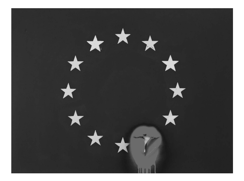
Figure 12.1 Bloodshot

Among the most commonly recurring feelings was a sense of traumatic shock (Seidler, 2018). Figure 12.1 depicts Brexit as a painted European Union flag with a bleeding hole punched through the canvas, replacing one of the stars symbolising the Union. Interestingly, it is not a British flag that is bleeding. This suggests that