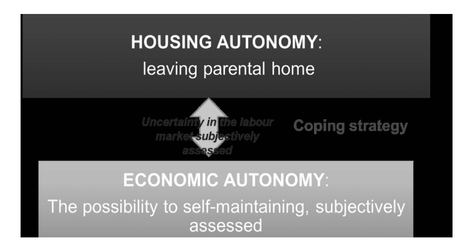
Figure 5.1 Conceptual map