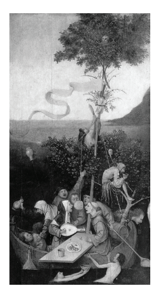
Fig. 1. Hieronymus Bosch, Ship of Fools (1490–1500)