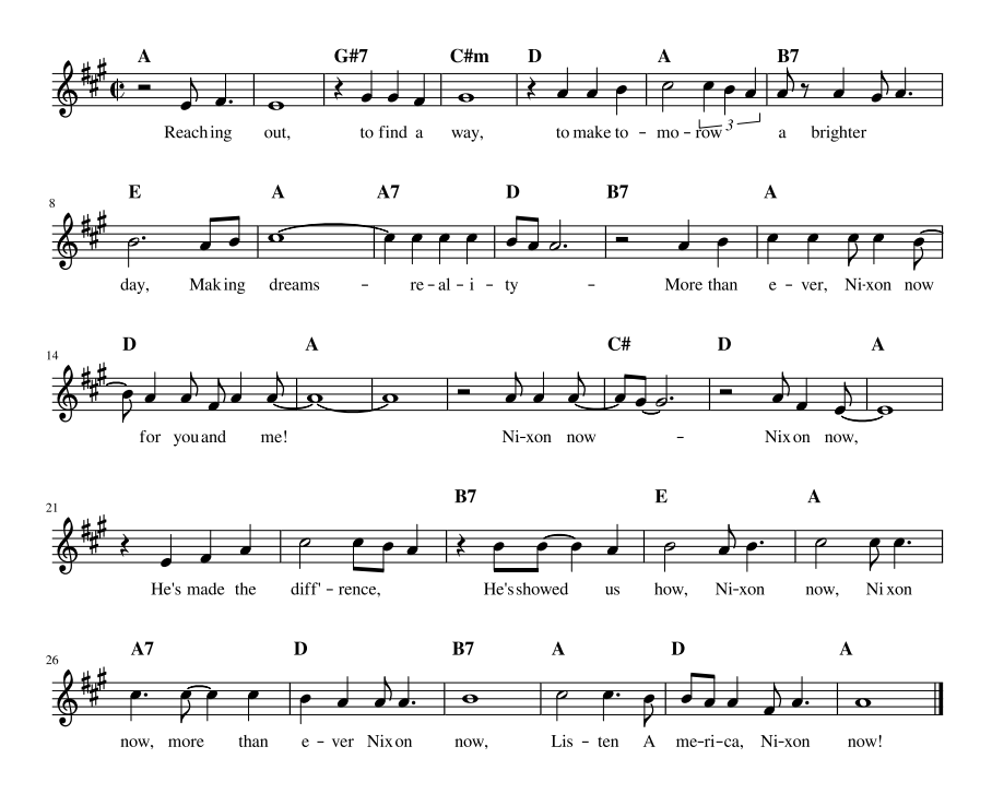
Fig. 6.1: Verse and chorus of "Nixon Now!"

alliteration of the repeated iterations of "Nixon Now" adds to the catchiness and memorability of the ad.