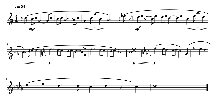
Fig. 9.1: Theme of Reagan's "Prouder, Stronger, Better"

Transcription of the main theme of "Morning in America"4