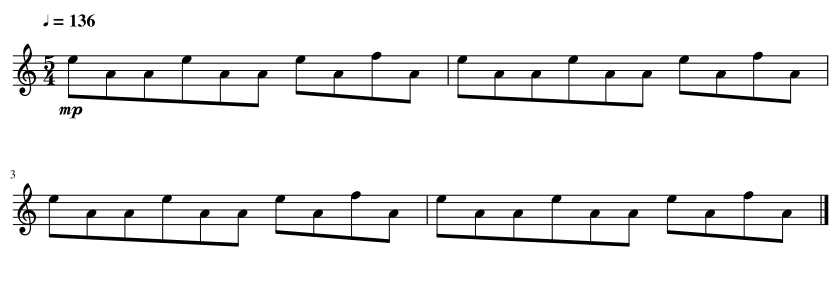
Fig. 9.3: Beginning of theme to Halloween II (1983) (transposed from F# minor)

The repetitive ostinato of "Limo" could be interpreted to musically depict "business as usual." Corruption is the way things always are and always will be in government, unless it is acted upon by an outside force. Often, piano figures in negative ads are ostinatos in minor keys and they often have a similar meaning.<sup>20</sup> In A minor, the theme of "Limo" is a bit slower than John Carpenter's Halloween theme in F♯ minor, and with a different meter. But it is similarly repetitive, almost mesmerizingly so.