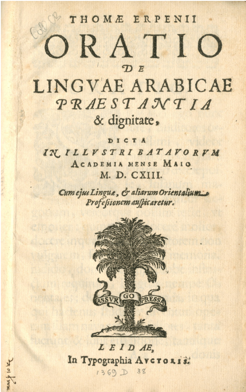
FIGURE 1.1 Oration of Thomas Erpenius (1584–1624) on the ‘Excellence and Dignity of the Arabic language’, May 1613 (printed Leiden, 1615 or later), title page.