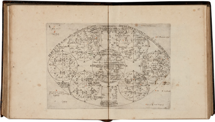
FIGURE 3.3 Zechendorff, Circuli conjugationum , Zwickau 1645, RSBZ.

today in a handful of copies suggests that it was not a great success. Among the few extant copies of this work there is one in the Zwickau Ratsschulbibliothek printed in 1645. Apart from a few minor changes to the title-page illustration, this 'edition' differs primarily in the greater number of plates (circular and rectangular tables) and the inclusion of Persian and Turkish 138 (Figures 3.2, 3.3 and 3.4). It should also be noted that the Zwickau library holds a manuscript of an unpublished introduction to Persian grammar by Zechendorff. Although undated, the handwriting, though unmistakably Zechendorff's, suggests an old, less firm hand. 139