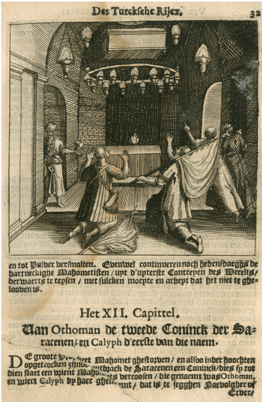
FIGURE 1.3 The coffin of the Prophet Muhammad miraculously floating in the air, in Anonymous, Historie van den Oorspronck ... des grooten valschen Propheetes Mahomets, Leiden, 1627, p. 23. [LEIDEN UNIVERSITY LIBRARIES, 1144 A 46]