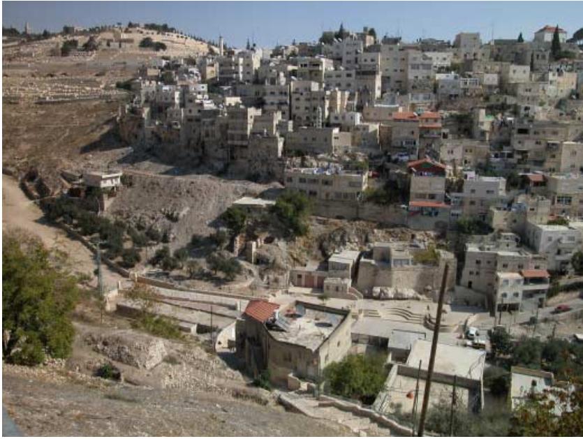
Figure 9.1. Confrontation in Jerusalem: Mt. of Olives and East Jerusalem.

ders and walls. Without discounting the real constraints that have been created by the wall and its limits, this approach also considers subtle interactions between segmented populations (Israeli and Palestinian, Jewish and Arab) and the ways in which these interactions shape links between these social worlds. We will thus highlight examples of acts of communication and the mechanisms actors use to continue exchange at the edges of Jerusalem and between Jerusalem and the Palestinian territories. These operations may seem improbable or minor. But is it possible to find a model of balanced justice that assumes this state of facts, and the possibility of exchanging within a space that is fragmented and conflictual? Does not the vision of a politics of co-presence offer an alternative to theories and abstract political scenarios in the search for a solution to the spatial and inter-community conflict of Jerusalem?