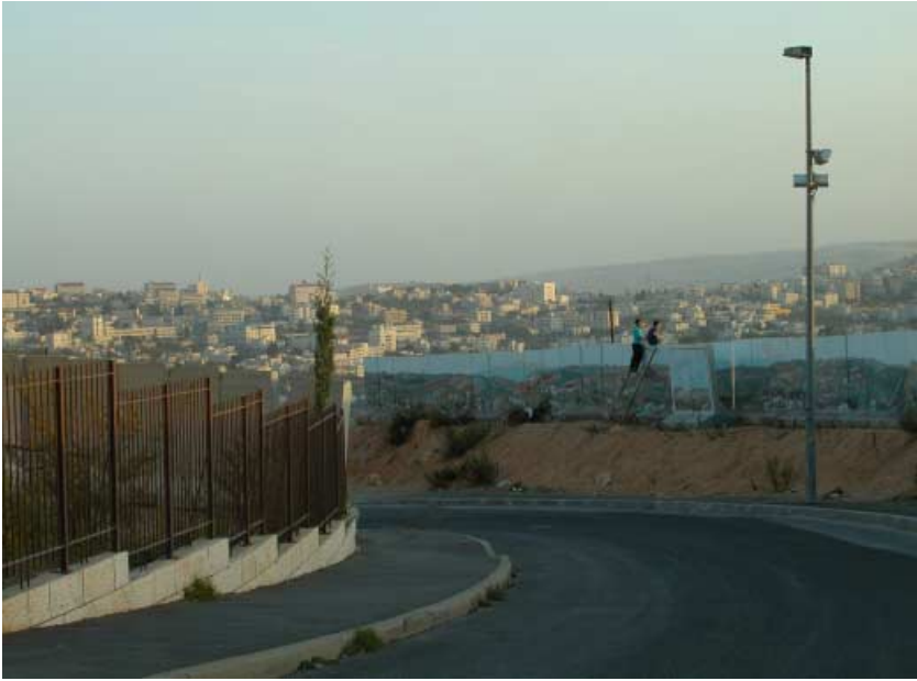
Figure 9.2. East Jerusalem.

suggest, however, that such a pragmatic approach to living together may form the basis for a politics beyond the communitarian, based on socio-economic rights and an equality of spaces. This vision of justice is based not on control of institutions but on spatial contiguity and social respect on the neighborhood scale. From a sociological perspective, it is not improbable that ordinary politics may make it possible to achieve a more equitable city. It requires that violence disappear so that democracy can take its place.