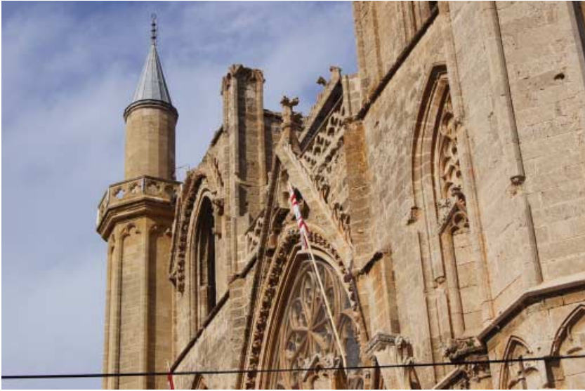
Figure 2.1. Minaret on the fourteenth century St. Nicholas Church in Famagusta, Cyprus, converted into a mosque after the Ottoman conquest in the sixteenth century. Aya Sofya mosque until 1954, then renamed Lala Mustafa Paşa Mosque.

marked by replacing the dominance of Muslim structures by dominant Christian ones.