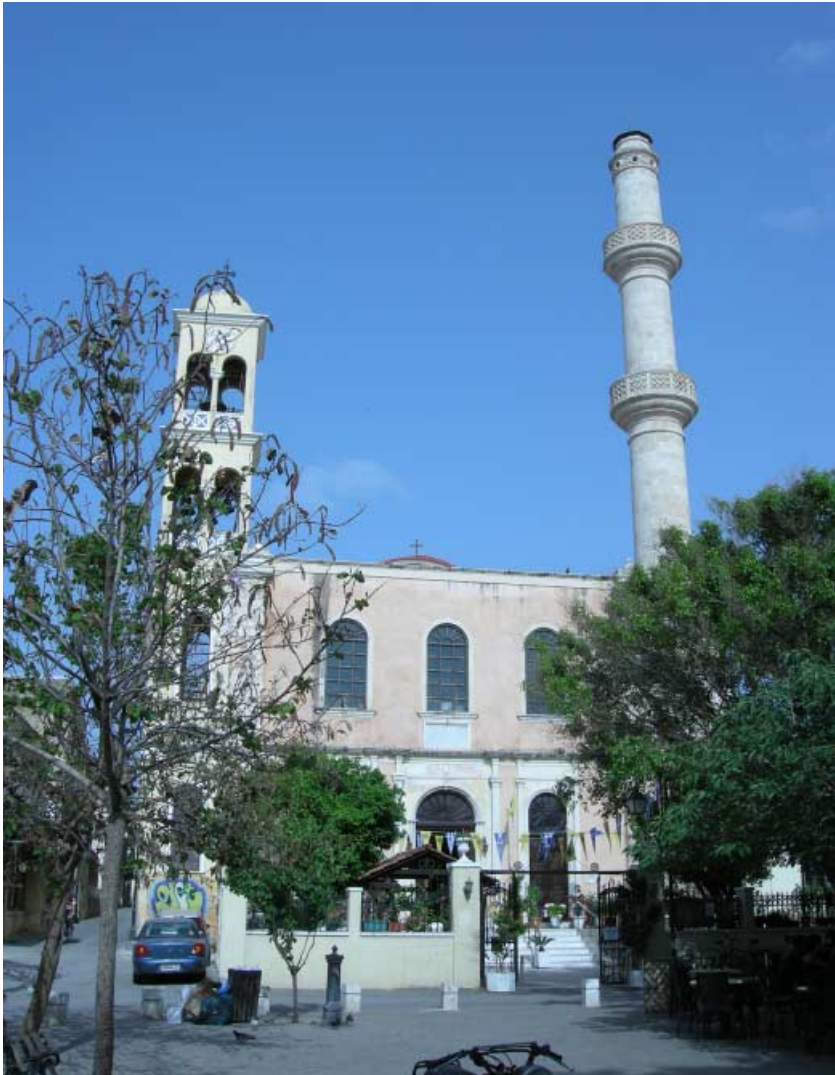
Figure 2.2. St. Nicholas Church, Chania, Crete. Venetian fourteenth century Catholic church, converted into a mosque by Ottomans in 1645, then into a Greek Orthodox church in 1918. Note truncated minaret (photo by Robert M. Hayden, May 2015).

While that uprising was suppressed in 1813, with Belgrade retaken and the church reconverted into a mosque, with the establishment of the Serbian principality in 1830 the power of the Ottomans was in decline, so that when they were finally forced to abandon Belgrade in 1867, only