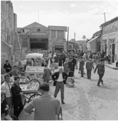
Figure 4.1. “View Near St. Sophia - Late 1950s.” The main municipal market Pantapolio/Bandabulya appears in the background.