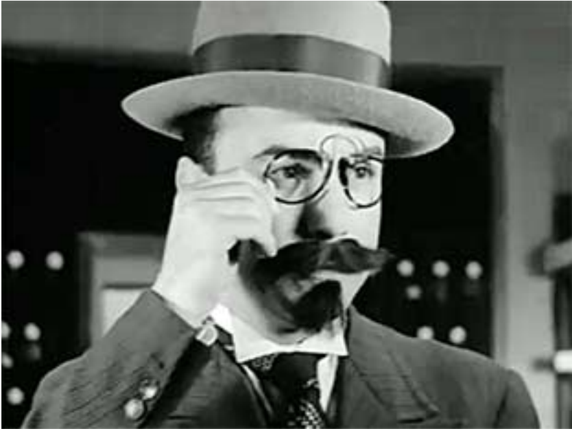
Figure 5.2. Hilmy disguised as Dr. Hilmy. Screenshot, Doctor Farahat (1935).