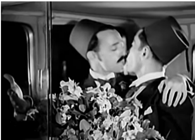
Figure 5.8. Chalom and ʿAbdu kiss. Screenshot, Mistreated by Affluence (1937).

By way of conclusion, I would like return to a brief scene that depicts the intersection of the two idioms of Levantine fluidity I have traced: