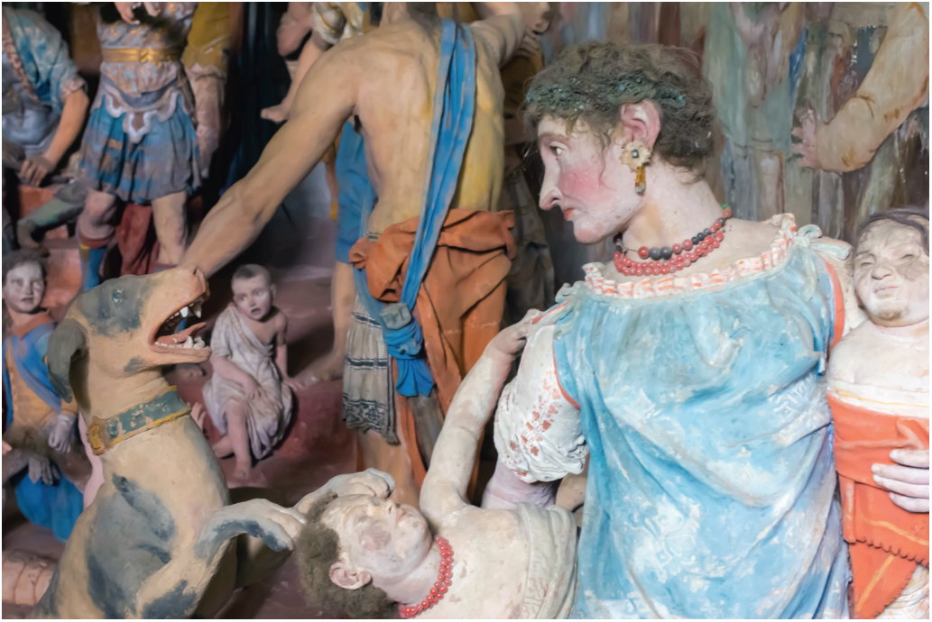
Fig. 4. Slaughter of the Innocents, Chapel XI, Sacro Monte di Varallo.