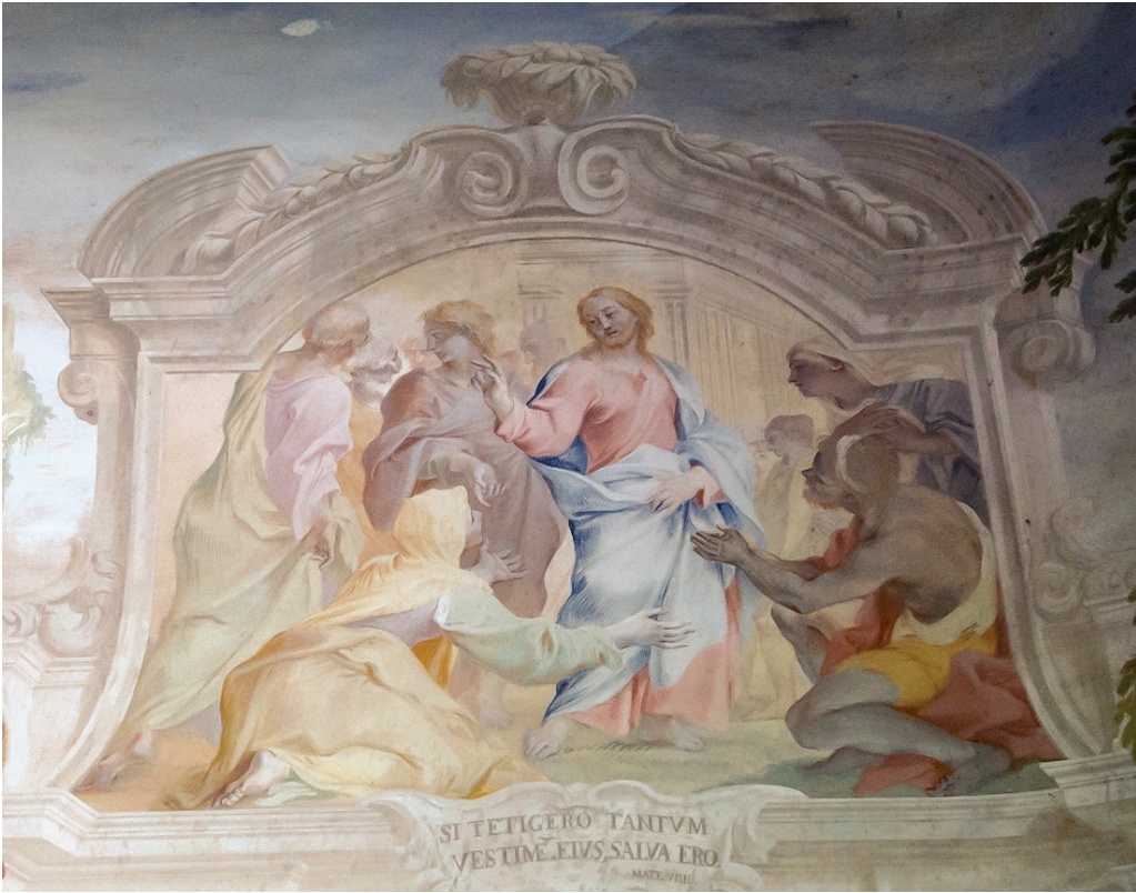
Fig. 60. Jesus and the Hemorrhaging Woman (Matt 9:20–22, Mark 5:25–34, Luke 8:43–48). Wall fresco, Chapel XVI, Sacro Monte di Orta.

and bystanders rather than the center of narrative action (Claire and Mary notwithstanding). Among the depictions of the physically impaired, women are a significant minority. But the woman with an issue of blood was a common subject in early Christianity, from catacombs and sarcophagi to reliquary caskets (such as the Brescia Box). 82 While the subject may have declined in popularity with Renaissance artists, there are examples from the period. 83 We can speculate that the image was included at Orta because it played a role in advancing the Tridentine agenda. According to Eusebius and early Christian tradition, there was a bronze statue of Christ with this woman, erected by the woman herself, at the gates of Ceasarea Phillipi. 84 Alexander Nigel points out that the statue is important evidence in the Catholic Reformation defense of images, as it provided proof for the use of