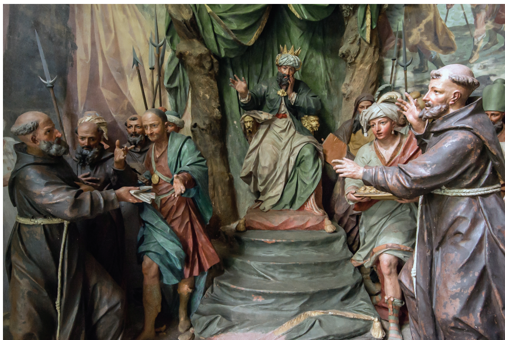
Fig. 52. St. Francis before the Sultan. Chapel XIV, Sacro Monte di Orta.