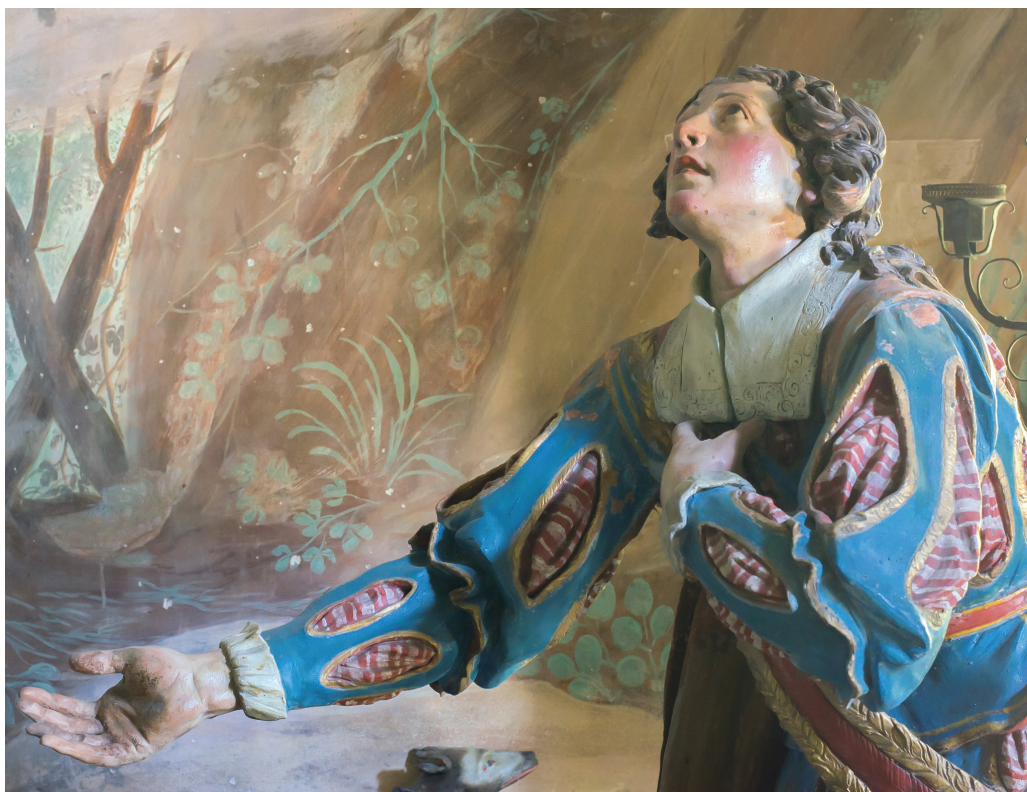
Fig. 1. Francis kneels beneath the San Damiano Cross. Chapel II, Sacro Monte di Orta.