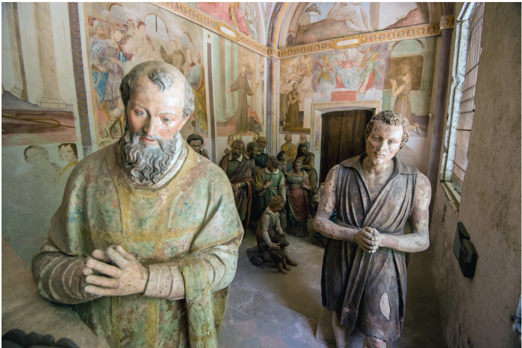
Fig. 17. St. Francis and the Priest, Chapel IV, Sacro Monte di Orta.