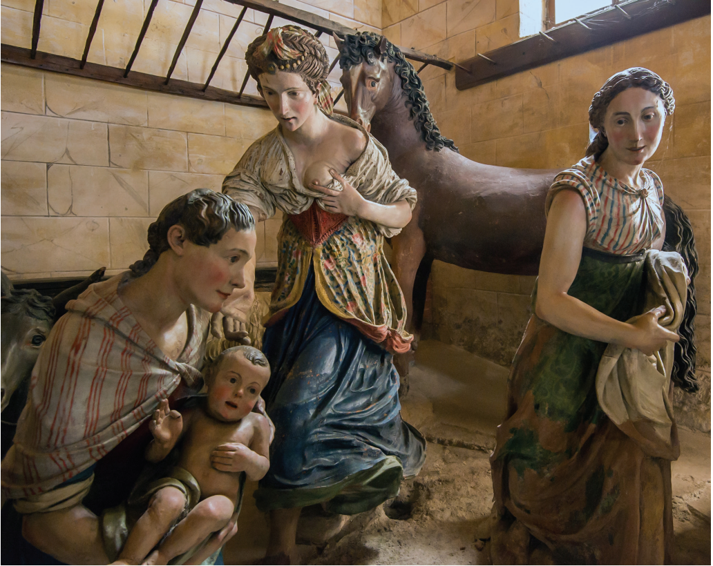
Fig. 2. The infant Francis with hand held in benediction, surrounded by attendants. Chapel I, Sacro Monte di Orta.

expose her breast. Her hair is in an elaborate coiffure intertwined with ribbons and a medallion. Her costume, which includes a broad red girdle and an intricate apron of seemingly expensive material over a full dark skirt is clearly a fine garment. The careful detail with which it is painted certainly suggests that a popular style is being referenced: it resembles those in near-contemporary bourgeois portraits recorded by Racinet as well as surviving local antique costumes of the Ossolano valley. 11 As such, these material objects bring home the meaning to the female viewer—that she, too, can affectively imagine motherly attentions to the baby. Here, the explicit exhortation to venerate Francis, and through him Jesus, is made in the relationship among the particulars of the story, the general truth it illustrates, and the devotional response of the audience. This chapel makes the birth real