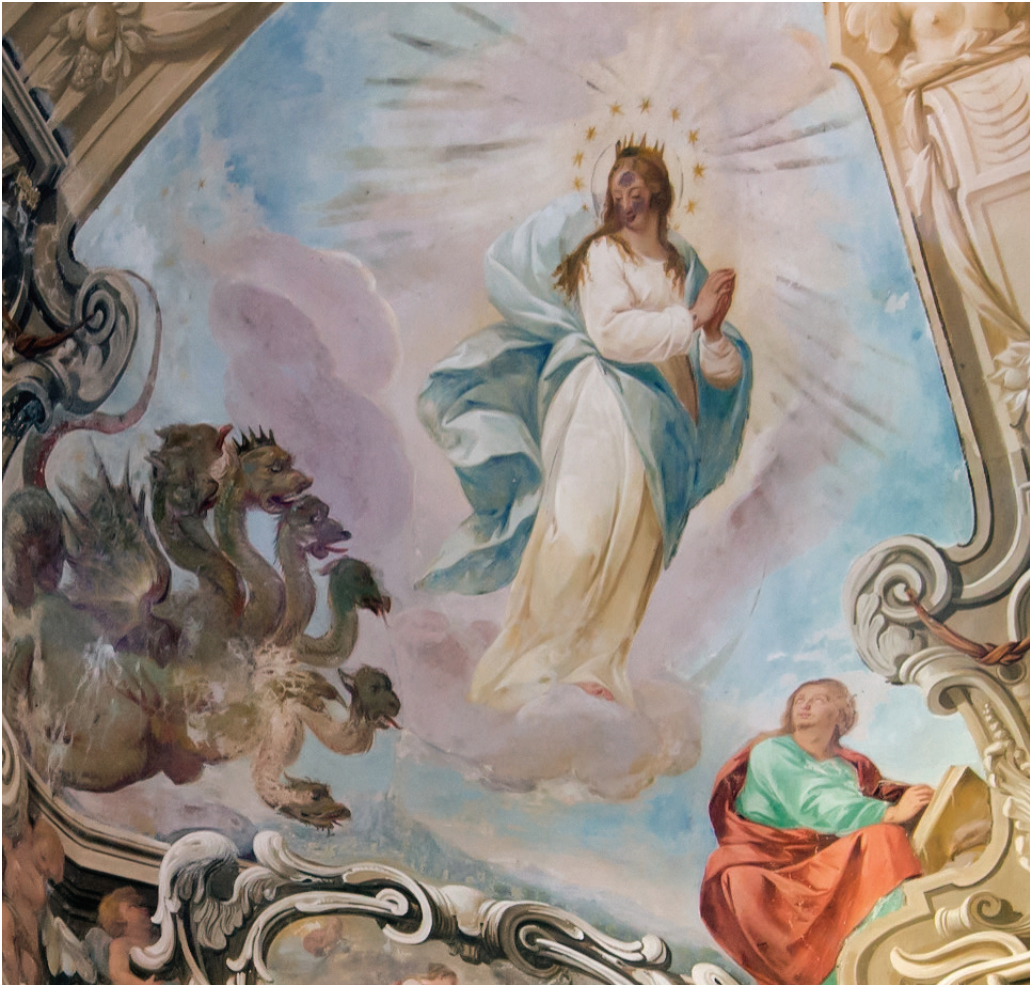
Fig. 4. Lady of the Apocalypse. Chapel X, Sacro Monte di Orta.

devil (see Fig. 3). As recorded in Matthew 4:1–11, Jesus dealt with three temptations: stones to bread, challenging death, and ruling the world. Above these, scenes from Revelation, including the lady of the apocalypse with twelve stars in her crown and the dragon with seven crowned heads, decorate the ceiling (see Fig. 4). Many other motifs are scattered throughout so that altogether at least fifty stories from the Old Testament, the New Testament, Christian hagiography (such as the story of Lucia who is here depicted holding a palm branch, a common symbol of triumph over evil), and the life of