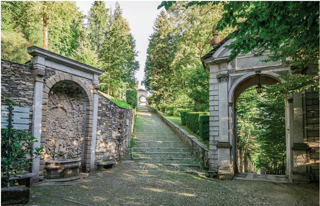
Fig. 6. Back side of the Entrance Arch (right) and purification Fountain (left). Sacro Monte di Orta.