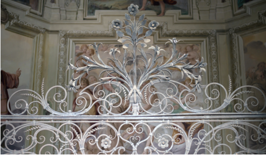
Fig. 61. The ornate grill separating the vestibule and the nave of Chapel XVII. Sacro Monte di Orta.