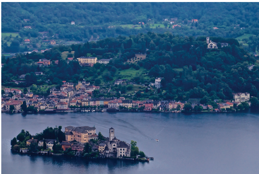
Fig. 3. Panoramic view of the Sacro Monte di Orta National Park (largely shielded by the dense foliage) with Isola San Giulio and the comune of Orta San Giulio in the foreground.