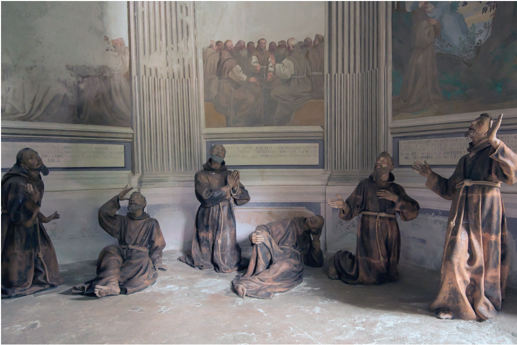
Fig. 30. The friars are awakened by Francis in his Chariot of Fire. Chapel VIII, Sacro Monte di Orta.

ny preach about the crucified Christ. Each of these subjects stresses the relationship between Francis and Christ, indeed, Francis as a second Christ. Like Jesus appearing before his disciples (Matthew 28:16–20; Luke 24:13–52), so Francis appeared to his followers. 39 Furthermore, in making the connection even more explicit, Celano (and Bonaventure after him) notes that at Arles, Francis appeared “lifted up in the air with his hands extended as if on a cross.” 40