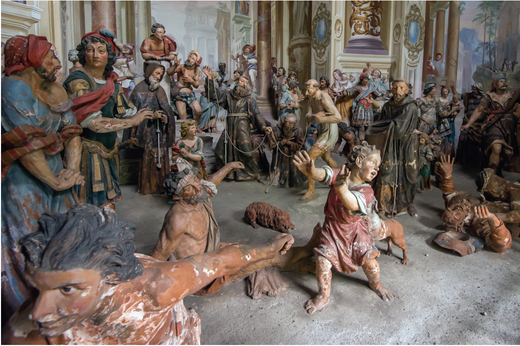
Fig. 47. Carnival celebrants surround (and largely ignore) St. Francis. Chapel XIII, Sacro Monte di Orta.

Assisi. When he reached the city gate, he commanded the brother who was with him to tie a cord around his neck and drag him through the whole city as if he were a thief, loudly crying out: “Look! See this glutton who grew fat on the flesh of chickens that he ate without your knowledge.” Many people ran to see this grand spectacle and, groaning and weeping, they said: “Woe to us! We are wretches and our whole life is steeped in blood! With excess and drunkenness we feed our hearts and bodies to overflowing!” They were touched in their hearts and were moved to a better way of life by such an example. 63