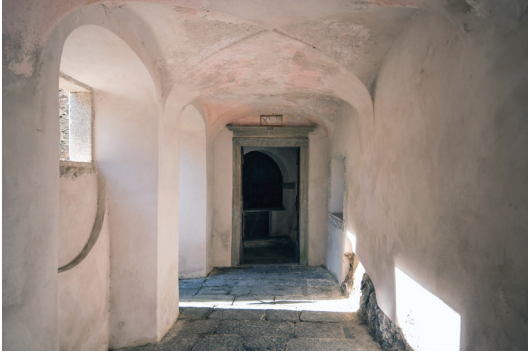
Fig. 66. Exterior of Chapel XVIII, The Vision of St. Francis in the Crypt. Sacro Monte di Orta.