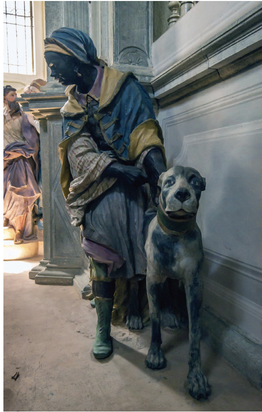
Fig. 73. A woman brings a dog to the crypt of St. Francis. Chapel XIX, Sacro Monte di Orta.

As pilgrims ascend the stairway from Chapel XVIII to Chapel XIX (ca. 1591–1670) (see Fig. 71), through verisimilitude they move from the crypt to the Lower Basilica of Assisi with its ornamental frescos and white marble statues of Peter, David and Solomon. Chapel XIX celebrates the healing power of St. Francis, extolled by Bonaventure, among others. In a series of small vignettes set around a railing (where an opening to the crypt below would normally be), the almost two-dozen statues depict pilgrims at various moments during their petitions (see Fig. 72). The demographics represented by the statues reflect many different strands of society: male and female, adult and child, rich and poor, white and Black, soldier and civilian, and even a large dog (see Fig. 73). Throughout the chapel’s vignettes, body positions create intimate conversations all the while gestures point toward the opening to Francis’ crypt. Thus the pilgrim’s gaze is guided through each vignette, but is ultimately directed back to the tomb of the saint. The central focus remains on St. Francis as the chapel promulgates his reputa-