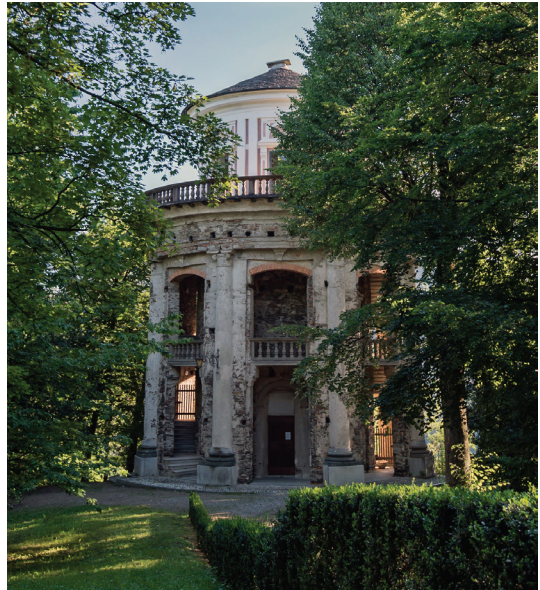
Fig. 80. Exterior of the New Chapel, whose completion was disrupted in 1795 by Napoleon's elimination of religious orders. Sacro Monte di Orta.

and piazzas along the pilgrimage route, such as Viale di Frate Vento (Avenue of Brother Wind) near Chapel V (see Fig. 82) and Piazzale di Frate Sol (Brother Sun Square) near Chapel XIII (see Fig. 83).