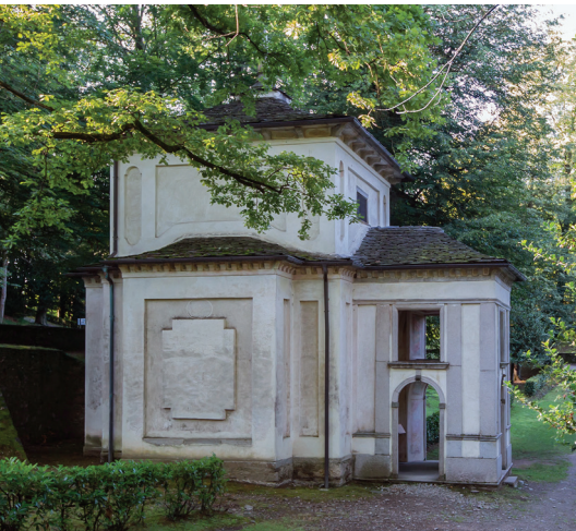
Fig. 32. Exterior of Chapel IX, St. Clare Takes the Veil. Sacro Monte di Orta.

absolutely safe for all to follow his life and teaching. 42