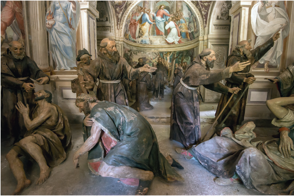
Fig. 22. View from the vestibule into the Nave and Apse of Chapel VI. Sacro Monte di Orta.

“Go, my dear brothers,” he said to them, “two by two through different parts of the world, announcing peace to the people and penance for the remission of sins. Be patient in trials, confident that the Lord will fulfill His plan and promise. Respond humbly to those who question you. Bless those who persecute you. Give thanks to those who harm you and bring false charges against you, for because of these things an eternal kingdom is prepared for us.” 30