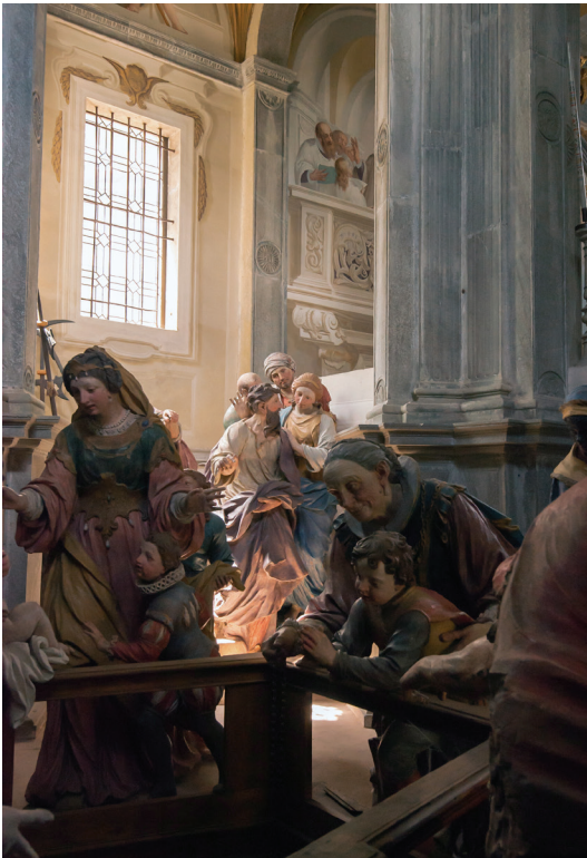
Fig. 72. Miracles cure the crowds who gather at the crypt of St. Francis. Chapel XIX, Sacro Monte di Orta.

XVIII (“the crypt”) is, predictably, quite dark. A local Ortan artist named Giacomo Filippo Monti painted the frescos though few of the largely ornamental designs survive. The frescos of Chapels XIX (again, largely ornamental motifs) and XX (narrative and figural) were done by Antonio Busca. Dionigi Bussola created the statues in Chapels XVIII and XX, while Giuseppe Rusnati crafted the figures in Chapel XIX. The frescos of Chapels XIX (again, largely ornamental motifs) and XX (narrative and figural) were done by Antonio Busca. The ironwork of both Chapels XIX and XX was crafted by Giuseppe Malcotto da Borgomanero.