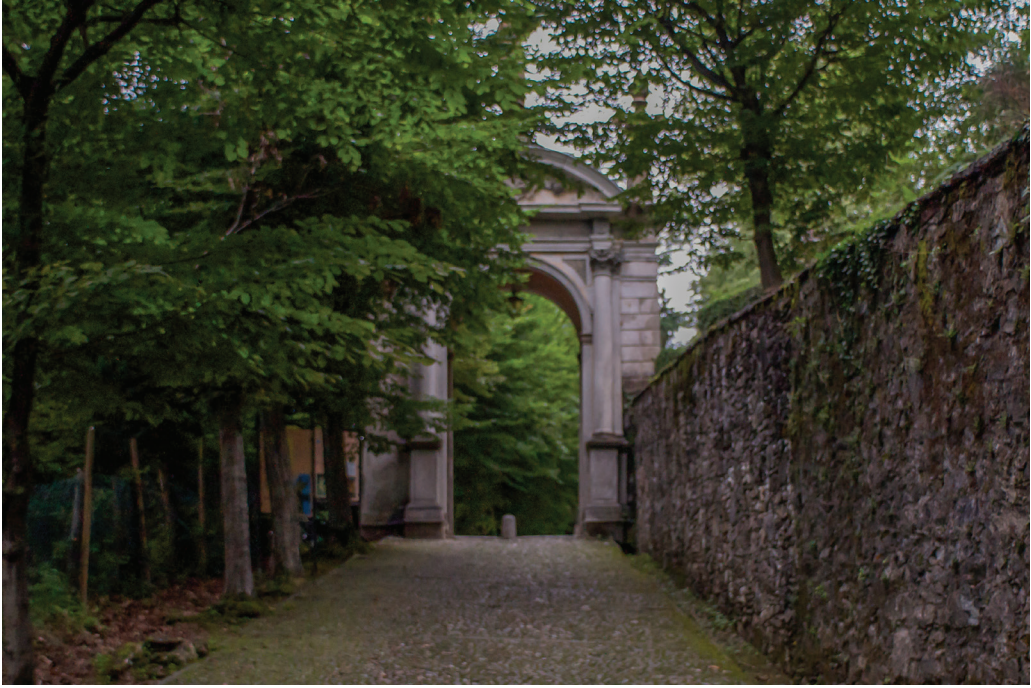
Fig. 5. The pilgrim's approach to the Sacro Monte di Orta and the Entrance Arch along the Via del Sacro Monte.