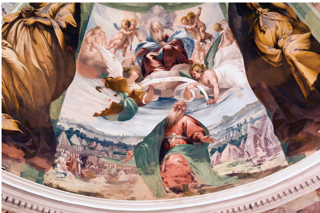
Fig. 27. God looks down upon Moses in the Wilderness. Ceiling fresco, Chapel VII, Sacro Monte di Orta.