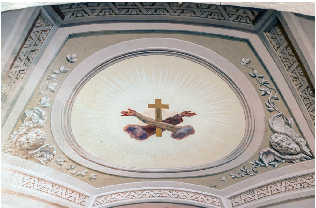
Fig. 5. The Franciscan Coat of Arms, Sacro Monte di Varallo.