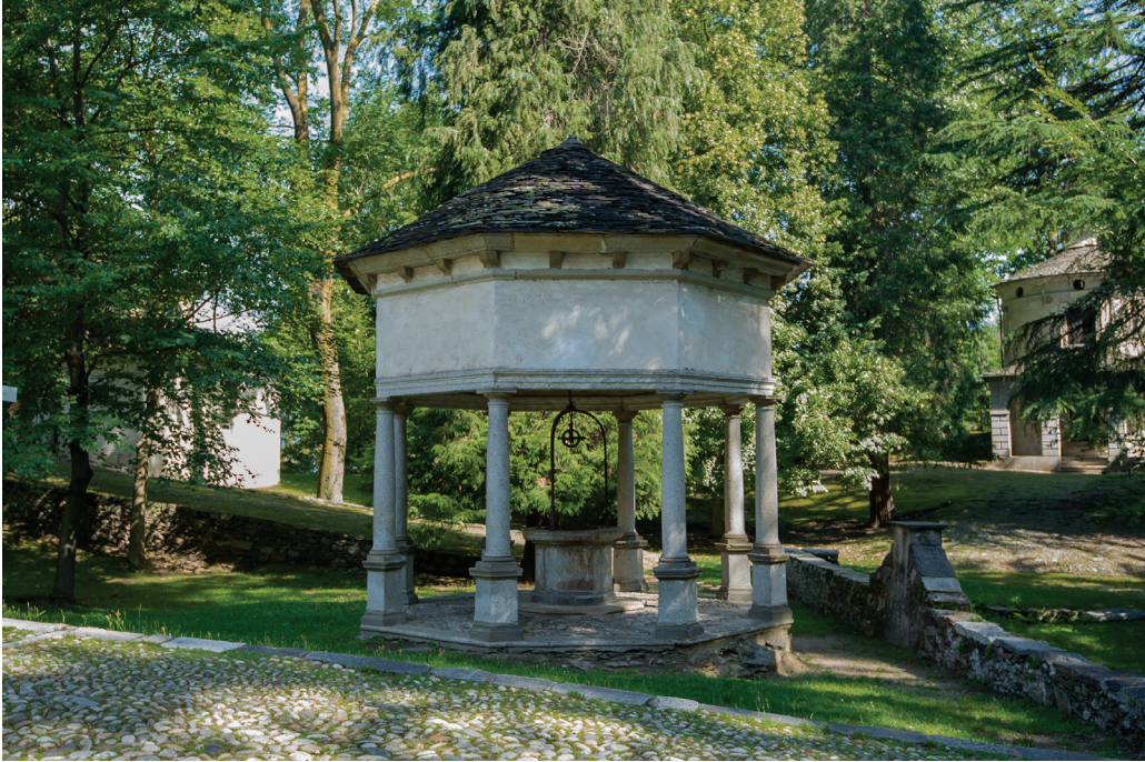
Fig. 8. The Well at the Sacro Monte di Orta.

Chapel V, “Francis gives the habit to his followers,” and Chapel XVI, “Francis returns to Assisi to the acclaim of many.” It is striking, however, that many of Francis’ important and famous teaching moments concerning the essential Christian teachings on faith and works are missing; preaching to the birds and the wolf of Gubbio are among the most notable absences.