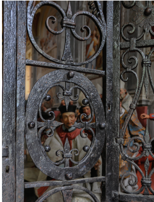
Fig. 2. The pilgrim’s gaze is engaged with that of a terracotta statue through a peephole in the iron screen of Chapel XX, Sacro Monte di Orta.

The decision to build a pilgrimage site on the heavily forested mountaintop above the colorful lake town of Orta was made by the city in 1583 (see Fig. 3). Abbot Amico Canobio oversaw the design and initial construction of the chapels, supported by his own commission of Chapels XVIII, XIX, and XX. 95 By 1593, Carlo Bascàpe, bishop of Novara, was given supreme authority over the construction, and funding came from guilds, organizations, and local families. Brother Cleto di Castelletto Ticino became the chief architect and designed the layout for the entire park. Bascàpe’s frequent site visits and precise instructions about the content of each chapel illustrate his meticulous concern about the ways the chapels were to be read. 96 The selection of particular scenes from the