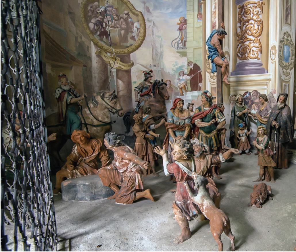
Fig. 2. Children, animals, revelers, and King Carnival in Assisi. Chapel XIII, Sacro Monte di Orta.

food for them when needed. He himself would eat to prevent a brother from following his own extreme example: “He had sympathy for all who were ill and when he could not alleviate their pain he offered words of compassion. He would eat on fast days so the weak would not be ashamed of eating, and he was not embarrassed to go through the city’s public places to find some meat for a sick brother.” 6