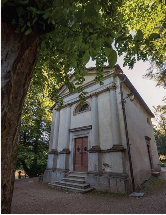
Fig. 12. Exterior of Chapel III, St. Francis Renounces his Worldly Goods. Sacro Monte di Orta.

shape, thus turning the garment into a statement of his faith.