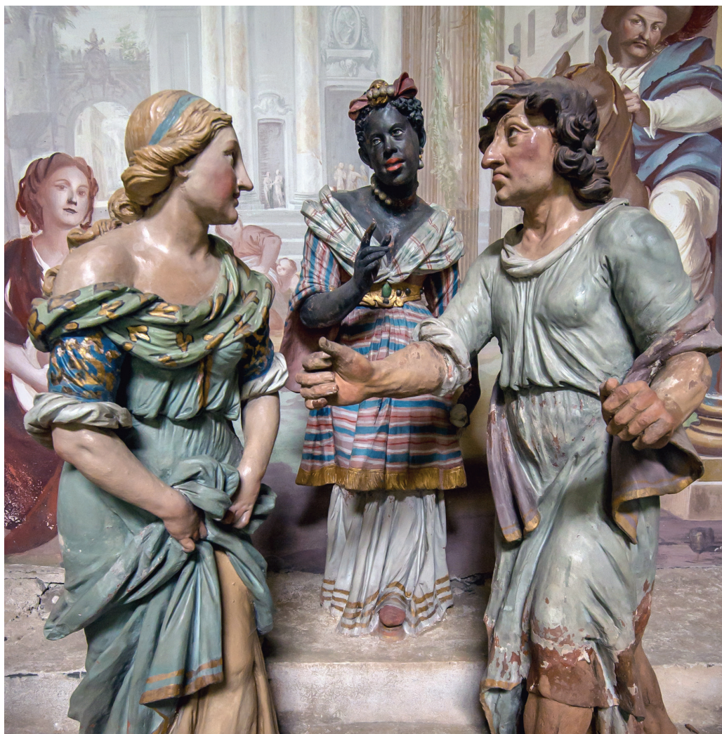
Fig. 4. A well-dressed Black woman among the Revelers at Carnival in Assisi. Chapel XIII, Sacro Monte di Orta.

strengthen the affective identification and encourage the pilgrims' self-examination.