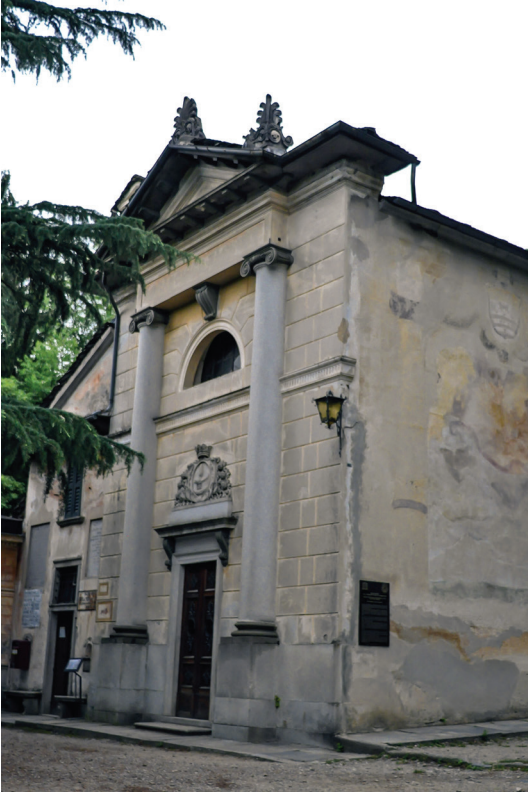
Fig. 2. Exterior of Chapel I, The Nativity of Francis. Sacro Monte di Orta.

architect Paolo Gaudenzio Rivolta. For the interior decoration, the frescos by Bernardo and Giacomo Filippo Monti were completed in 1615, and the terracotta statues of sculptor Christoforo Prestinari were installed by 1617. Funding for the chapel is variously attributed to the citizens of Orta, a local tinsmiths guild, and terracotta artists from France and Spain. 12