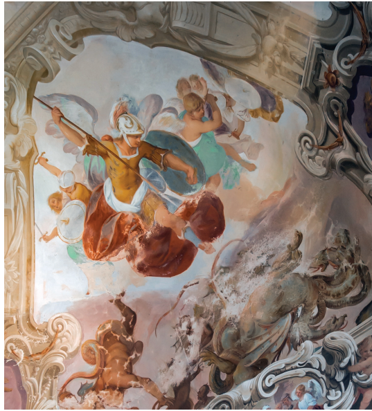
Fig. 39. Archangel Michael battles a dragon. Ceiling fresco, Chapel X, Sacro Monte di Orta.

In a series of larger panels along the vault we see the woman of the Apocalypse with her crown of twelve stars (Rev 12:1, 2, 5), who is commonly identified as Mary or as the Church (see Chapter 5, Fig. 4). A portrait of St. John writing what is presumably the Book of Revelation appears in the corner of the painting. In an adjacent panel Mary protects the infant Jesus from a fiery dragon (the Devil) by giving him to God (Rev 12:5). Continuing the sequence of scenes from Revelation is a panel that features archangel Michael battling an apocalyptic dragon (Rev 12:7; see Fig. 39).