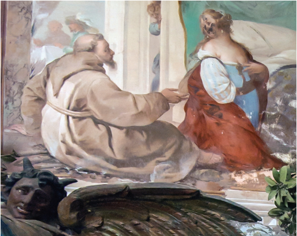
Fig. 5. Francis rejects Frederick II's Concubine. Chapel X, Sacro Monte di Orta.

the left of the door, shows Francis kneeling in prayer in front of the crucifix while being assailed by a variety of vividly colored demons. Its inscription, quoting Mark of Lisbon's Croniche , reads "Saint Francis tormented greatly by the demons whom he defeats with help from the Lord." 8 The second panel on the pilgrim's left illustrates a little-known story in which, according to the inscription again from the Croniche , Francis kneels on hot coals by the side of a bed as he foils the temptation of King Frederick II's concubine (see Fig. 5). 9 This later addition to Francis' hagiography, which refers to Francis' visit to Emperor Frederick II in 1222 at Bari, does not appear in any thirteenth- or fourteenth-century texts. According to legend, Frederick's banquet entertainment included a sumptuous dance by a beautiful courtesan whose charms Francis easily resisted. This caused Frederick