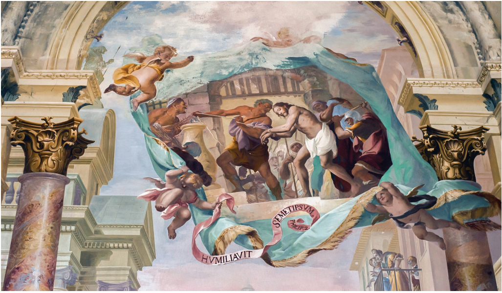
Fig. 50. Jesus is taken before Pontius Pilate. Wall fresco, Chapel XIII, Sacro Monte di Orta.