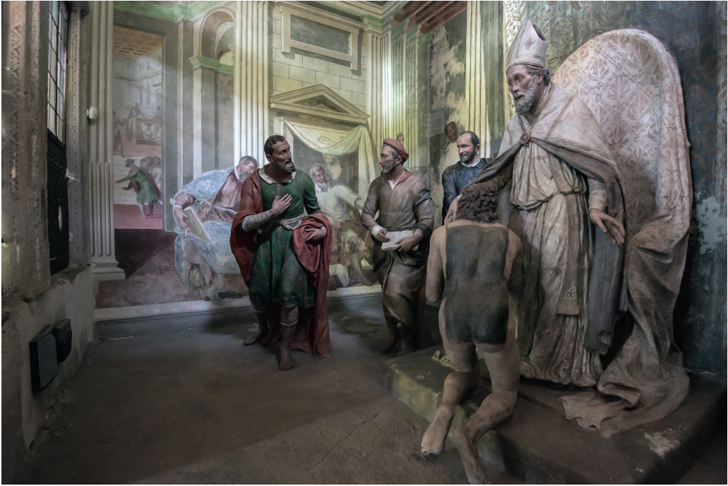
Fig. 13. Francis renounces his family, his name and his inheritance before the Bishop of Assisi. Chapel III, Sacro Monte di Orta.