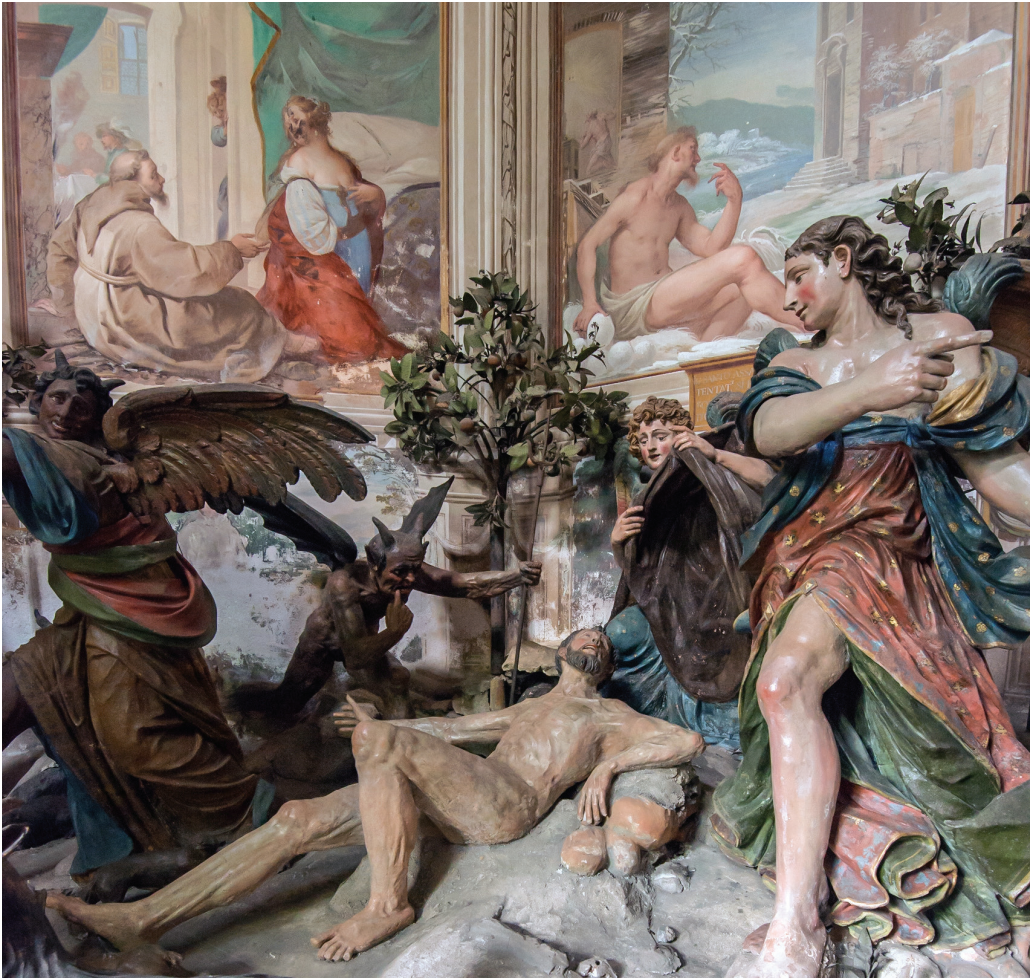
Fig. 37. St. Francis lying on thorns between Devils and Angels. Chapel X, Sacro Monte di Orta.

the Gospel Life, (2) the earthly Grace given by God through the gift of indulgence and, at the end of time, (3) the ultimate redemption of humankind purchased through the sacrifice of Jesus Christ. The antagonists are the various temptations (often in the form of demons) that continuously challenge the saint's devotion. The legends documenting this struggle can be found in various thirteenth- and fourteenth- century Franciscan sources, with humankind's redemption in the final victory over Satan illustrated by the Book of Revelation (rather than the story of Christ's Passion, as is so often the case at Orta). Chapel X, more than any other chapel