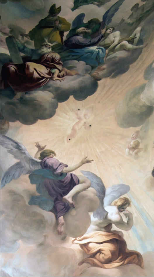
Fig. 3. The Seraph from the Stigmatization of Francis. Ceiling Fresco, Chapel XV, Sacro Monte di Orta. The Seraph from the Stigmatization of Francis. Ceiling Fresco, Chapel XV, Sacro Monte di Orta.

The contrast between Francis praying and Leo reading invokes the contrast between prayer and the study of sacred theology made by Francis in his letter to Anthony of Padua...Furthermore, Bonaventure has Francis contrast reading and studying with prayer...As in Christ's life, prayer takes precedence over reading, so Francis prays on the mountainside while Leo reads, and Francis's praying culminates in his stigmatization, while Leo's reading distracts him from a vision of the supernatural. 54