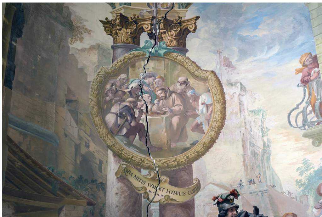
Fig. 48. St. Francis sharing a meal with social outcasts. Wall fresco, Chapel XIII, Sacro Monte di Orta.