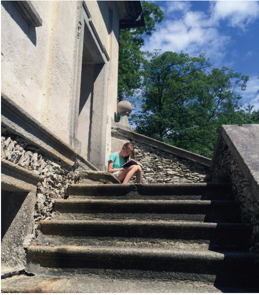
Fig. 71. Stairway from Chapel XVIII to Chapel XIX. Sacro Monte di Orta.