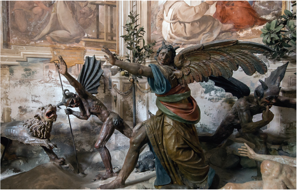
Fig. 1. Three Devils plague Francis. Chapel X, Sacro Monte di Orta.

They cried with one voice: ‘Blessed Francis, hurry to the Savior and his Mother who await you in the church.’ There then appeared to him a straight path as if of decorated silk going up to the church and blessed Francis took from the rose patch twelve red roses and twelve white roses and entered the church.