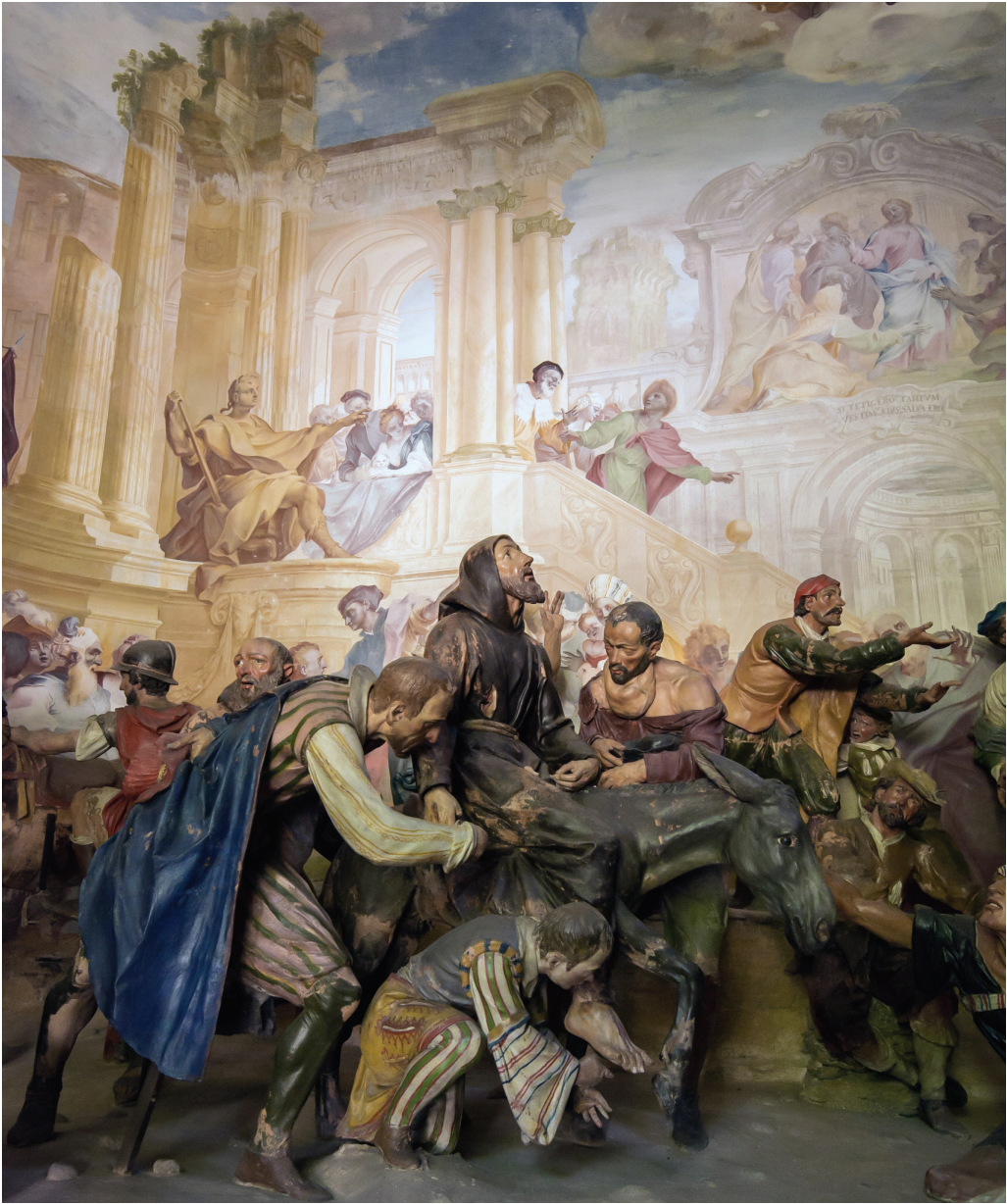
Fig. 59. St. Francis, blind and terminally ill, enters into Assisi surrounded by supporters. Chapel XVI, Sacro Monte di Orta.

The trompe l'oeil paintings at eye-level extend the scene of the diorama with additions to the crowd and of the built environment of Assisi. Interrupting the contemporaneous scene is a vignette within the wall painting, just above and behind the statue of Francis, that depicts Christ healing the hemorrhaging