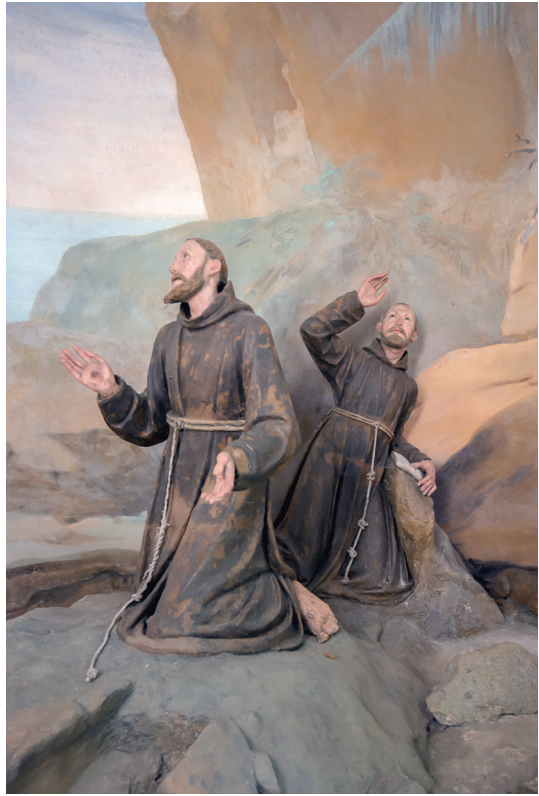
Fig. 3. Francis and Brother Leo on La Verna at the moment of the Seraph's appearance and Francis' stigmatization. Chapel XV, Sacro Monte di Orta.

At the Sacro Monte di Orta, the setting of Chapel XV conveys the emotional and geographical desolation of Francis' La Verna experience. Figures of small animals dot the landscape, underlining the danger and violence of the wilderness: a mountain cat attacks a wild boar, while a large lizard with open jaws lurks menacingly nearby, producing a measure of discomfort and fear in the viewer. 51 The artistic program of Chapel XV reflects the textual vision of Bonaventure and the artistic vision of Giotto. Francis, echoing the penitential posture of the terra-cotta Francis in Chapel II, kneels on a bleak and rocky mountain with his arms outstretched at waist level, looking in awe at the Christ figure, a Seraph (see Fig. 3). Francis bears the stigmata; blackened flesh like "nail heads" mark the palms of the hands, and the skin surrounding the blackened flesh is red with irritation. In the Life of Francis , followed by The Major Legend of Saint Francis , Francis' response to the vision was characterized by a mixture of joyousness, fearfulness, and incomprehension, followed at last by understanding. Prestinari captures this latter moment of clarity; it is a moment of decisive response, with Francis at once joyful in his share of Christ's Passion, but also accepting of the suffering it entails.