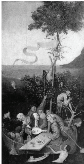
Fig. 1. Hieronymus Bosch, Ship of Fools (1490–1500)