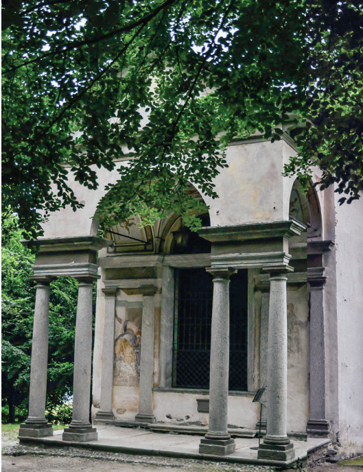
Fig. 18. Exterior of Chapel V, The First Followers of Francis take the Habit. Sacro Monte di Orta.

status, both literally and figuratively, sets them apart from the other figures in the diorama that cluster to the right side of the chapel and are placed on a lower elevation. In the mix are children and adults, men and women, the impoverished and the burghers—even a dog is welcome in the sanctuary. The frescos surrounding the diorama in the lower register of the walls are a continuation of the scene, depicting more of the faithful with the same demographic diversity.