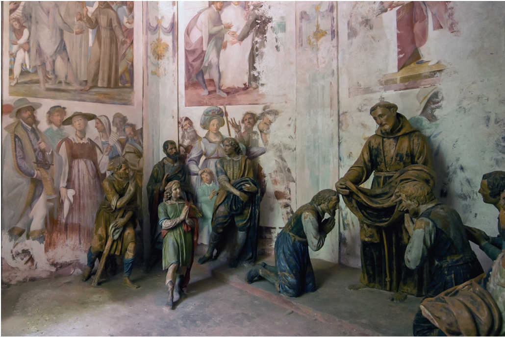
Fig. 19. The ordination of the first brothers. Chapel V, Sacro Monte di Orta.

newfound vocation, depicted in Chapel IV. By 1209, Francis was devoted to a life of poverty. Shortly thereafter, according to his biographers, like-minded men began to follow Francis