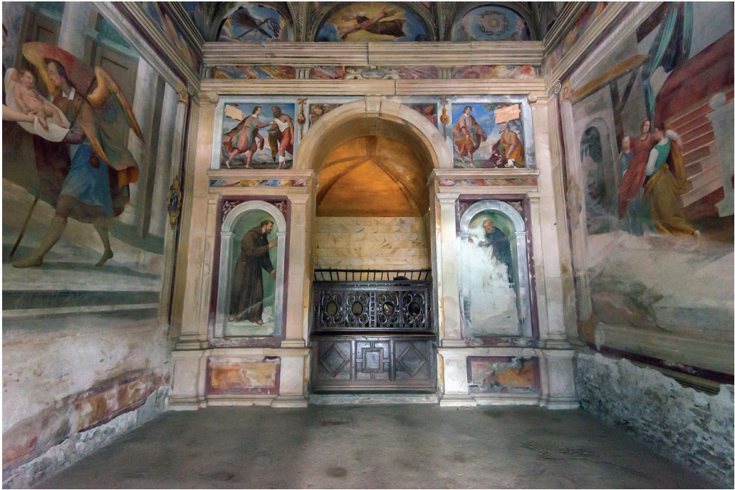
Fig. 3. Vestibule of Chapel I. Sacro Monte di Orta.