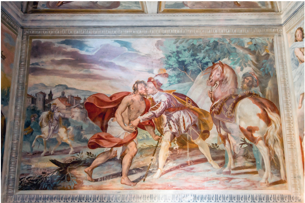
Fig. 10. Francis kisses a leper. Chapel II, Sacro Monte di Orta.