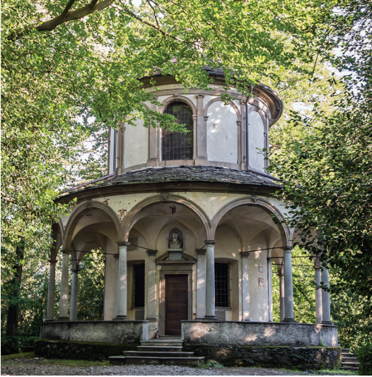
Fig. 55. Exterior of Chapel XV, St. Francis receives the Stigmata. Sacro Monte di Orta.