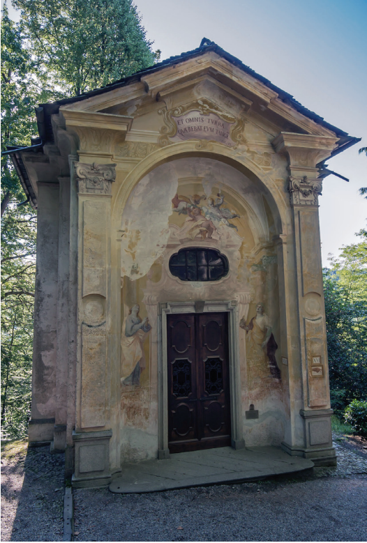
Fig. 58. Exterior of Chapel XVI, St. Francis, nearing Death, returns to Assisi. Sacro Monte di Orta.

For immediately the marks of nails began to appear in his hands and feet just as he had seen a little before in the figure of the man crucified. His hand and feet seemed to be pierced through the center by nails, with the heads of the nails appearing on the inner side of the hands and the upper side of the feet and their points on the opposite sides. The heads of the nails in his hands and his feet were round and black; their points were oblong and bent as if driven with a hammer, and they emerged from the flesh and stuck out beyond it. Also his right side, as if pierced with a lance, was marked with a red wound from which his sacred blood often flowed moistening his tunic and underwear. 75