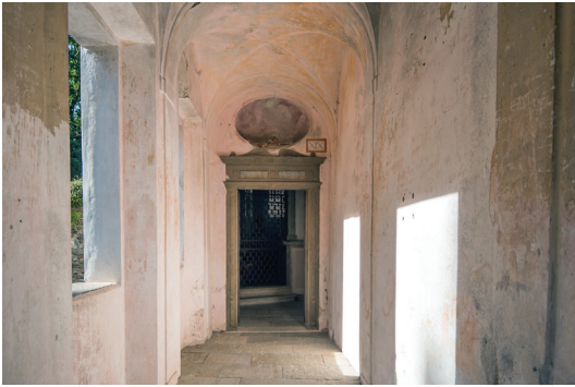
Fig. 67. Exterior of Chapel XIX, Miracles at the Saint's Tomb. Sacro Monte di Orta.