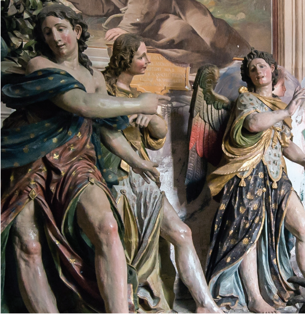
Fig. 2. Three Angels protect Francis. Chapel X, Sacro Monte di Orta.

angels on the right. Finally, to the far right of Francis, is a small, old, female bat-demon, naked with sagging breasts, who runs away in terror accompanied by her mice. 4 The function of these demons is to recall to the viewer all the instances of Francis' many trials with devils/temptations, not just one example. We can imagine this mixture of demons as perpetrators of the lesser temptations and trials recounted in the various biographical traditions, some of which are depicted in the fresco cycle on the walls around the diorama.