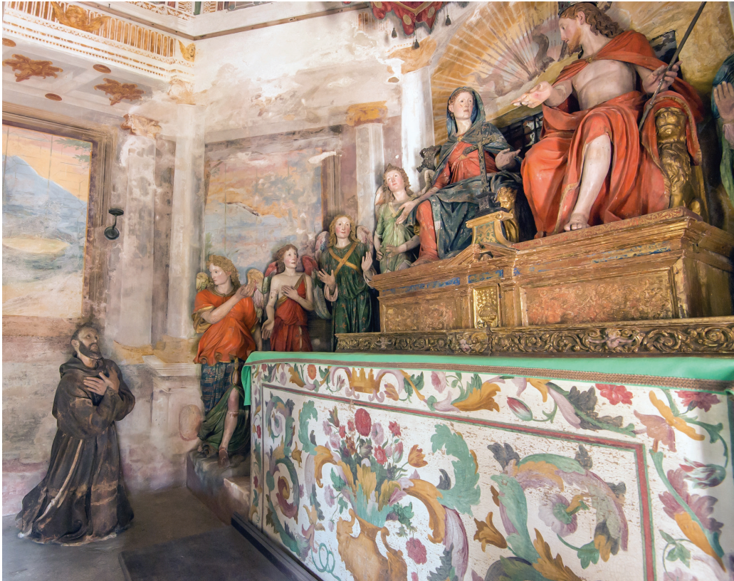
Fig. 2. The Vestibule and surrounding Frescos of Chapel XI. Sacro Monte di Orta.

before the altar of the Porziuncola and prays for the souls of all sinners; Francis announces the Porziuncola Indulgence before the pope, bishops, and a crowd of onlookers. 7 Within the diorama, Christ and Mary are equally enthroned on a grand scale behind an altar covered with real linen altar cloth (see Fig. 2). Eight angels are arrayed on either side. Of equal size, wearing identical large crowns, mother and son turn to look at each other. Mary holds her hands out in a questioning gesture, while Christ holds a sceptre in one hand and gestures to the kneeling Francis with the other.