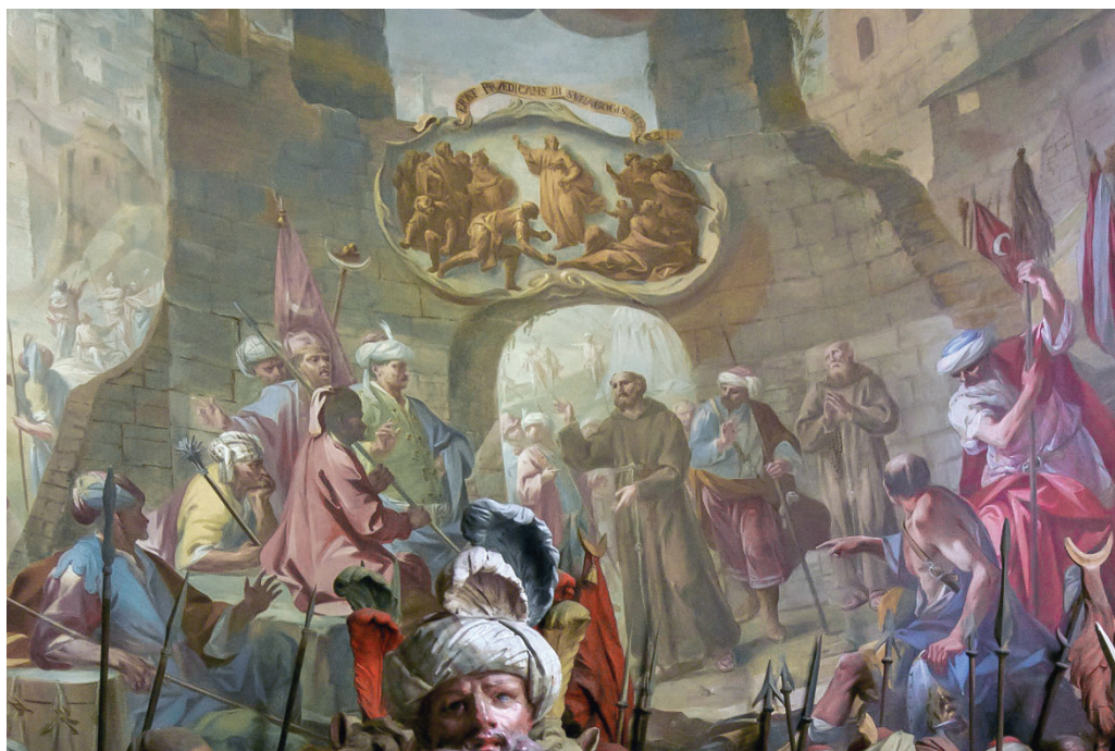
Fig. 53. St. Francis preaches to Muslims (below) and Jesus preaches in the synagogue (above). Wall fresco, Chapel XIV, Sacro Monte di Orta.