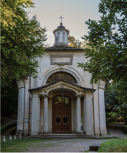
Fig. 46. Exterior of Chapel XIII, The Humility of St. Francis. Sacro Monte di Orta.

with bounty from the Promised Land but sadly report that the enemy is too strong to overcome; only Joshua and Caleb stand firm on God's plan for conquest. The people rend their clothes, lament their circumstance, and threaten to stone the two men of faith. While Moses' intervention saves the people from God's wrath, Joshua and Caleb alone are destined to enter the Promised Land as reward for their faithfulness (Num 13–14). The fresco encapsulates the story in a single scene, depicting the moment of the scouts' return, the people's mourning, and the people arming themselves with stones. Moses, arms outstretched, entreats God, who appears on a cloud over the Tent of Meeting. The theme of the biblical story is obedience to God's command, a lesson echoed in the story of the Franciscan Rule. As Bonaventure repeatedly asserts in his version of events, Francis was only a passive recipient of God's command, and that command was the Rule. According to this belief, and reflected in the program of the chapel, the Rule, and thus the Franciscan