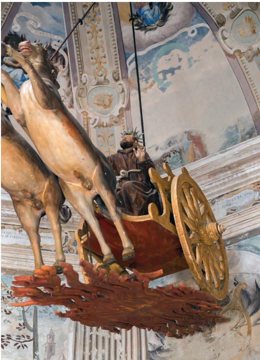
Fig. 29. St. Francis drives his Chariot of Fire. Chapel VIII, Sacro Monte di Orta.

through the little house two or three times. On top of it sat a large ball that looked like the sun, and it made the night bright as day. 38