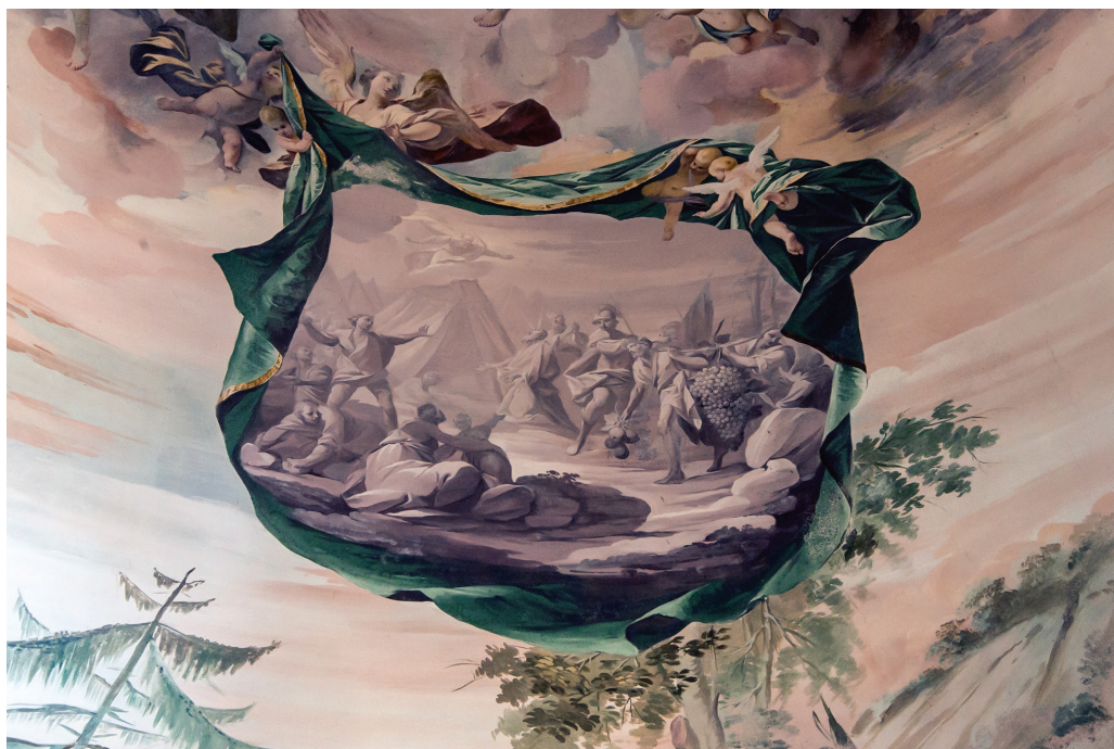
Fig. 45. Joshua, Caleb, and Moses (Num 13–14). Ceiling of Chapel XII, Sacro Monte di Orta.