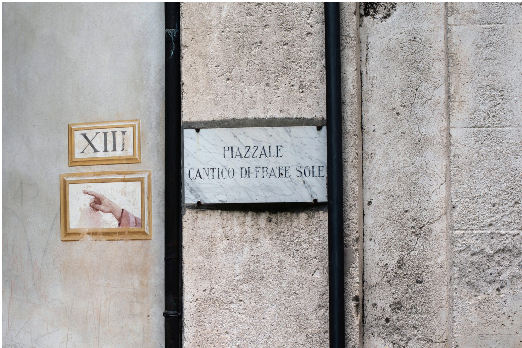
Fig. 83. As with the previous figure (Fig. 82) we see The Canticle of the Creatures represented in the name of this piazza: Brother Sun Square. Sacro Monte di Orta.