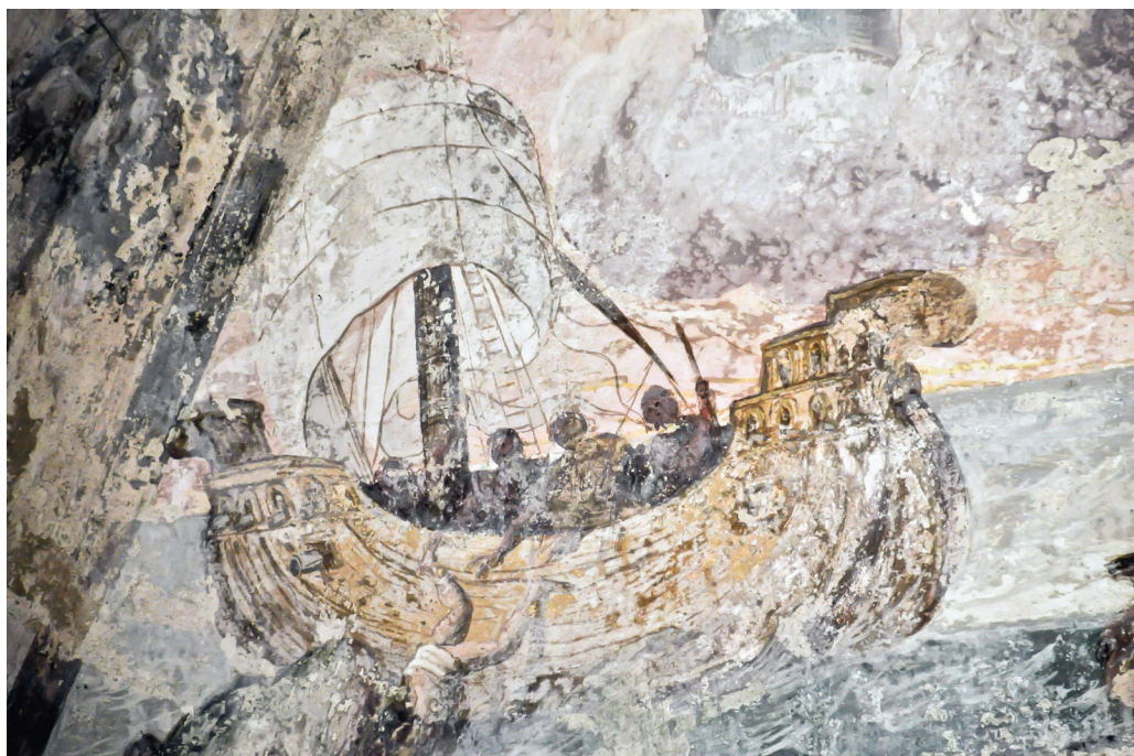
Fig. 23. Painting of Jonah being thrown overboard. Chapel VI, Sacro Monte di Orta.

hand and gesticulating stage right with the other, draw the viewer's attention to the immediately adjacent wall fresco of Brother Sylvester and his famous vision of Francis' battle against a dragon: as the dragon attacks Assisi, Francis opens his mouth, emanates a golden cross, and expels multiple demons from the dragon's own opened mouth. 31 The miracle recounted in the painting is the encoded correlative of the diorama: a woman delivered of evil spirits. Such a subject would have been familiar to those versed in Franciscan legend, wherein Francis cures many individuals of demonic possession. Women were frequently portrayed as the victims of such possession, a condition, perhaps, that scholars now take to have been epilepsy or mental illness. 32