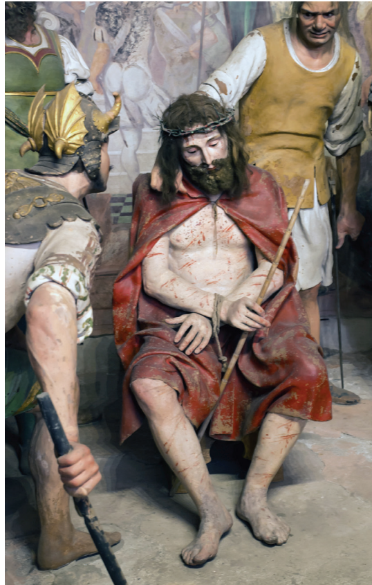
Fig. 3. Jesus Crowned with Thorns, Chapel XXXI, Sacro Monte di Varallo.

There are a number of Sacri Monti in Northern Italy, the ones at Varallo and Orta being among the most fully realized and carefully preserved. Grouped together as World Heritage sites, it is all too easy to note their similarities and diminish their differences; however, when examining Varallo and Orta, the contrast is enlightening as it pertains to understanding the aesthetic and strategic vision of Orta. With over forty chapels, the Sacro Monte di Varallo leads the pilgrim on a far more rugged, exhausting and convoluted path than the Sacro Monte di Orta. It seems designed to challenge the pilgrim to exhaustion not only physically but spiritually. Perhaps the designers of Varallo were bent on shocking the pilgrim into submission to Christ and thus the Church. With chapels devoted to the Fall of Adam and Eve (Chapel I), Jesus' capture (Chapel XXIII), Jesus' trials (before Annas, Caiaphas, Pontius Pilate, and Herod, Chapels XXIV, XXV, XXVII, and XXIX respectively), and ten separate chapels devoted to stages of the Passion (see Fig. 3), perhaps most poignant example remains Chapel XI, "Slaughter of the Innocents" (see Fig. 4). It is grotesque, graphic, and leaves