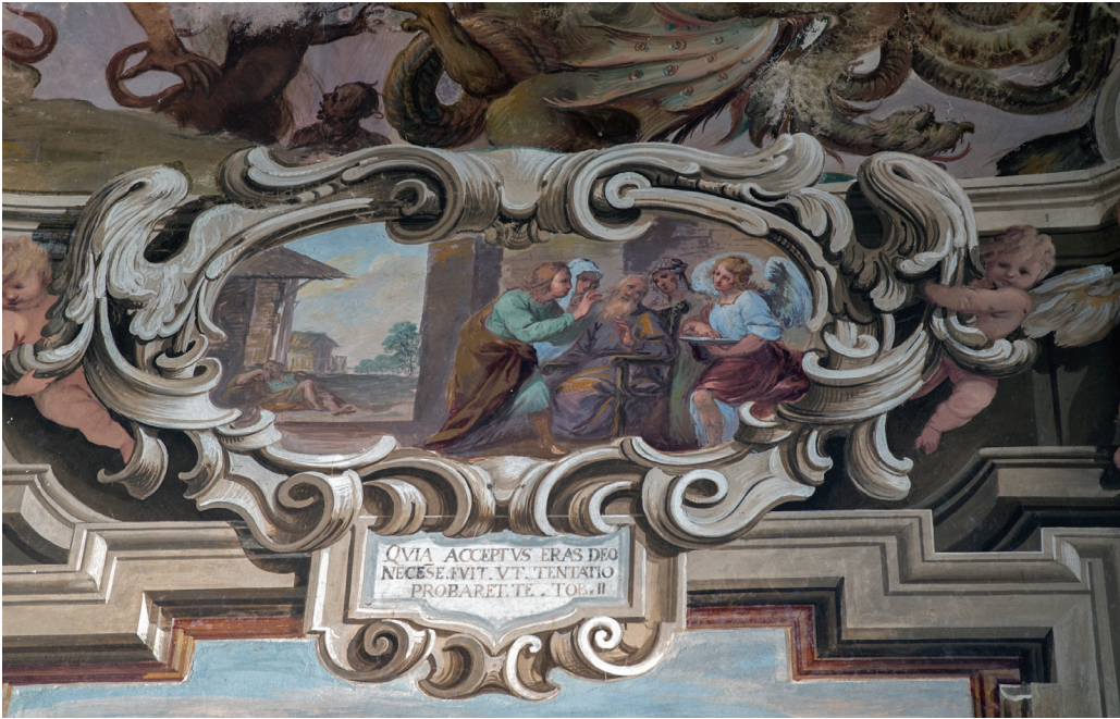
Fig. 3. Tobit refuses dinner and defies the Assyrian king in order to bury a fellow Israelite (Tobit 2; 12:13). Chapel X, Sacro Monte di Orta.

angel. When Francis is represented as a suffering saint in post-Tridentine art, an angel typically waits at his head to support him with divine love. 6 The next three angels demonstrate three different ways of explicating Francis' relationship with the surrounding scene. The first looks at Francis, but gestures to the viewers' right toward the path to the Porziuncola; the second directly engages the pilgrim's attention with "eye contact" while directing their gaze, through pointed gestures, to Francis; and the third looks at Francis while gesturing in the opposite direction toward the Porziuncola. These gestures and glances comprise an oracular plot to guide the Pilgrim's gaze from Francis toward the fresco to the viewer's immediate right, a fresco of Christ and his Mother, crowned and enthroned, granting the Indulgence of the Porziuncola. Thus, the designers of Chapel X take a relatively obscure tale about Francis' temptation and transform it into a new way to see Christ in Francis and Francis as intercessor with Christ. In so doing, they deliver