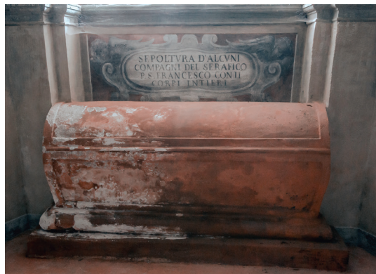
Fig. 70. The sarcophagus of St. Francis. Chapel XVIII, Sacro Monte di Orta.

corridors. Doorways lead into very small vestibules; iron grilles and kneelers separate the pilgrim from the dioramas. The façade of the Chapel XX (the only one of the three chapels with an exterior architectural style per se ) is an example of Renaissance classicism (see Figs. 66, 67, and 68). The interior of Chapel