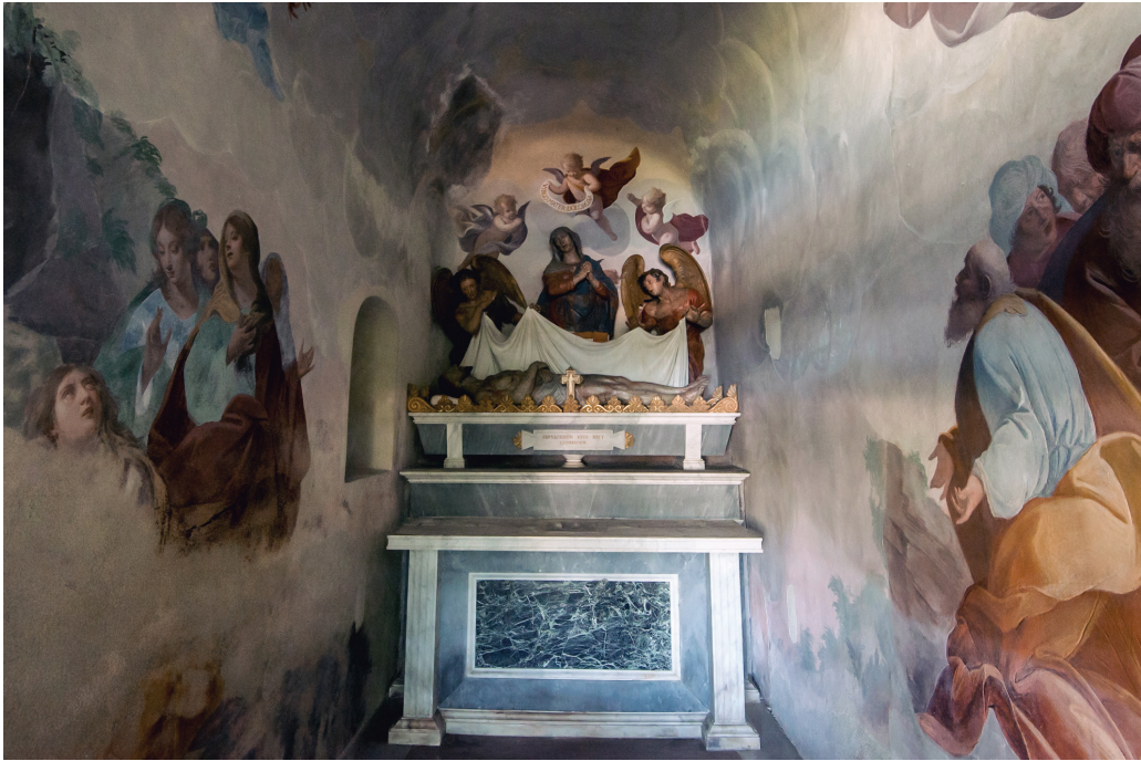
Fig. 11. The tomb of Christ. Our Lady of Sorrow Oratory, attached to Chapel II, Sacro Monte di Orta.

base of the entablature with its cornice and pediment. Toward the front end of the slate rooftop perch three crosses. The effect of the tall and linear but proportionally narrow façade compels the viewer's gaze upward and gives the chapel a sense of majesty.