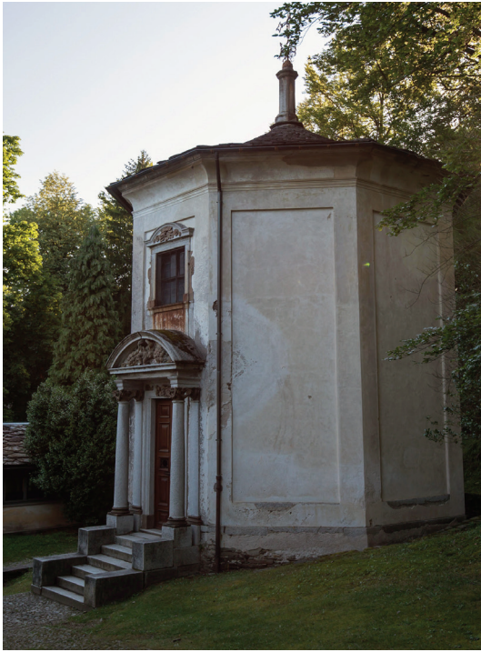
Fig. 36. Exterior of Chapel X, St. Francis Victorious over Temptation. Sacro Monte di Orta.

Miriam, along with Moses and Aaron, leading the Israelites in the desert (symbolizing leadership); and the wise woman of Tekoa advising King David (symbolizing wisdom).