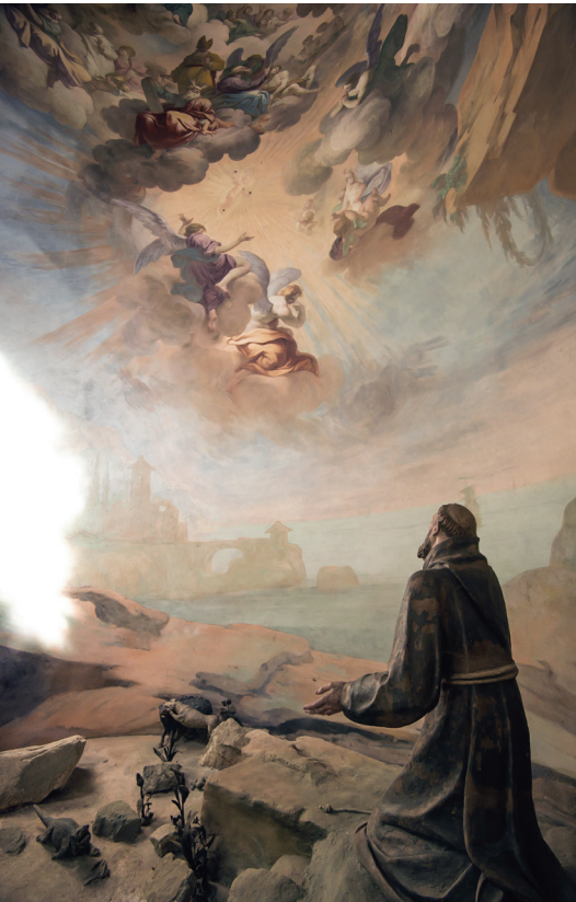
Fig. 56. The Seraph appears to St. Francis. Ceiling fresco, Chapel XV, Sacro Monte di Orta.

and energy of the heavenly audience echoes the dynamic action of the scene below.