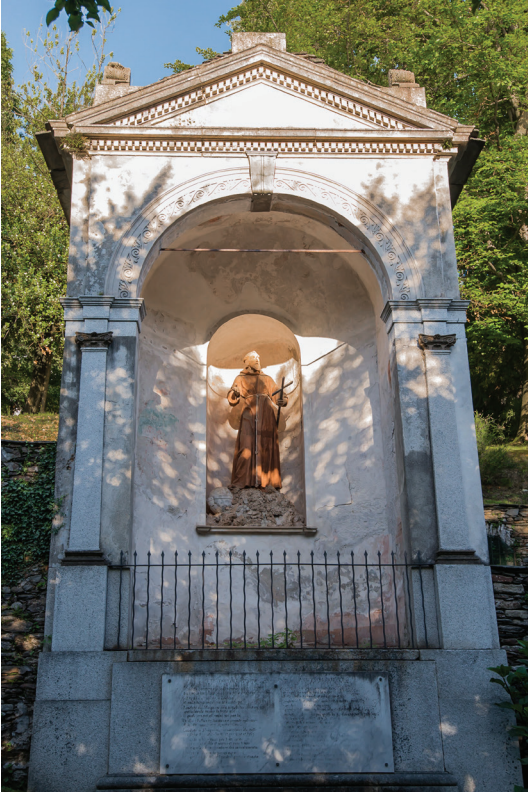
Fig. 7. Shrine at the entrance to the park with a statue of St. Francis of Assisi. Sacro Monte di Orta.

vegetation, the lanes are named after natural elements mentioned in the Canticle of the Sun (such as the wind and sun; see Chapter 2, Catalogue of the Chapels, Figs. 81 & 82), and the chapels are numbered sequentially. An early seventeenth-century well, an oratory, a small convent, and the medieval Church of St. Nicolao (rededicated in the seventeenth century to both St. Nicolao and St. Francis) are also located within the sacred park (see Figs. 8 & 9).