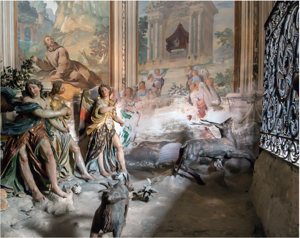
Fig. 38. Angels point the way to the Porziuncola. Chapel X, Sacro Monte di Orta.

ous demonic temptations, then again to the diorama of Francis' dramatic encounter with Satan outside the Garden of the Porziuncola, next on to Francis' theophany of Jesus and Mary inside the Porziuncola, where they bestow the gift of the Indulgence until, finally, the viewer, eyes raised aloft, meditates upon a vision of the Apocalypse and the salvific triumph of Christianity.