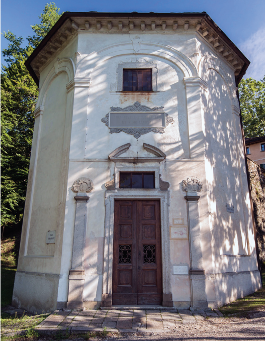
Fig. 62. Exterior of Chapel XVII, The Death of St. Francis. Sacro Monte di Orta.

gels lead the stigmatic towards heaven, foreshadowing Francis' death—and the theme of the next chapel, Chapel XVII.