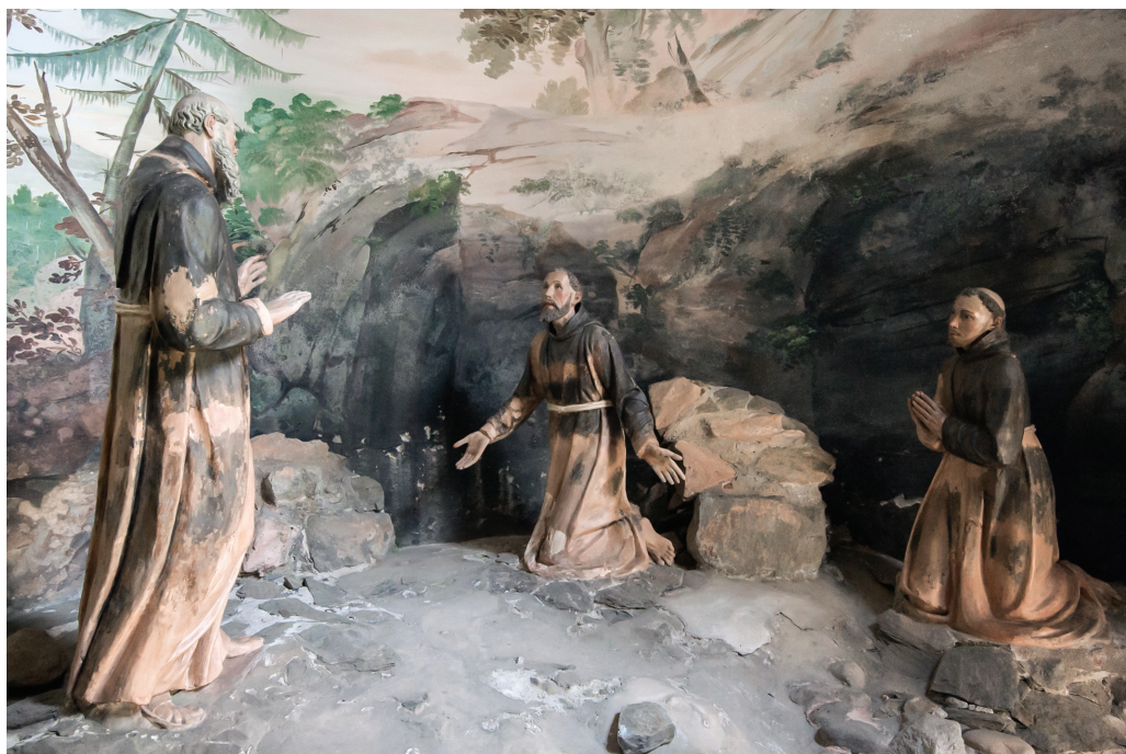
Fig. 44. Francis receives the Rule, delivered through the Holy Spirit. Sacro Monte di Orta.