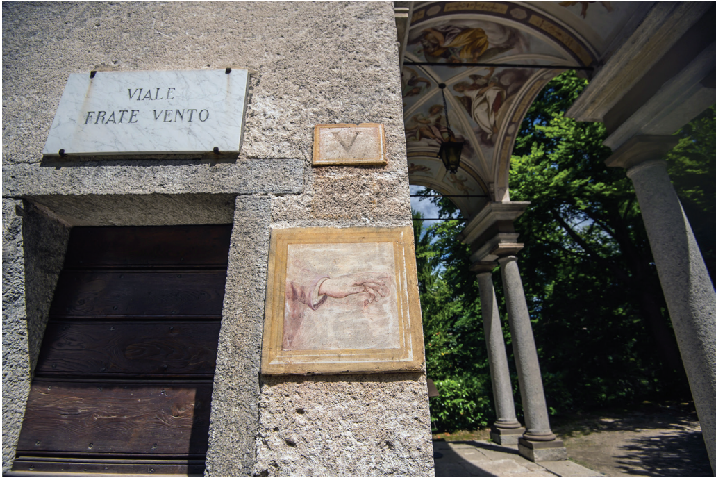
Fig. 82. The Canticle of the Creatures is evidenced in the name of paths and piazzas of the Sacro Monte. Here we see the sign for the Avenue of Brother Wind. Sacro Monte di Orta.