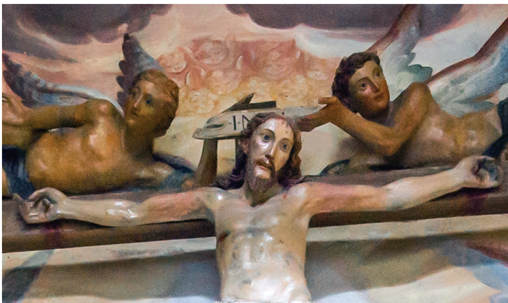
Fig. 2. Christ on the San Damiano Cross. Chapel II, Sacro Monte di Orta.