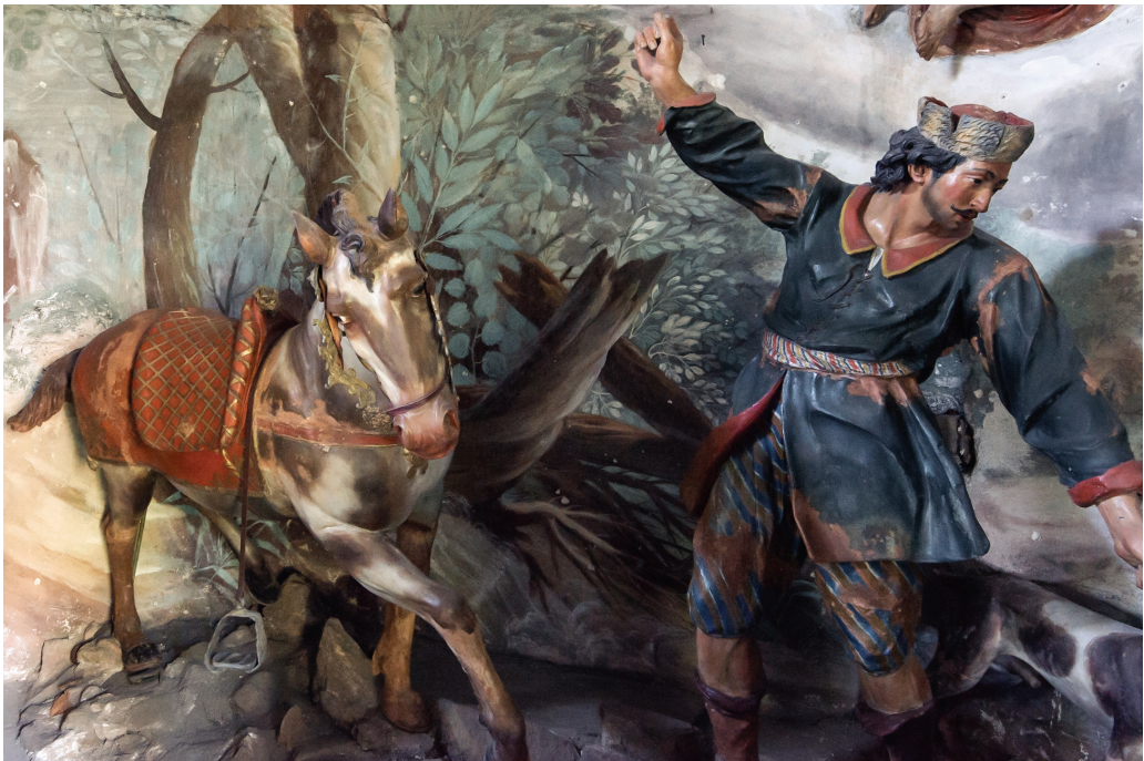
Fig. 8. A stableman and horse. Chapel II, Sacro Monte di Orta.