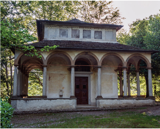
Fig. 21. The exterior of Chapel VI, St. Francis sends the First Disciples out to Preach & Miracles Confirm the Preaching. Sacro Monte di Orta.