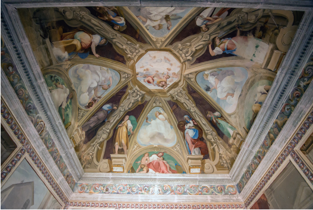
Fig. 41. God and Christ in ceiling center, surrounded variously by Putti, angels. The female figures standing upon plinths are personifications of the Beatitudes. Ceiling frescos, Chapel XI. Sacro Monte di Orta.

and twelve white roses and entered the church. He proceeded to the altar and placed on it the roses he had brought with him in joined hands. There he saw Jesus Christ standing with his Mother at his right with a great multitude of angels. Then Francis found himself dressed in a very beautiful garment before the Savior and his Mother, and the Savior said to him: "Francis, ask whatever you will for the enlightenment of the nations and the consolation of souls, to the honor and reverence of God, for you have been designated a light to the nations and the repair of the earthly church, that is the Church Militant." 55