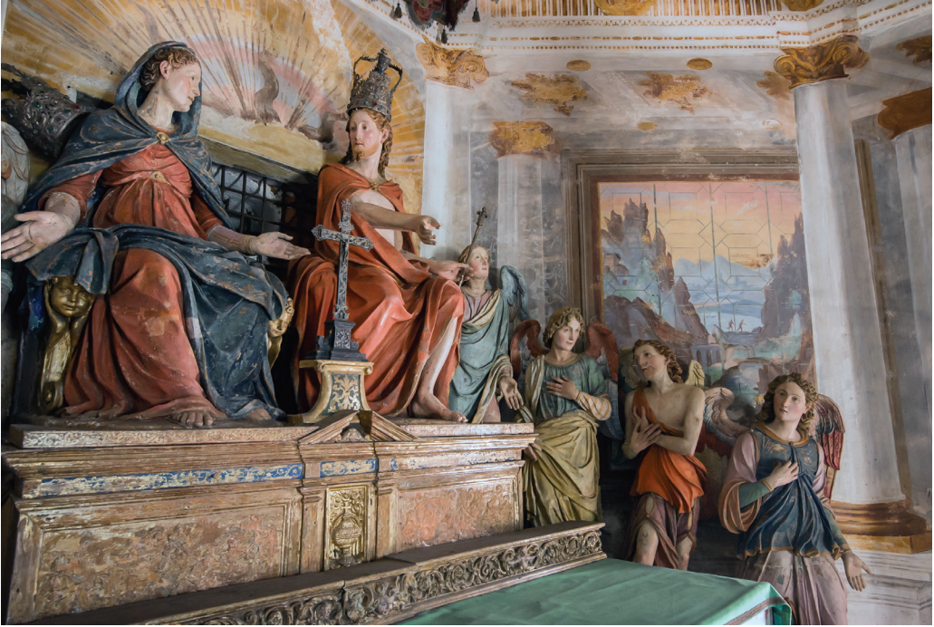
Fig. 42. Jesus and Mary enthroned. Chapel XI, Sacro Monte di Orta.

dome, each with a white-robed angel holding a censer. Directly beneath these four triangular panels are lunettes; three of these contain frescos, one encases a leaded window. One lunette depicts a woman breastfeeding a child while tending two other children, another features a woman holding yet another incense burner, and a final lunette fresco is too damaged to make out. Each of the four triangular panels, and their respective lunettes, are flanked by two painted female figures each standing on an inscribed plinth. These figures are allegorical representations of the beatitudes as articulated in Matthew 5:3–10. The figures are not in the biblical sequence and some of the cartouches are illegible, but as best as we can discern based upon the remaining inscriptions and iconography they are: a woman in a tattered garment representing the poor in spirit (Matthew 5:3); a woman holding an ermine, whose white coat symbolizes purity and moderation, representing the meek (Matthew 5:5); a pious woman with her hands clasp in prayer