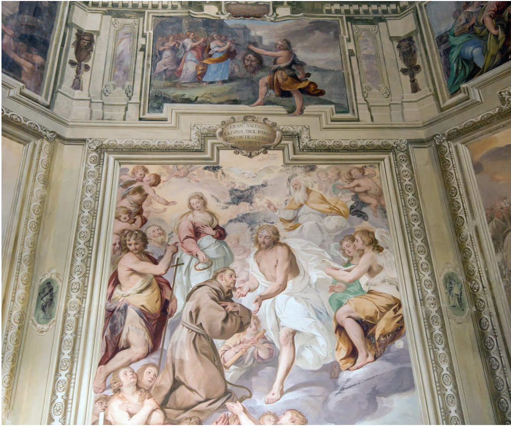
Fig. 65. David enters Jerusalem with the head of Goliath (above); St. Francis welcomed into Heaven (below). Wall frescos, Chapel XVII, Sacro Monte di Orta.

and XVI for example, or the dramatic terrain of Chapels X, XII, and XV), Chapel XVII has a far more complex artistic program than meets the eye. Beyond the diorama, upon the walls, a variety of Old and New Testament images underscore Francis' selection as one specially chosen by God. Some parallels are presented in pairs of frescos that are to be read as one-on-one correlates: the depiction of Jacob's blessing of Ephraim (Gen 48) along the upper wall is echoed in Francis' blessing of Brother Bernard on the wall below; 92 Jacob, on his deathbed, predicting the destiny of his children (above) parallels a friar's deathbed vision of Francis' ascension (below); the fresco of the upper wall depicting Thomas's examination of Christ's wounds (John 20:24–29) pairs with the fresco along