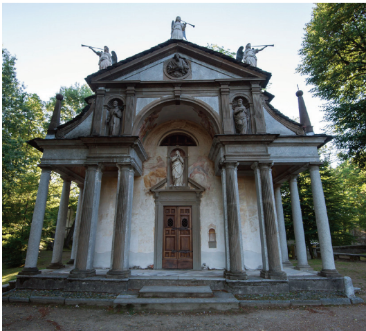
Fig. 40. Exterior of Chapel XI, The Indulgence of the Porziuncola. Sacro Monte di Orta.