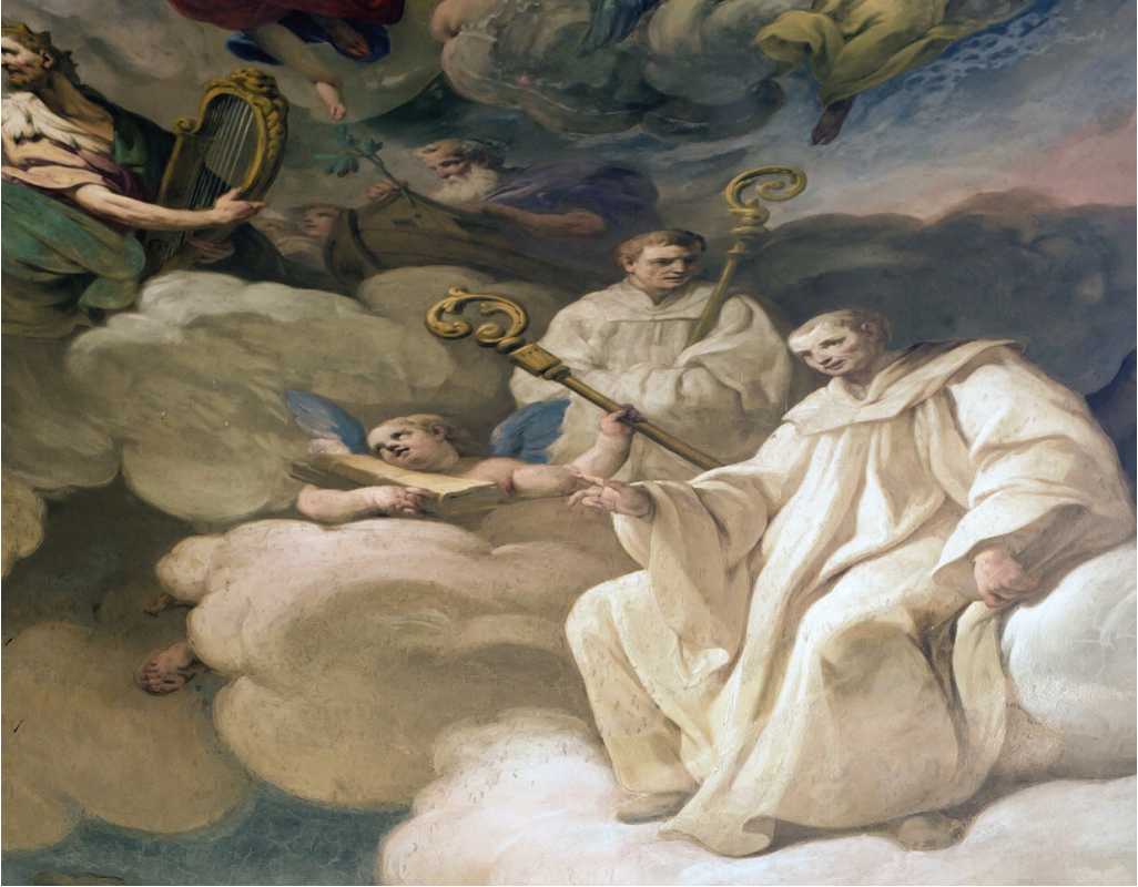
Fig. 57. Peter, Paul, Noah, and David. Ceiling fresco, Chapel XV, Sacro Monte di Orta.