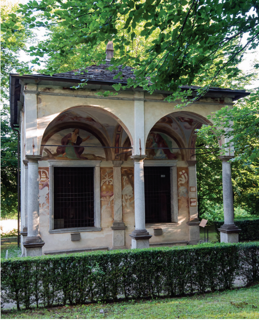
Fig. 15. The exterior of Chapel IV, St. Francis Listening to the Mass. Sacro Monte di Orta.

One day while he was devoutly hearing a Mass of the Apostles, the Gospel was read in which Christ sends out his disciples to preach and give them the Gospel form of life, that they may not keep gold or silver or money in their belts, nor have a wallet for their journey, nor may they have two tunics, nor shoes, nor staff. Hearing, understanding, and committing this to memory, the friend of the apostolic poverty was then overwhelmed with an indescribable joy. “This is what I want,” he said, “this is what I desire with all my heart!” Immediately, he took off the shoes from his feet, put down his staff, denounced his wallet and money, and, satisfied with one tunic, threw away his leather belt and put on a piece of rope for a belt. He directed all his heart’s desire to carry out what he had heard and to conform in every way to the rule of right living given to the apostles. 25