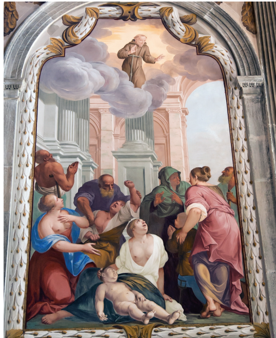
Fig. 77. St. Francis raising a child from the dead is evidence of a posthumous miracle. Wall fresco, Chapel XX, Sacro Monte di Orta.