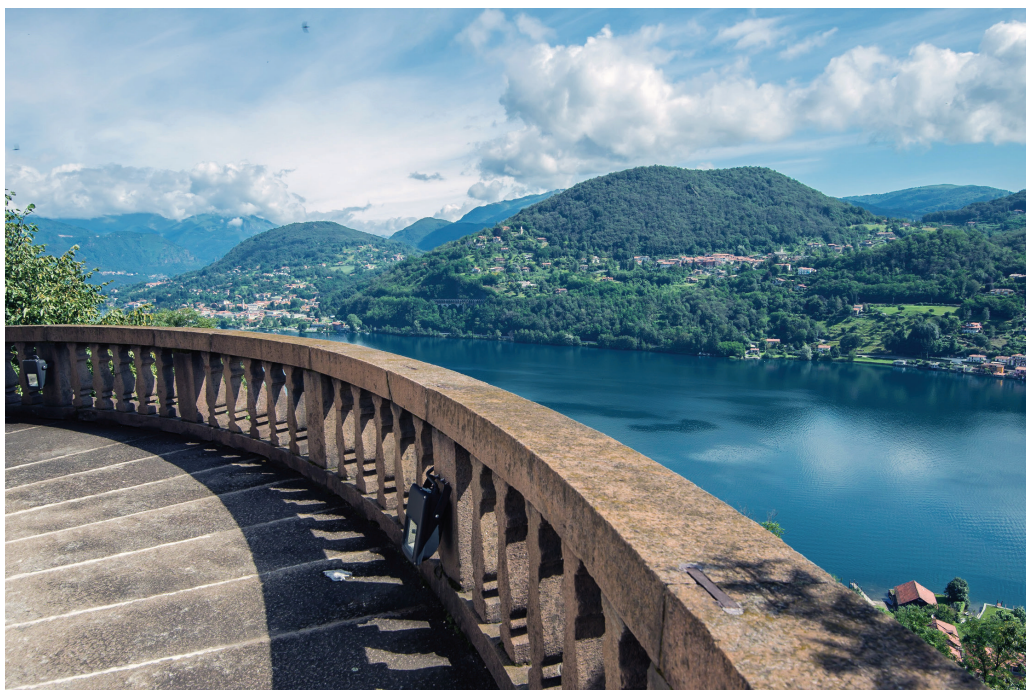
Fig. 81. Observation deck of the New Chapel. Sacro Monte di Orta.