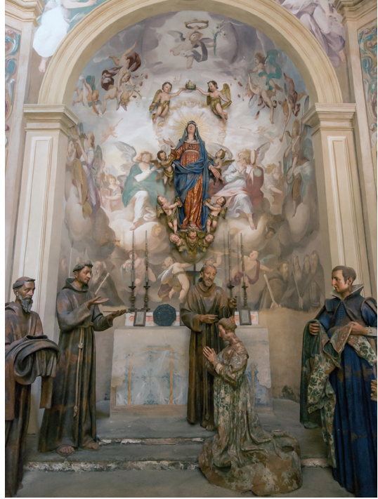
Fig. 33. St. Francis cuts off the hair of St. Clare as she becomes a religious. Chapel IX, Sacro Monte di Orta.

The artistic program of Chapel IX highlights not only Clare's story and her role as alter Franciscus , but also Clare's connection to other important women in biblical history and her role as successor of these strong figures and the virtues they represent. In the vaults and lunettes, there is Judith holding the head of Holofernes (symbolizing strength); the creation of Eve (identifying Clare as a helpmate for Francis) (see Fig. 35);