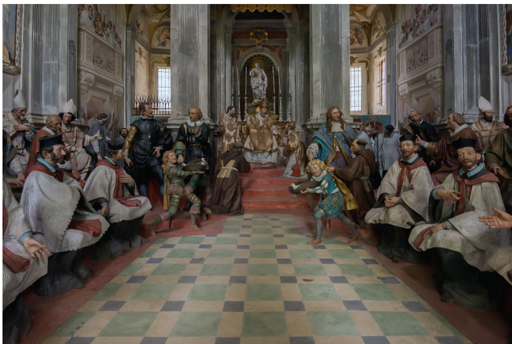
Fig. 74. Pope Gregory IX canonizes St. Francis before prelates and a body of onlookers. Chapel XX, Sacro Monte di Orta.