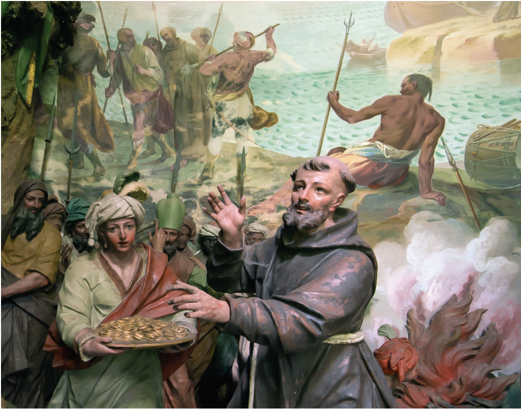
Fig. 54. Francis rejects offering of gold (foreground), a Native American watches as the friars are taken captive on the shores of Damietta (background fresco). Chapel XIV, Sacro Monte di Orta.

their attention on an invitation to repentance and conversion.