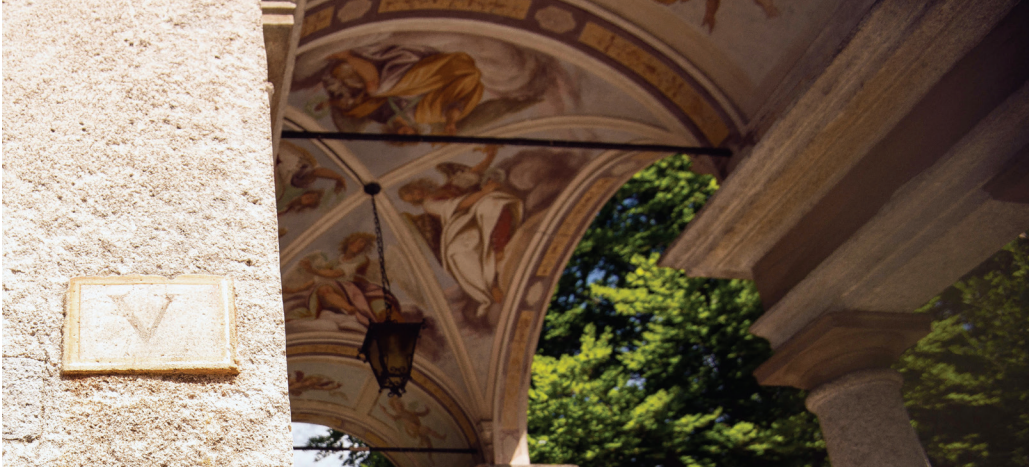
Fig. 20. Personification of the four essential Capuchin virtues: Poverty, Obedience, Meditation, and Mortification. Arcade frescos, Chapel V, Sacro Monte di Orta.