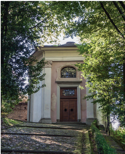
Fig. 51. Exterior of Chapel XIV, St. Francis and the Sultan. Sacro Monte di Orta.

libertine excess. 67 In keeping with the Tridentine didacticism of the Sacri Monti and Borromeoan influence in design, the Carnival setting of Francis' humble contrition is apt. We have already noted the nod to the Borromeoan family motto "Humility," as it connects Francis to Christ, to the great Tridentine reformer, to the Capuchin ascetic life, and, finally to the theme of the chapel. Furthermore, we see Francis' sin, eating a meager portion of meat, innovatively juxtaposed to the celebration of carnevale , the Latin etymology of which means literally "putting away flesh" (from carne and levare ). This season "without meat" is inversely celebrated by gluttonous feasting. In the textual tradition, Francis' sign act is efficacious. The crowd recognizes their own transgressions; they are reflective, remorseful and contrite. This is not so with the crowd portrayed in the chapel. With the exception of four brethren, few of the celebrants are struck by the call to repent. The responsibility now falls upon the pilgrim, who stands in the vestibule of Chapel XIII, to heed the message.