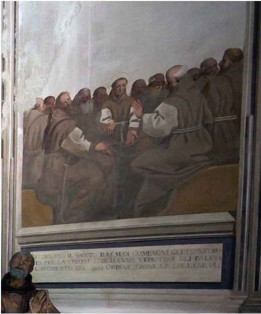
Fig. 31. St. Francis explains the Vision of the Chariot of Fire. Wall fresco, Chapel VIII, Sacro Monte di Orta.