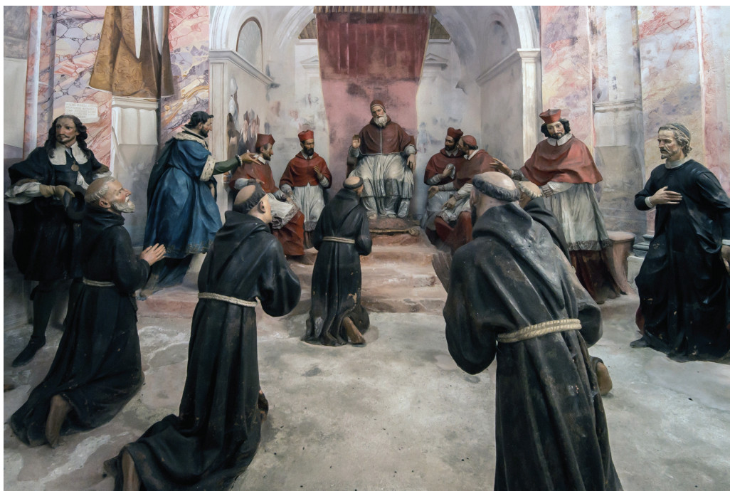
Fig. 26. The brothers receive approval from Pope Innocent III. Chapel VII, Sacro Monte di Orta.