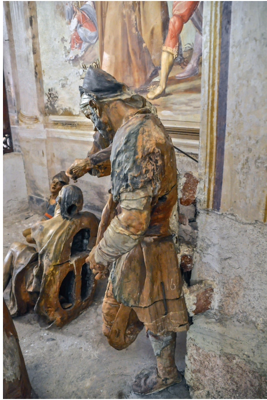
Fig. 1. A behind the scenes view of terracotta figures showing construction techniques. Nave, Chapel VI. Sacro Monte di Orta.

As indicated in the artist's biographies (see Appendix), some very well-known artists of the period worked at Orta. For a few, painting or sculpting was a multigenera-