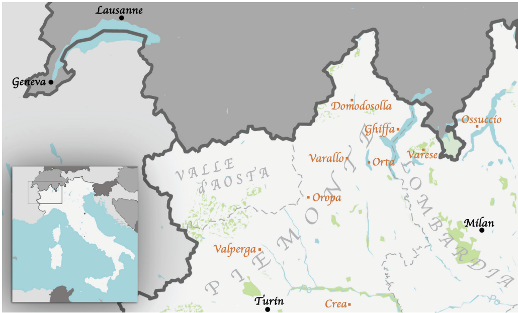
Fig. 1. Map of the Nine UNESCO World Heritage Sacri Monti in Italy.

glass eyes applied. The earliest chapels were simple, open, box-like rooms, in which the visitor could walk among the figures; later ones were larger and more complex, with more figures populating them. Since the mid-sixteenth century, the pilgrim has been kept at a distance behind iron or wooden screens often pierced with peepholes placed at ideal viewing points. In addition, the back and side walls are painted in illusionistic frescos that further reinforce the impression that one is beholding historical events being acted out. The artistic program creates levels of framing. The life-size statues are set as if on the depth of a stage; where the sculpture stops against the wall, painting takes up and uses its devices to continue the illusion of the staged event into a farther depth. These tableaux with their intense realism, or what Roberta Panzanelli calls “hyperreality,” 5 come very close in spirit to late medieval theatrical representations and to Francis’ own teaching methods.