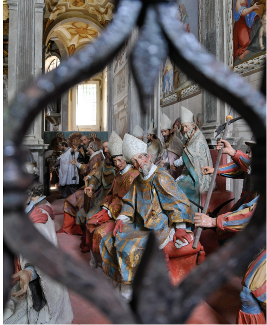
Fig. 76. A peephole in the ironwork screen separating the vestibule from the nave in Chapel XX. The terracotta figure directly engages the viewer through eye contact. Chapel XX, Sacro Monte di Orta.

On the viewer's immediate left, Francis is attacked by demons who try to throw him down a precipice. 102 Pilgrims here are asked to recall his struggles against temptation. The scene of the middle left fresco depicts Francis