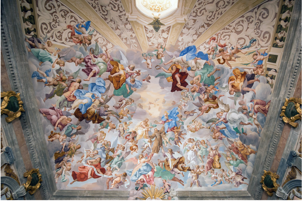
Fig. 79. The magnificent, operatic ceiling of Chapel XX, depicting St. Francis' ascension into Heaven. Sacro Monte di Orta.

and piazzas along the pilgrimage route, such as Viale di Frate Vento (Avenue of Brother Wind) near Chapel V (see Fig. 82) and Piazzale di Frate Sol (Brother Sun Square) near Chapel XIII (see Fig. 83).