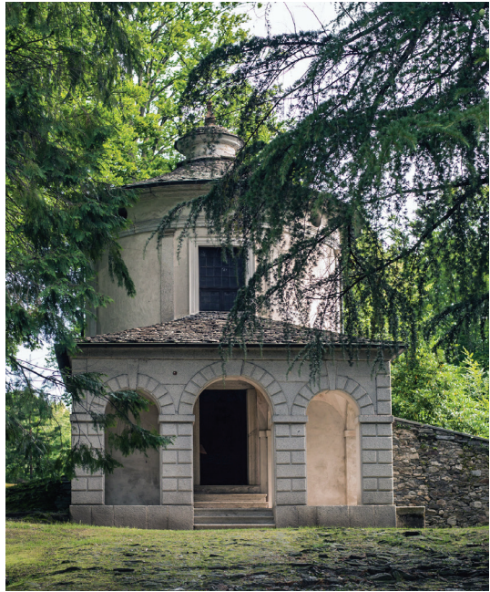
Fig. 43. Exterior of Chapel XII, God Reveals the Rule to St. Francis. Sacro Monte di Orta.

Built between 1591 and 1597, Chapel XII, also known as the Roman Chapel because it was paid for by native Ortans living in Rome, was one of the first chapels constructed on the mount. The original chapel is an elegant two-story circular structure built upon a squared foundation (see Fig. 43). The upper story is decorated with engaged columns and is pierced by a tall rectangular lead-glass window and several small round windows. Its gently sloping roof is topped with a circular cupola. A heavy, rectilinear neo-classical portico was added in the late eighteenth century. Inside, a small vestibule allows just enough room for a few pilgrims at a time to peer upward through the wooden screen and toward the elevated diorama perched upon a faux mountaintop. Christoforo Prestinari sculpted the terracotta figures. The current frescos were painted in 1772 by Giovanni Battista Cantalupi and are characterized by the artist's sensitive and delicate rendering of the regional landscape on the walls and heavenly landscape on the vault above.