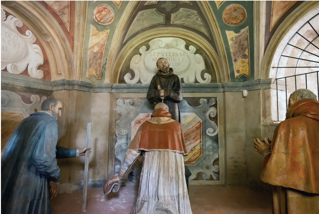
Fig. 3. Pope Nicholas V and his prelates experience a vision of St. Francis during a visit to the saint's crypt. Chapel XVIII, Sacro Monte di Orta.

available there. But it also reminds pilgrims of their participation in the divine economy at Orta, where indulgences are also granted for visits to the Sacro Monte. 19 A visit to Chapel XI could earn the pilgrim an indulgence of one hundred days per Saturday Mass in the small chapel. 20