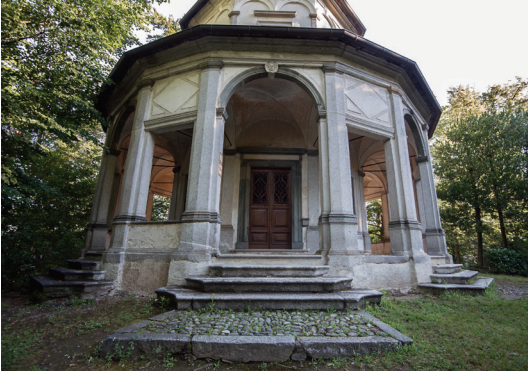
Fig. 28. Exterior of Chapel VIII, St. Francis on a Chariot of Fire. Sacro Monte di Orta.