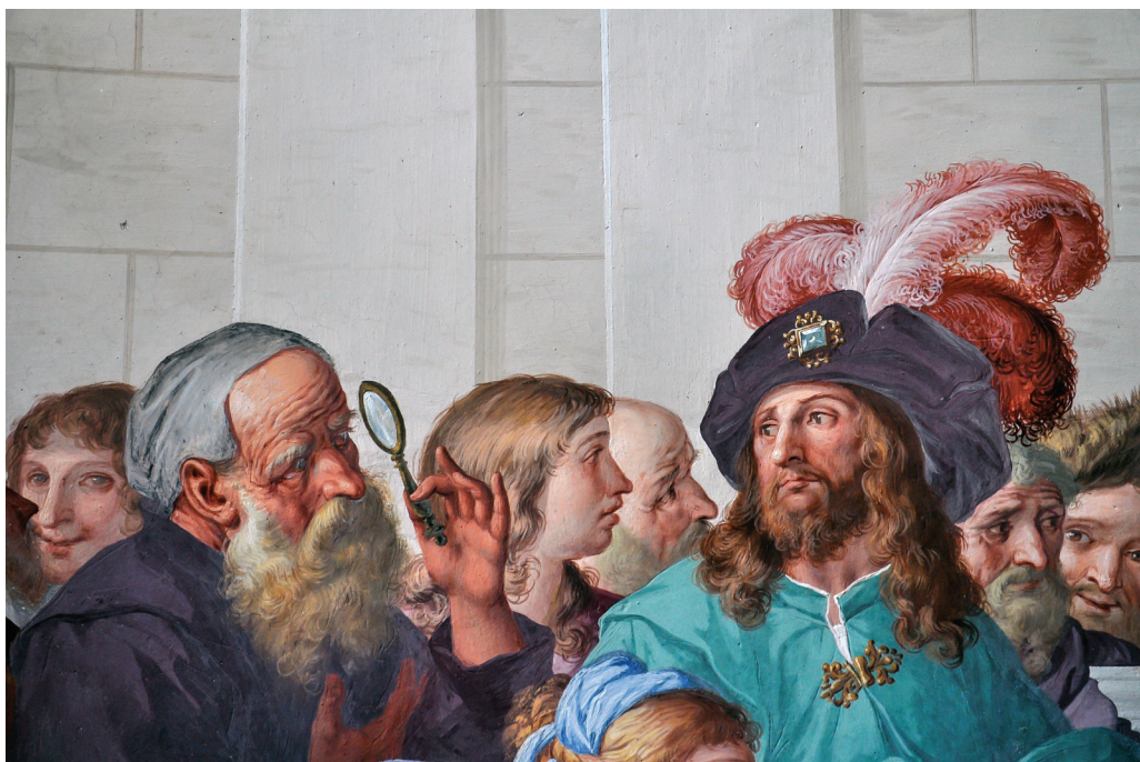
Fig. 75. Crowds attend the canonization of St. Francis. Wall fresco, Chapel XX, Sacro Monte di Orta.