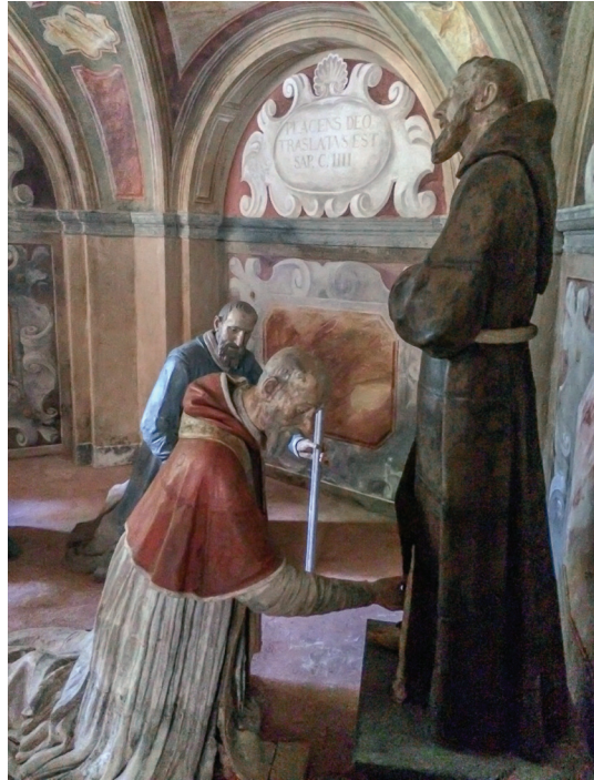
Fig. 69. Pope Nicholas V has a vision of St. Francis while visiting his crypt. Chapel XVIII, Sacro Monte di Orta.

The pilgrim approaches Chapels XVIII and XIX though partially enclosed, vaulted