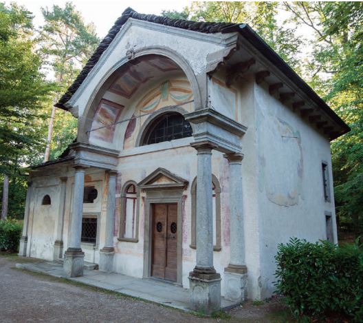
Fig. 6. Exterior of Chapel II, The Speaking Crucifix of San Damiano, and of the Oratory, Our Lady of Sorrow. Sacro Monte di Orta.

man and animal. Lady Pica, Francis' mother, with her rose dress and bluish-green cloak, appears imitatio Mariae (see Fig. 5). Both servants and well-dressed women attend her needs. The newborn Francis holds his