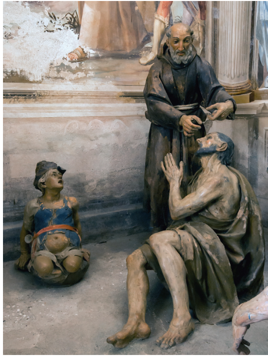
Fig. 24. A friar ministering to an ill man, with a leper watching nearby. Chapel VI, Sacro Monte di Orta.

He saw in a dream, as he recounted, the Lateran basilica almost ready to fall down. A little poor man, small and scorned, was propping it up with his own back bent so that it would not fall. "I'm sure," he said "he is the one who will hold up Christ's Church by what he does and what he teaches." Because of this, filled with exceptional devotion, he bowed