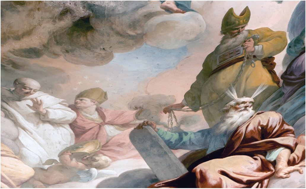
Fig. 5. Saint John Nepomuk and Moses among the Heavenly Host. Ceiling Fresco, Chapel XV, Sacro Monte di Orta.

late eighteenth-century fresco of Chapel XV serves as an example of the post-Tridentine program at work on the Sacri Monti.