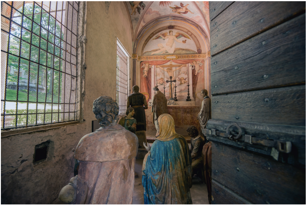
Fig. 16. An interior view of Chapel IV, St. Francis Listening to the Mass, Sacro Monte di Orta.