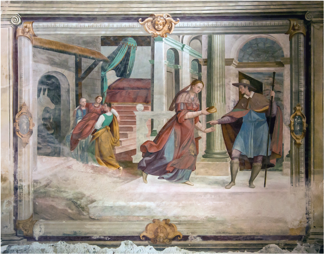
Fig. 3. Fresco of Lady Pica giving bread to the prophesying pilgrim (right), and Lady Pica is escorted to the stable for the birth of Francis (left). Chapel I, Sacro Monte di Orta.

rectly at the viewer with what must have been intended to be a look of compassion. Francis' frequent reference to the body as "Brother Ass" makes this an obvious iconic connection, and the rope foretells Chapel XIII when Francis is lead through the streets with a noose around his own "Brother Ass." Tucked in next to the ass is a horned ram, also gazing at the viewer and also iconographically linked with the saint. Francis especially loved sheep throughout his life for the simplicity of their way of life. By grazing and eating from the hands of their owners, the sheep reflect the Franciscans' alms-based economy. And of course Christ is the Lamb of God, and in loving sheep Francis expresses his love of Him. In a circle of reciprocal references, Christ is like a lamb, the lamb is like Francis, and thus Francis is like Christ. 13 Looking over the servant's shoulder is a large horse. He, too, gazes