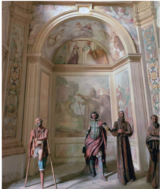
Fig. 34. An amputee engages the viewer outside the screen with a direct gaze. Interior of Chapel IX, St. Clare takes the Veil. Sacro Monte di Orta.