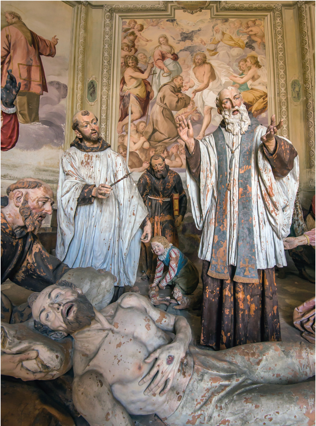
Fig. 63. St. Francis receiving the Last Rites. Chapel XVII, Sacro Monte di Orta.