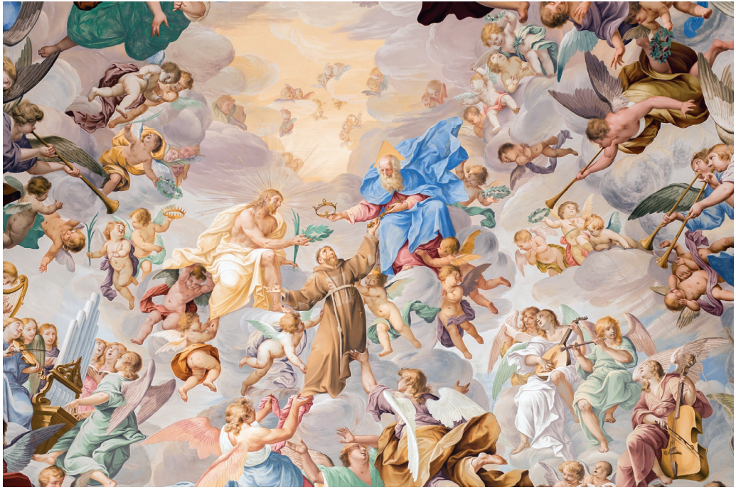
Fig. 1. St. Francis' Ascension into Heaven, Ceiling Chapel XX, Sacro Monte di Orta.