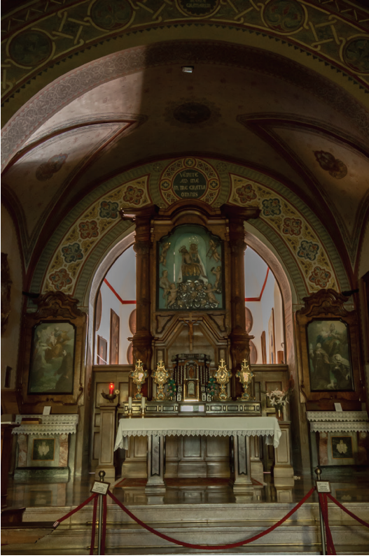
Fig. 9. Main altar of the Church of St. Nicolao. Sacro Monte di Orta.

events in the lives of both Jesus and Francis are omitted when a correlation cannot be found or contrived. 102 Thus the apparent reliance at Orta on Bartholomew's agenda, which privileges these pious correlations, seems to have dictated specific scene selections from the many available episodes of Francis' life. 103 Bartholomew's alter Christus reading remained popular in literature and art two hundred years later, partly because of the efforts of dynamic and well-regarded Franciscan preachers such as Bernardino of Siena (d. 1444).