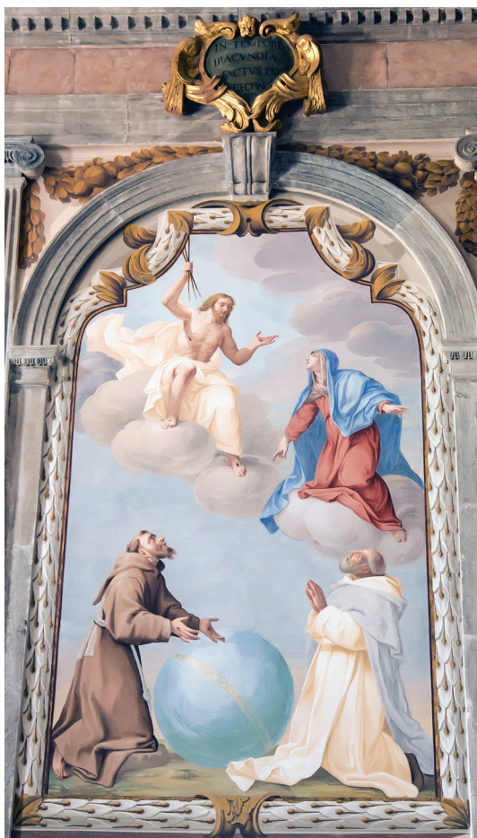
Fig. 78. Mary, Francis, and Dominic intercede with an angry Christ on behalf of the world. Wall fresco, Chapel XX, Sacro Monte di Orta.

performing a variety of miracles. The crowd of penitents includes parents with a dead infant, a pregnant woman, a man with a head wound, an arm injury and an impaired ability to walk. The final fresco of the series, once again the painting in closest proximity to the altar, portrays Christ, angry at humanity and ready to strike the earth, along with Mary, who stays his anger by introducing Saints Francis and Dominic who, in turn, kneel beside a globe and entreat Christ to spare humankind (see Fig. 78). 103 The fresco illustrates the intercessory power of the saints, an important point within the Catholic Reformation program.