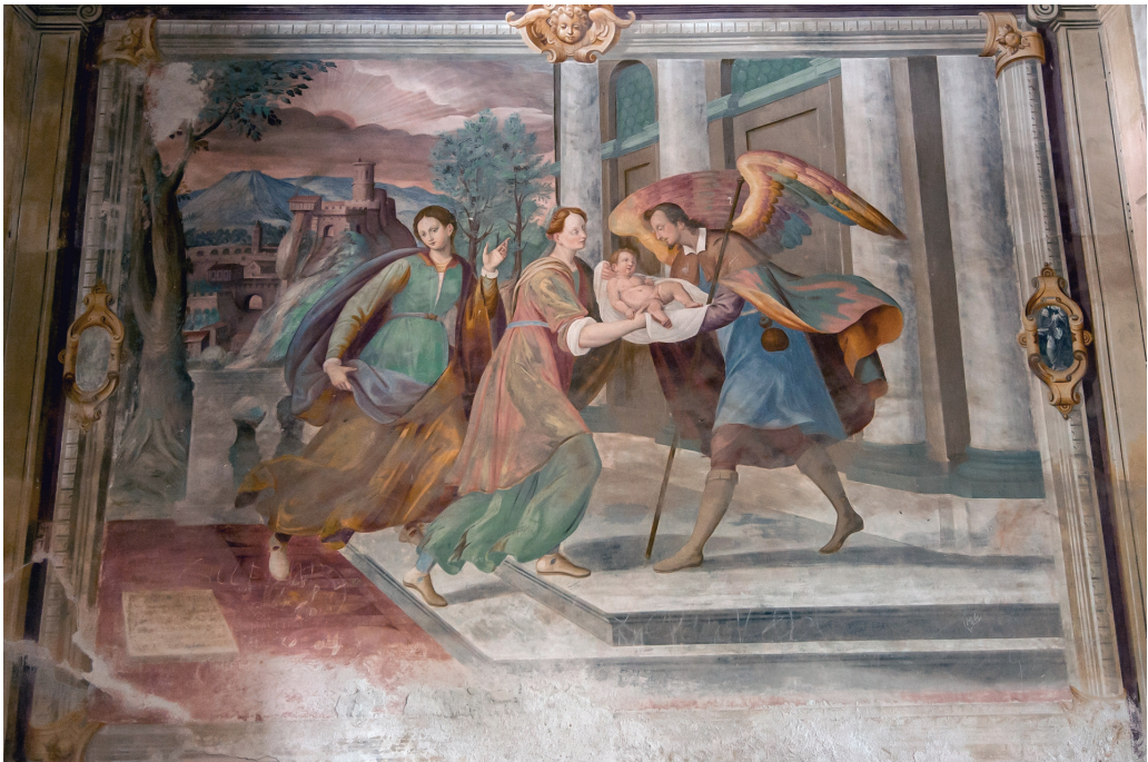
Fig. 4. Lady Pica presents her newborn to the Angel. Chapel I, Sacro Monte di Orta.