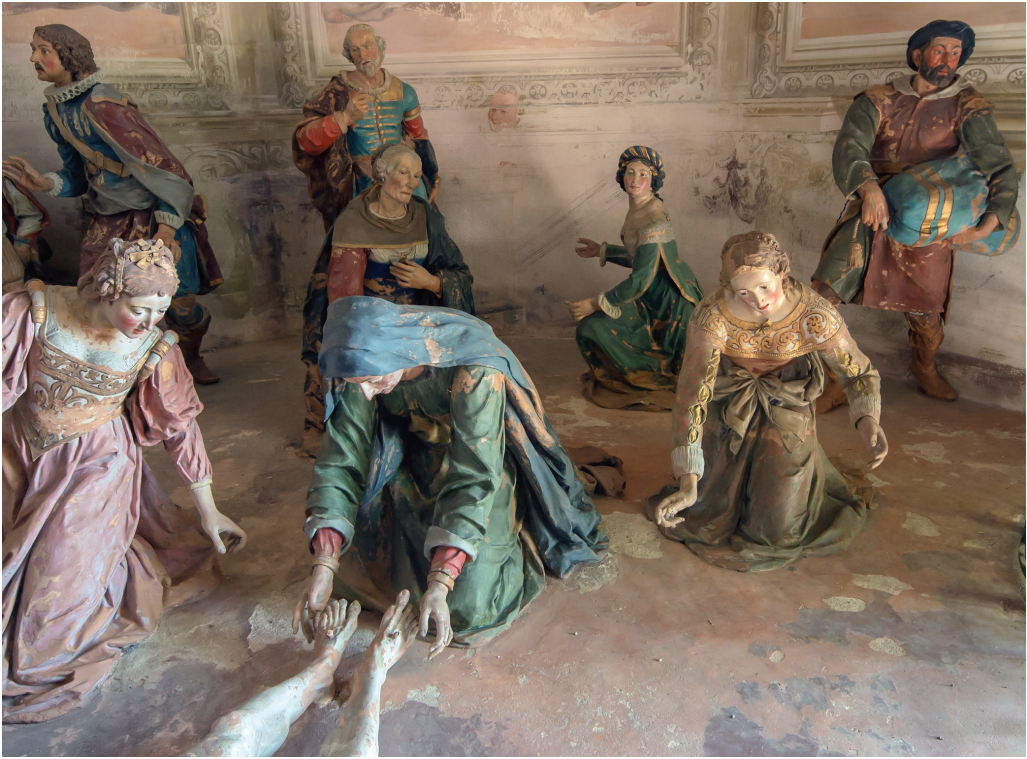
Fig. 64. Lady Jacoba tending the feet of St. Francis. Chapel XVII, Sacro Monte di Orta.

dying to Christ dying, and dead to Christ dead and deserved to be adorned with an expressed likeness. 87