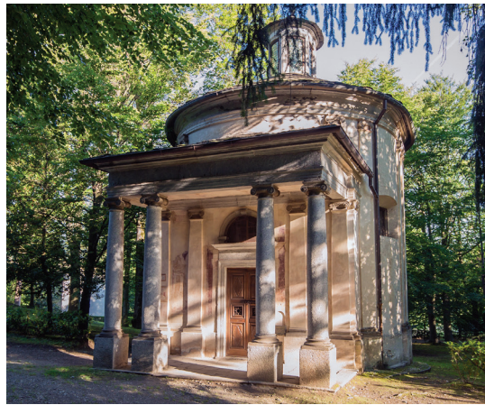
Fig. 25. Exterior of Chapel VII, Innocent III gives his Approval of the Order. Sacro Monte di Orta.

to the request in everything and always loved Christ's servant with special love. Then he granted what was asked and promised even more. He approved the rule, gave them a mandate to preach pen-