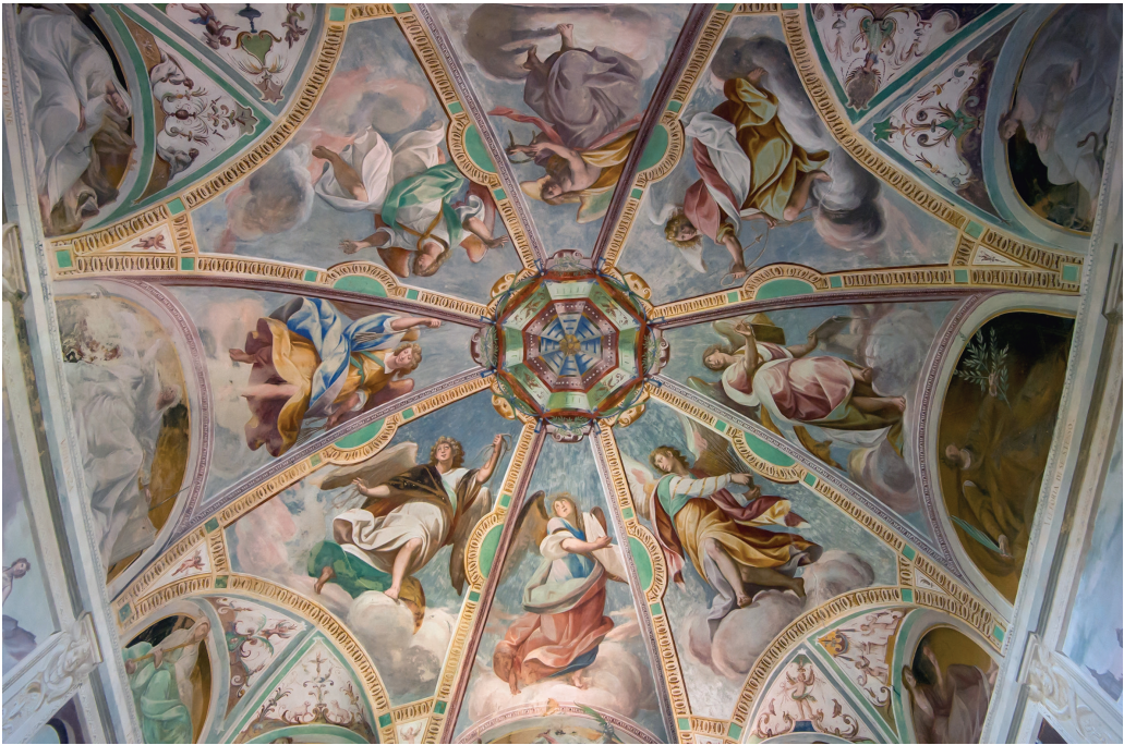
Fig. 14. Personification of virtues. Ceiling frescos, Chapel III, Sacro Monte di Orta.