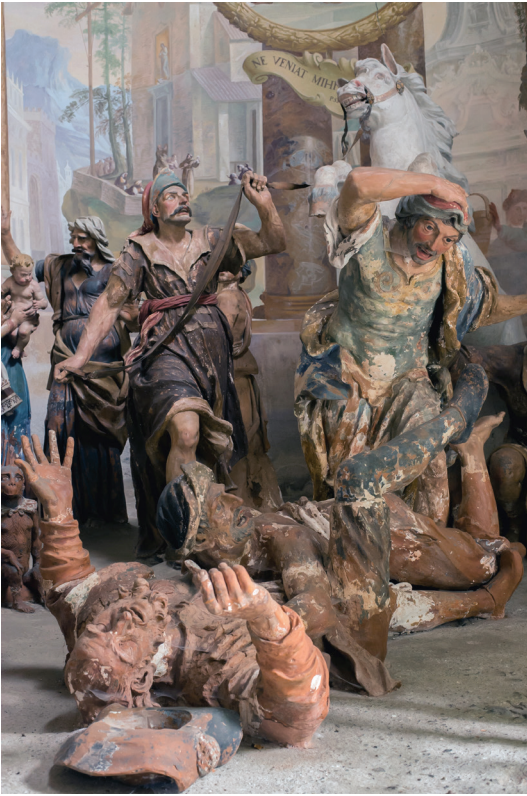
Fig. 1. Drunken Revelers at Carnival in Assisi. Chapel XIII, Sacro Monte di Orta.

without it, he could avoid dire need. He said it was impossible to satisfy necessity without bowing to pleasure. He rarely or hardly ever ate cooked foods, but if he did, he would sprinkle them with ashes or dampen the flavor of spices with cold water. 2