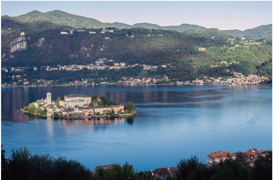
Fig. 2. View of Lago Orta and Isola San Giulio from the Sacro Monte di Orta.