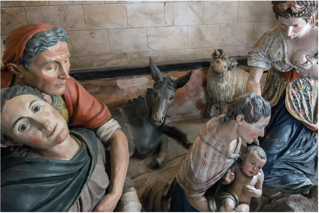
Fig. 5. Lady Pica, attendants, stable animals, and the newborn Francis. Chapel I, Sacro Monte di Orta.