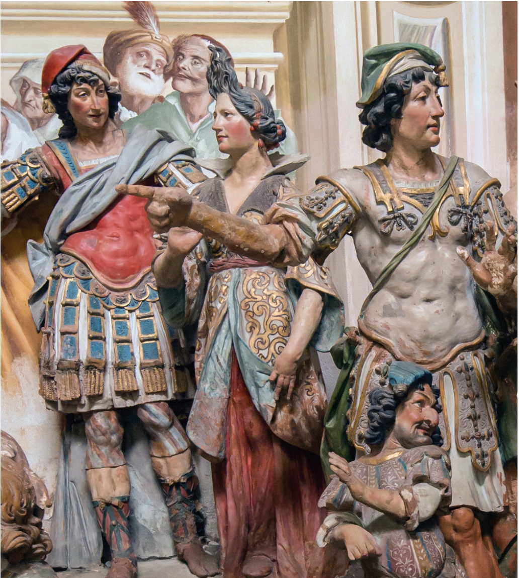
Fig. 3. Well-dressed men and women at Carnival in Assisi. Chapel XIII, Sacro Monte di Orta.

fervent desire to blot out what he saw as the secular dissolution of Carnival, the celebration which preceded the forty days of fast. His Discorso contro il Carnevale bitterly denounces the inappropriate liberties practiced at Carnival, especially by women. On March 7, 1579 Borromeo “issued an edict attacking the customary carnival entertainments in unusually sharp terms, and prohibiting all jousts, theatrical performances, tournaments,