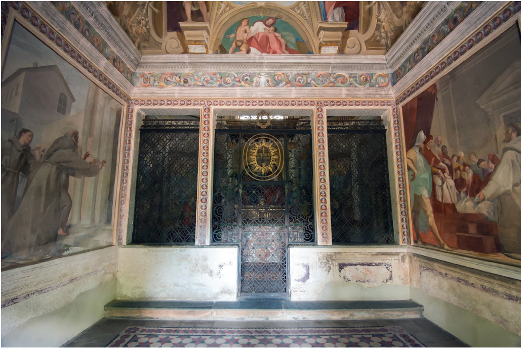
Fig. 1. The Vestibule and surrounding Frescos of Chapel XI. Sacro Monte di Orta.

fers Francis an unspecified boon. Francis asks for an indulgence, which becomes known as the Indulgence of Porziuncola. Following the Blessed Virgin's suggestion, Jesus picks August 2 for the indulgence. 5