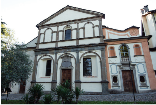
Fig. 68. Exterior of Chapel XX, The Canonization of St. Francis. Sacro Monte di Orta.

retinue attending Francis; Francis' blessing of the friars; Francis dictating his testament; and Francis ascending to Heaven. The fresco cycle weaves a narrative that binds Francis to patriarch and prophet, king and Christ, all