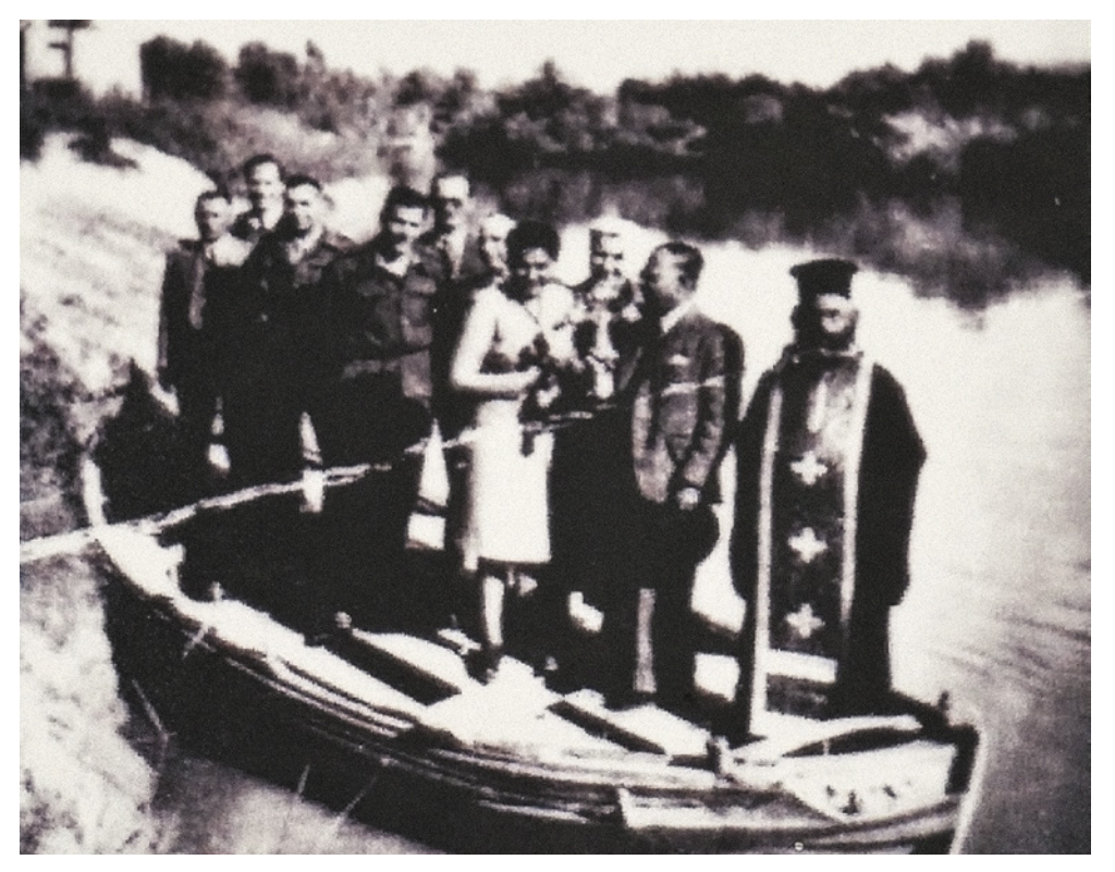
FIGURE 10.1 The Greek Club Collection: at the Jordan River

The attitude to the holy sites was just one example of the divides between the two sub-communities. Other differences often included wealth, education, professions (possibly class) and locations of residence in the city, all of which contributed to their separation from each other and also affected the language divide. <sup>18</sup>