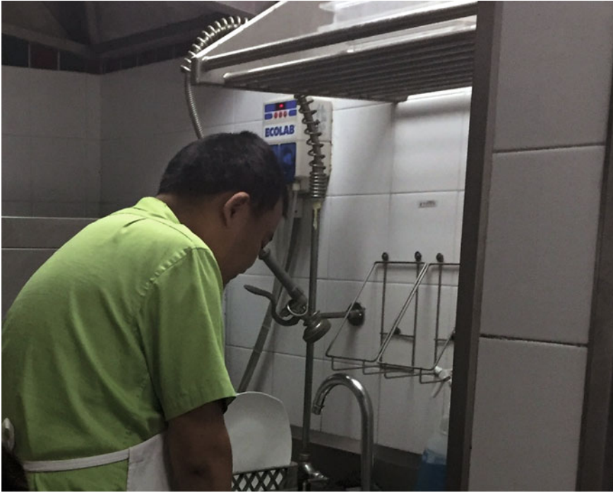
Fig. 1 Mr. QJ at work

Telecommunications Bureau across the street where he can use the free computer and free Wi-Fi. He likes to kill time that way.