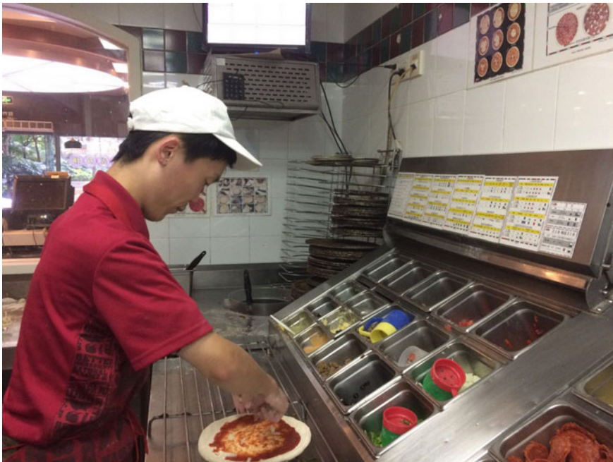
Fig. 1 Mr. H at work

H: Job positions... I make dough and things like that (see Fig. 1) .