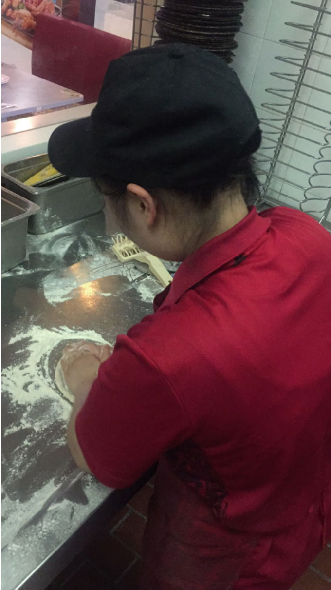
Fig. 1 Ms. Y at work