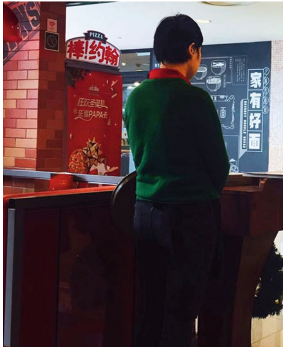
Fig. 1 Ms. ZZ ready to welcome guests

Q: Do you think you are doing a good job at the restaurant?