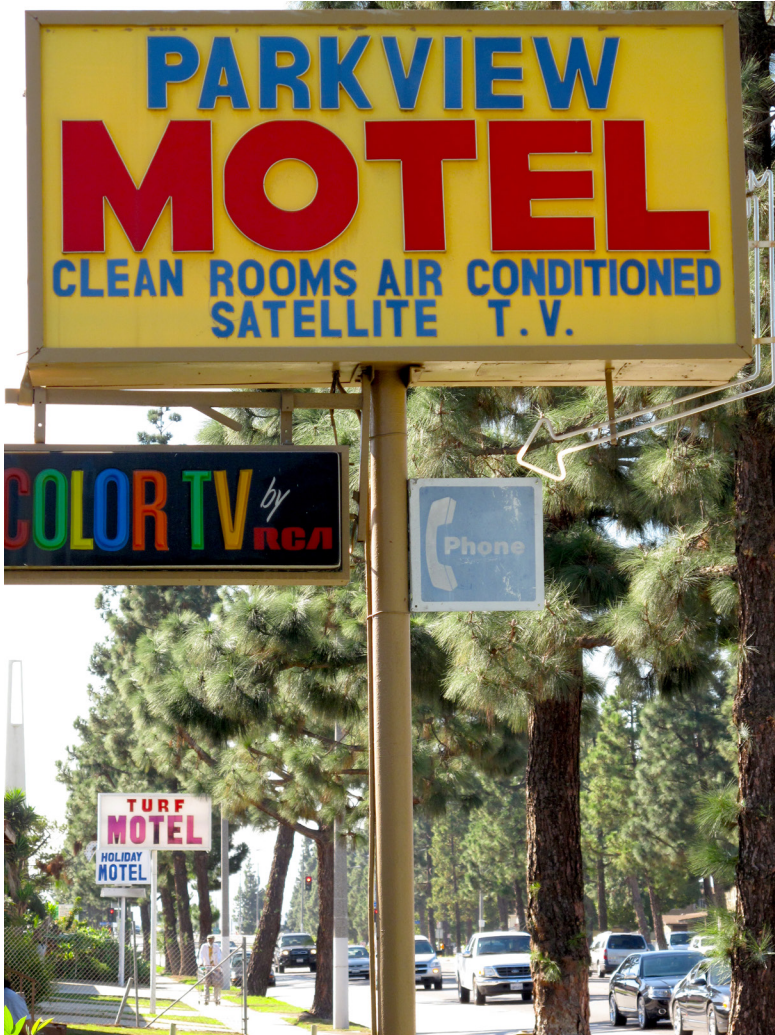
FIGURE 6. Three motels adjacent to Holy Trinity Church near the corner of Arbor Vitae Street and Crenshaw Boulevard in Inglewood.