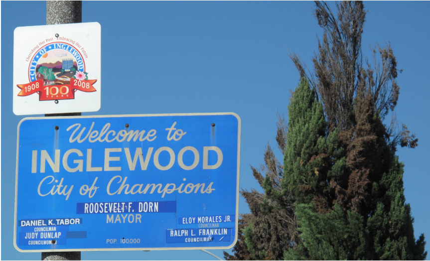
FIGURE 7. Welcome to Inglewood, “City of Champions.” Street sign from 2008.

former home of the Los Angeles Lakers and Los Angeles Kings, has hosted “Battle Zone”—an annual hip hop dance competition that featured a street dance style known as krumping. Born in the neighborhoods of South Central, krumping, or clowning as it is sometimes called, is a hyperkinetic dance resembling street fighting, moshing, sanctified church spirit possession, and aerobic striptease. Every Sunday, the Forum holds the megachurch congregation of Faithful Central Bible Church, where hip hop–inspired gospel star Kirk Franklin formerly led the musical program on Sundays and hosted a biweekly hip hop “Take Over” service. In another sacred-secular twist, the Battle Zone competitions I attended began with a Christian prayer while youth at Franklin’s “Take Over” often krump-danced during Christian rap interludes throughout the service. The arena continues to fuse elements of sport, competition, media, hip hop, and religion and is shaped by entanglements of culture, power, and space that are unique to Inglewood.