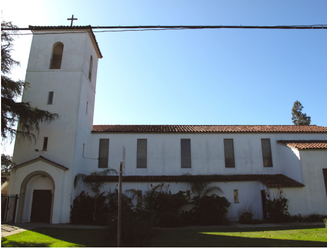
FIGURE 5. Holy Trinity Evangelical Lutheran Church in Inglewood, home to the Hip Hop Church L.A.

shares a block of Crenshaw Boulevard with three motels, revealing how Inglewood remains fraught with social and spatial contradictions. 6