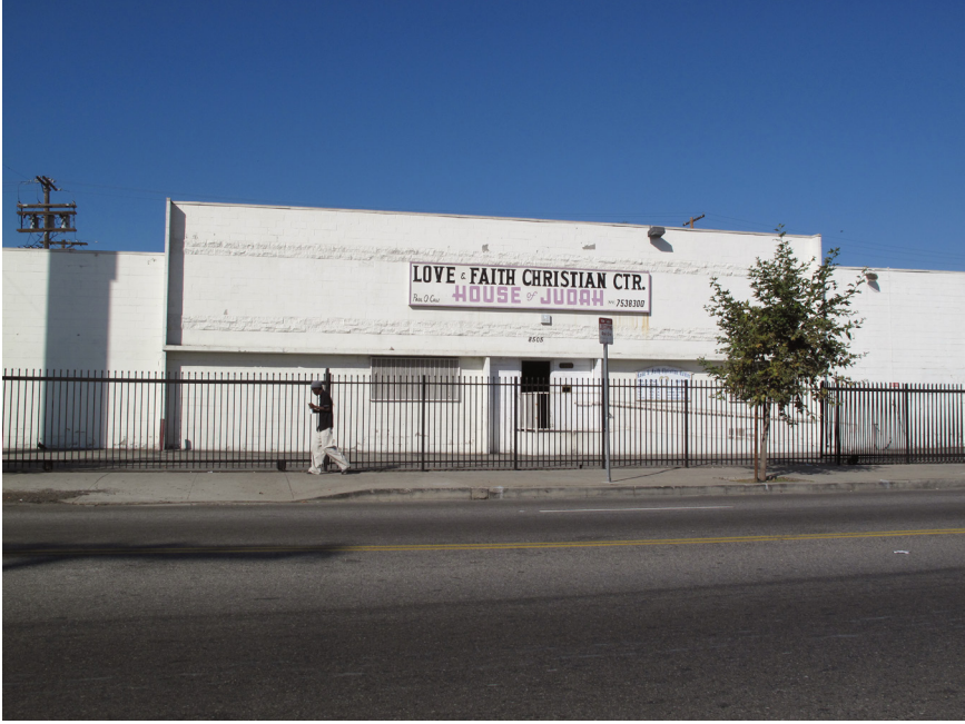
FIGURE 11. Love and Faith Christian Center at the corner of Manchester and Western Avenues. The church was home to the weekly hip hop praise night, Club Judah.

the club back into a church space for Sunday morning service. The fluorescent lights flickered on; those present folded up the tables and chairs and stacked them neatly in rows against the walls. Witnessing and partaking in the temporary, fleeting nature of the “club” space was surreal at times. The youth who were invited there in the hopes of religious conversion were also a part of the spatial conversion of the evening.