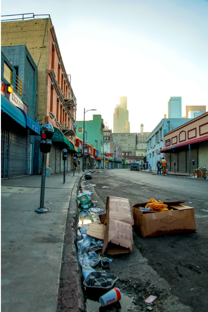
FIGURE 9. The view down Winston Street from the corner where The Row takes place every Friday night on Skid Row.

During the several years that I attended holy hip hop events, gospel rap artists generally preferred “mixed” events that embodied heterogeneity and promoted an individual’s process of becoming in both a musical and religious sense. 38 Although, this was not always what was actualized at these events, and the outcomes of such