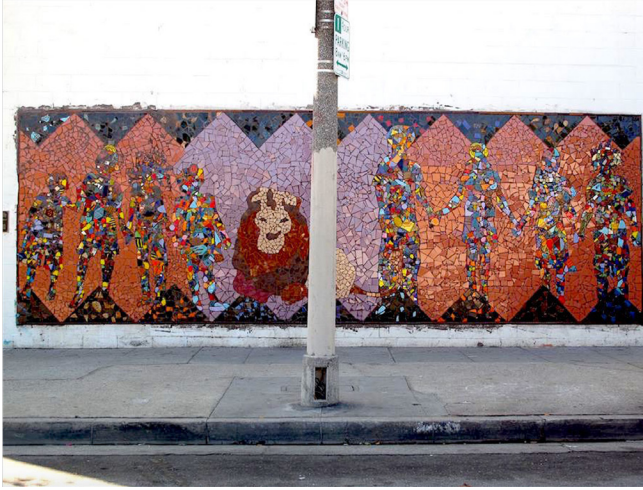
FIGURE 12. The Lion of Judah at the center of a mosaic-tiled mural on the side of the Love and Faith Christian Center.

sometimes a symbol of Jesus in the Christian tradition, is also a potent image for the Rastafarian movement and often depicted as golden and crowned. Dancehall reggae-inspired hip hop grooves, over which gospel rappers were “Spittin’ Holy Fire,” often graced the stage of Club Judah, further forging sonic and spiritual connections between black Atlantic religious cultures. Some of the holy hip hoppers in attendance participated in the rioting on those very same grounds fifteen years earlier before they were “saved.” These were the everyday gospel rap alchemies that transformed gun metal into lion’s gold. This was earthquake music in action, wherein within destruction also lies the possibility for creation.