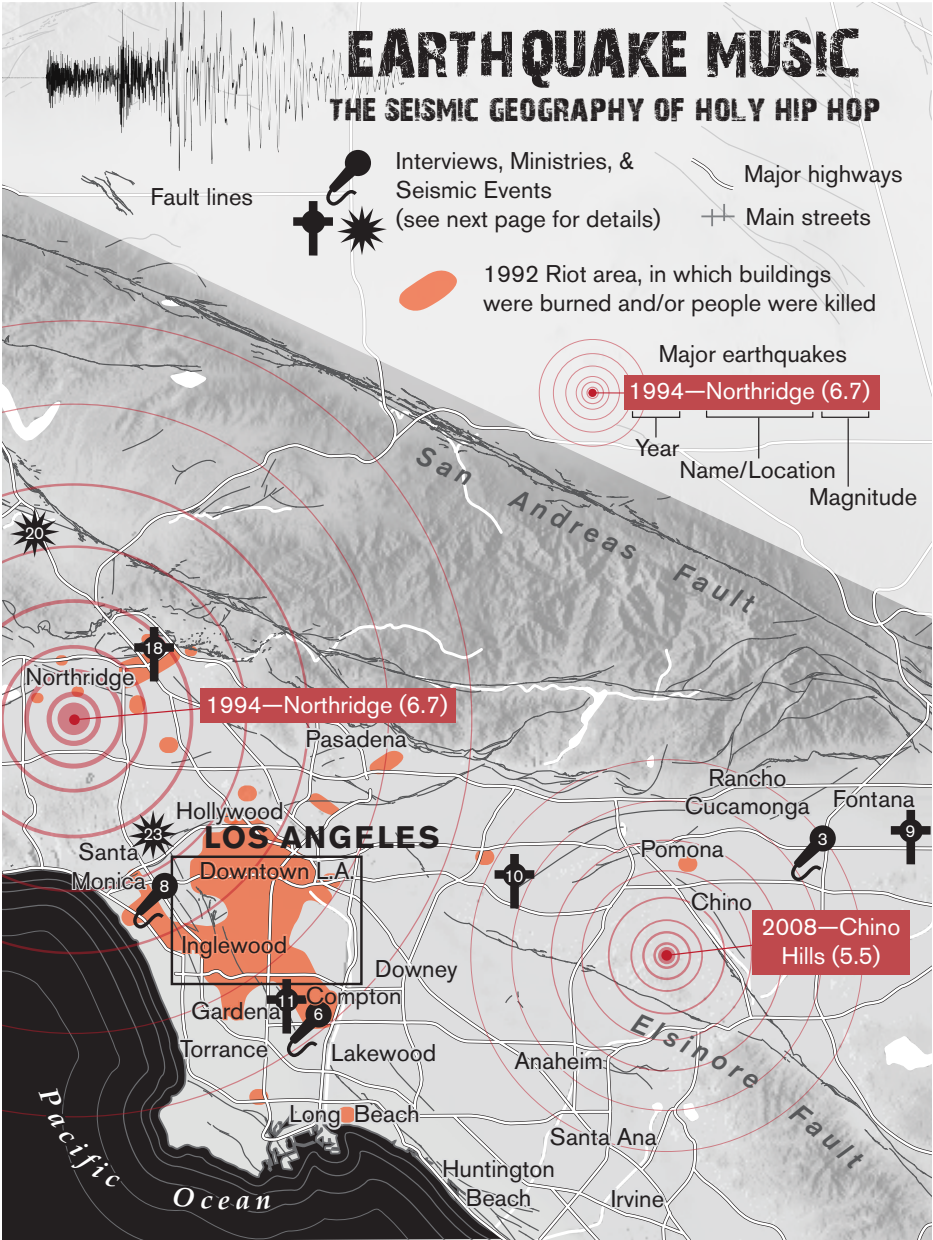
MAP 1. "Earthquake Music" map by M. Roy Cartography (refer to page 26 for map legend).