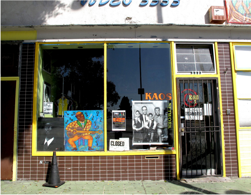
FIGURE 10. KAOS Network storefront in Leimert Park featuring a photograph of Malcolm X and Muhammad Ali. KAOS Network was home to both the underground hip hop freestyle event, Project Blowed, and the gospel hip hop open mic, Klub Zyon.

different hieroglyphs and figurines rendered in an Egyptian aesthetic. The interior décor paints a black Atlantic scene that links specific places and genres—Los Angeles, hip hop, Nigeria, afrobeat, Egypt, and bebop—across both real and imagined terrains of local and transnational crossing. During nights that I attended Klub Zyon, nothing was physically altered in the space except the sounds and bodies inhabiting it; the social, musical, and religious dimensions of Klub Zyon were what defined the event as distinct from its secular counterpart, Project Blowed. Although the majority of the performers were young African American males, I was always struck by the consistent diversity of the crowd, which included people of various socioeconomic classes, ages, sexual orientations, and religious, racial, and ethnic backgrounds, hailing from various Southland neighborhoods, and exhibiting a wide array of urban apparel and fashion—from understated in a T-shirt and jeans to what some may consider a Christian “ghetto fabulous” style.