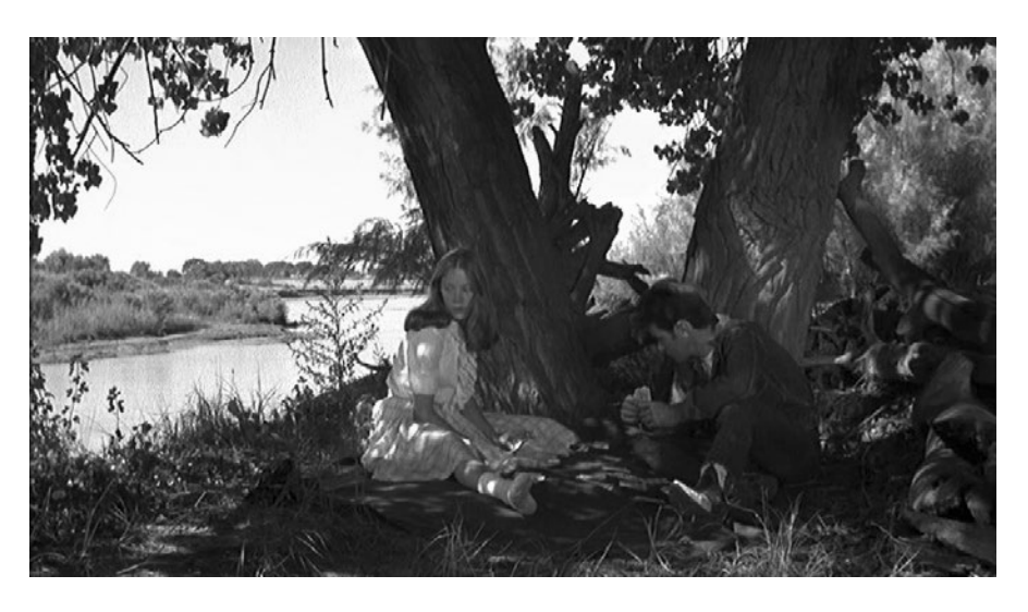
Figure 0.3 'The tree makes it nice': Badlands (Warner Bros.)

purposes of a romantic scene. The players have become too aware of their surroundings, too self-conscious of the ways in which their story will intertwine with those surroundings.