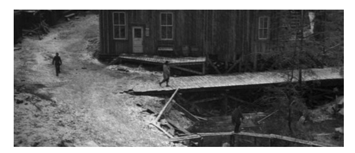
Figure 5.3 Hopeless orientation: McCabe & Mrs. Miller