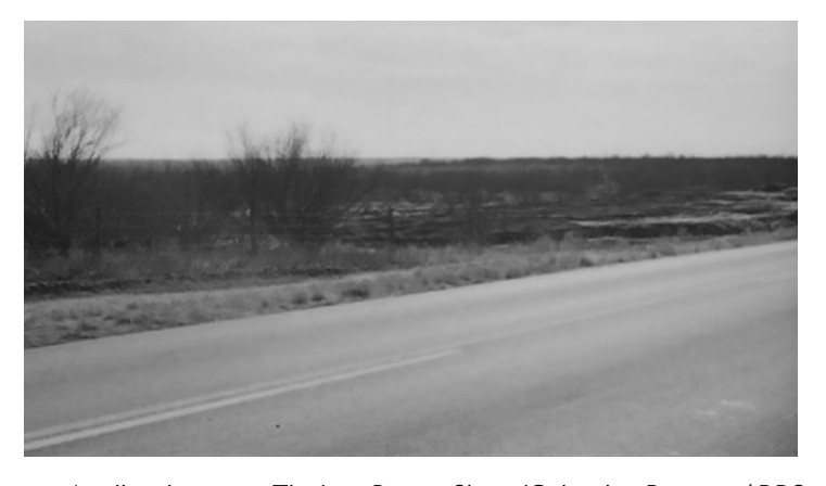
Figure 5.1 A telling location: The Last Picture Show (Columbia Pictures / BBS Productions)

Architecture, much lighter in South. Gray, heavy and stony – much more massive and colder in the North. Maybe Lila and Walter should go North to South –