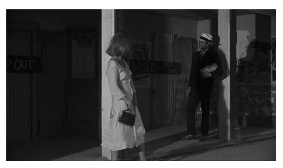
Figure 3.3 'A mobile organicity': Bonnie and Clyde (Warner Bros. / Seven Arts)

which alternately follows a path and has followers, creates a mobile organicity in the environment' (1984: 99). Walking emerges as an environmentally creative activity, even a statement: