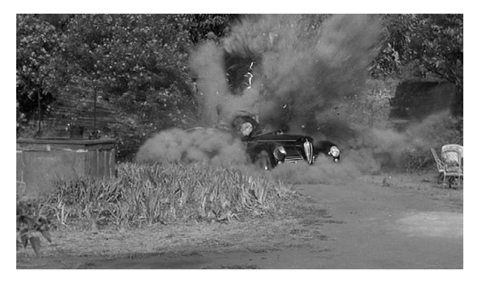
Figure 2.2 The machine in the garden: The Godfather (Paramount Pictures)