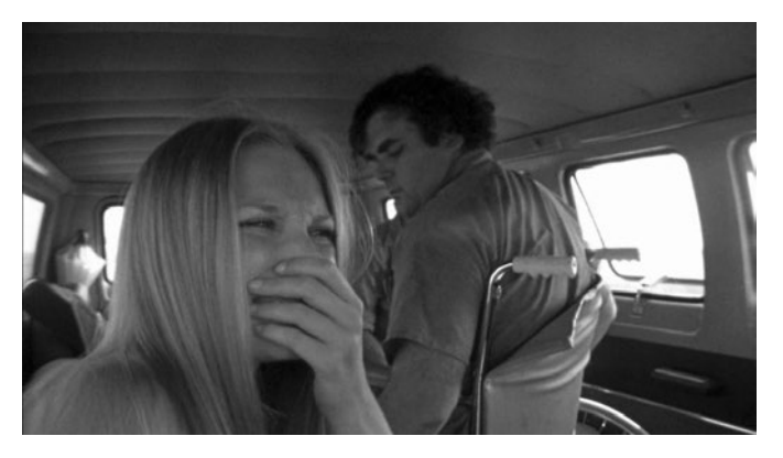
Figure 4.1 Revolting surroundings: The Texas Chain Saw Massacre (Vortex)

Central to this is the role of both oil and agriculture in the fate of the youngsters; it is their reliance on fuel, for example, which leaves them susceptible to the murderous family, and that family's brutal techniques are explained as being the fruits of their agricultural training. The implications of this (which a number of other commentators have remarked on) will be discussed in slightly more detail below, when situating the film in more of an historical context. At this stage, it is useful to consider how the film's drama is also dependent on quite basic, essential 'qualities' of Texas. The intense heat and bright sunlight, for