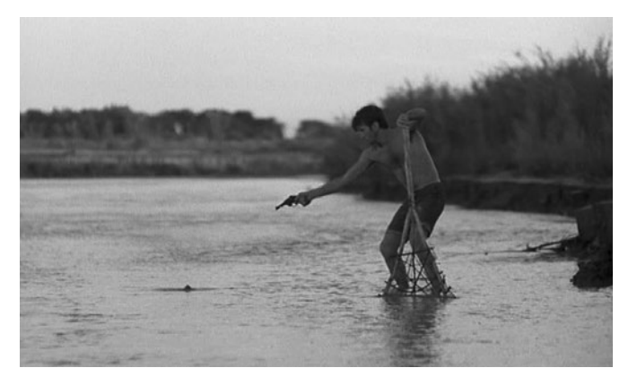
Figure 2.3 The 'real' Kit: Badlands (Warner Bros.)

It is dusk, and Kit is wading in the river, fishing. We have already seen him fail miserably at this, and he is failing again. In the far distance a white truck drives past, and Kit looks up to follow it. It is more than a glance - he stands erect in order to see the van properly - but it is difficult to ascertain whether he is looking nervously (Kit is wanted for murder) or longingly. After one final attempt to catch a fish he sheepishly brings out his gun; the film cuts briefly to a distant onlooker, back to Kit shooting, and finally once more to the onlooker, who hastily walks away, presumably to report what he has seen. Kit has already displayed his willingness and ability to adapt to the woodland environment in a number of ways, so what prompts him to turn to the gun? Did the passing van remind him of the impossibility of a new start in a new world? After all their effort, he and Holly are barely a stone's throw from the nearest main road. 'Let's not kid ourselves', he could be thinking, 'I might as well just shoot'. This is the first fateful decision made in the scene; the second is on the part of the onlooker, who does nothing until he sees Kit shoot, at which point he decides that this stranger is definitely to be dealt with. It is not clear whether this man knows anything about Kit (or that there is a