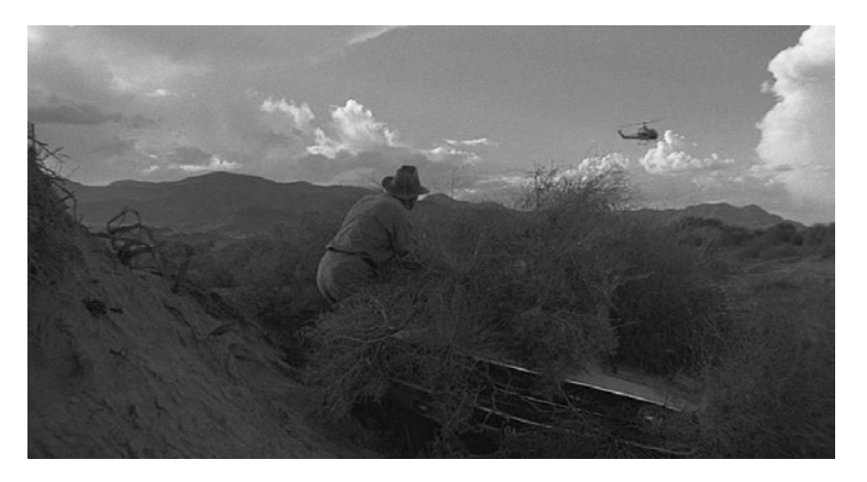
Figure 3.4 Rooting in: Vanishing Point (Cupid Productions / Twentieth Century-Fox)

The advice to 'root right in', to not leave one's situation, might initially seem to contradict the basic ethos of the fugitive film, but perhaps it reveals something more nuanced and brings us closer to what is interesting about this genre's value system from an ecocritical perspective. Contrary to first impressions, actual escape is not what is at stake in the fugitive film (Kowalski is at one point advised that he cannot 'beat the desert'), but rather the characters' methods of relating to an environment. According to the logic of the prospector, engaging more fully and more imaginatively with your current surroundings represents its own kind of rebellious independence. Bonnie and Clyde, Mary and Larry, Doc and Carol,