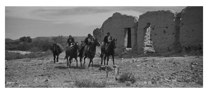
Figure 3.2 Indeterminate boundaries: The Wild Bunch (Warner Bros. / Seven Arts)