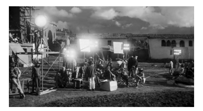
Figure 5.2 A film present in the world: The Last Movie (Alta-Light)

partly because the film's very narrative is propelled by the activity of location shooting, and partly because the ethics of location shooting are brought into question, and kept perpetually in play. Ara Osterweil has already written an excellent study of this film's geographical politics and philosophy (and even, as part of this, performs a regional reading of it); while I recognize the deep contradictions Osterweil identifies in Hopper's project, 'between movie-made fantasies of space and the real-world practices of place' (2011: 184), an ecocritical approach seems to reveal something a little different. What is striking in Hopper's film is not so much its political incoherence, and the galling chasm which separates its rhetoric from its production circumstances, but rather the way in which it is continually drawn to depictions of filmmaking as a fundamentally located, bodily activity. It seems wonderfully evocative of its time, not for its disillusioned commentary on countercultural ideals, but for its sense that Hollywood filmmaking has now to be imagined as a presence in some sort of territory.