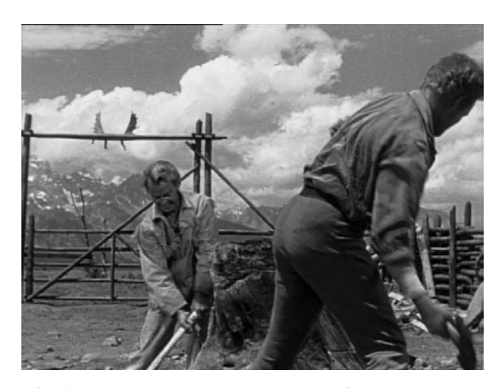
Figure 3.1 Symbolically conquering the environment: Shane (Paramount Pictures)

and vital importance for the various homesteaders, these are not the grounds on which Joe convinces them to stay. For the homesteaders, for Shane , and to no small extent for the western as a genre, the land generates its importance from what it stands for and is meaningful to the extent that it can be overcome. As is exemplified in the stump-chopping episode, this overcoming is in play, but rarely in doubt.