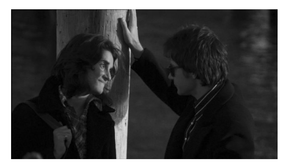
Figure 0.2 Resisting the setting: Mean Streets (Warner Bros.)