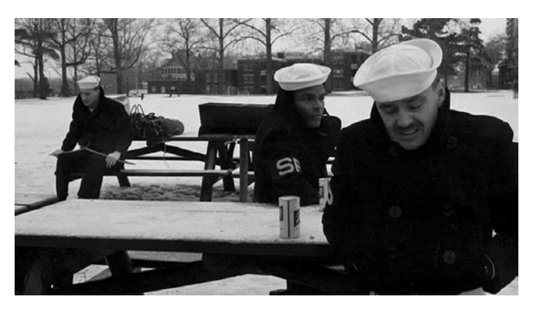
Figure 4.4 'He's come a long way': The Last Detail (Acrobat / Columbia Pictures)

In her 1974 Cannes Film Festival report for Sight and Sound, Penelope Houston suggested that The Last Detail 'knows exactly where it's at [...], preserving its sense of balance, scale and detail' (1974: 143). In a piece a few years later (quoted above), Roger Greenspun used a noticeably similar description in reference to The Texas Chain Saw Massacre, arguing that 'it almost always understands what it's looking at' (1977: 16). These reviews seem to be responding to quite allusive qualities of scale and scope that this chapter has interpreted ecocritically. The environmental sensibility of New Hollywood is a quality which is traceable not only to its films' presentation of spaces and places and materials, but also to the geographical range of its dramas. George Kouvaros's study of the films of John Cassavetes is called Where Does it Happen? (2004),