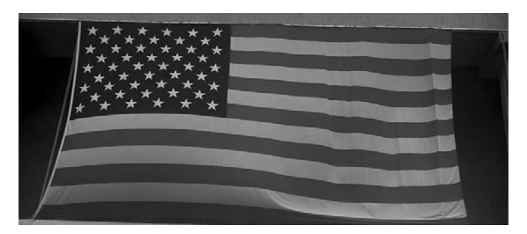
Figure 2.1 The flag as thing: Nashville

gathering is a mirroring, or channelling, of the US nation. This may be so, but it would be a mistake to turn away from the flag and towards the characters too hastily, as Nashville is as complicated and ambiguous in its deployment of this as it is in casting the fates of its ensemble.