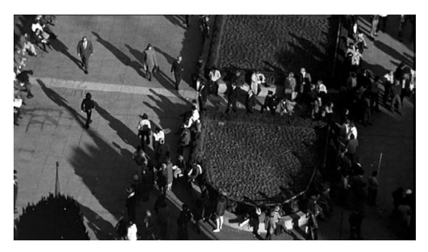
Figure 5.4 A zoom in search of an object: The Conversation (American Zoetrope / Paramount Pictures)

Jaws is a film whose very premise is bound up with filmmaking challenges: a huge shark; underwater point-of-view shots; night scenes on boats; numerous crowd scenes. As in the examples of Easy Rider and The Conversation, such practicalities at certain moments become meaningful constituents of the film's fictional fabric. This is especially the case in the first half of Jaws, when much of the drama is of a logistical nature (how can a busy beach be policed by a man unwilling to go in the water?), and Spielberg strives to establish the beach as a barrier whilst also allowing us privileged glimpses of the shark's movements. The most famous zoom in Jaws is almost certainly the track-zoom into the face of a panicked Chief Brody (Roy Scheider), repeating the technique Hitchcock used in Vertigo. It is an effective punctuation, and Spielberg has been given too little credit for his significant variation on Hitchcock's effect (the two moments achieve quite different results). However, there is another zoom which appears later in Jaws, and which is at once more conventional and more mysterious.