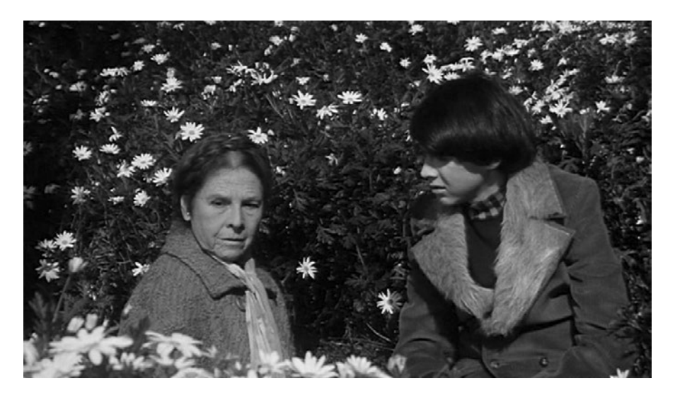
Figure 0.1 Falling in love: Harold and Maude (Paramount Pictures)

On what terms does Harold and Maude invite us to understand, enjoy and sympathize with the relationship of its central characters? Primarily, I would argue, it does so on environmental terms; but not in the sense that Ashby's film prioritizes an environmentalist 'message', regarding issues such as pollution, conservation or energy sustainability. I instead suggest that the non-human world becomes significant and meaningful not simply as a reflection of Harold and Maude, but as an independent context, and one which cannot be reduced to