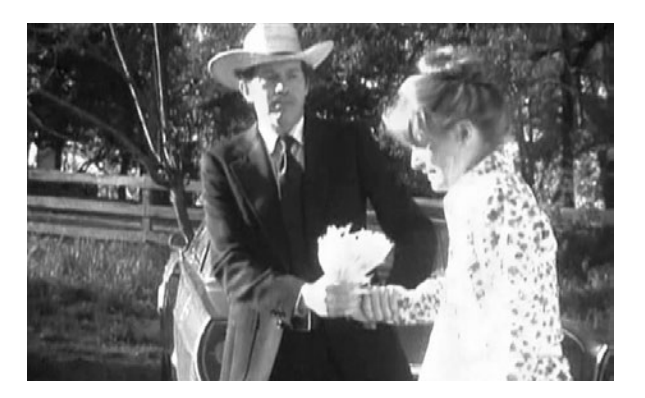
Figure 4.3 A sentimental education: Cockfighter (New World Pictures)

requires us to think of nature not as in the abstract, but rather as something which is only visible and meaningful in particular manifestations.