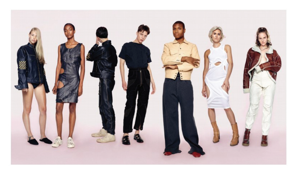
FIGURE 1: Vejas AW 2015. Photo by Rachel Chandler (published in Dazed ).

Characterized by the color black, soft, draped fabrics, the likes of dropped-crotch pants and distressed leathers, Owens' designs have projected a gothic aesthetic, and change little across fashion seasons. Skillfully cut, and ignoring fashion's obsession with 'newness', they typically defy distinct gender identification. They are products of Owens' training in pattern cutting, skill in draping, interest in sportswear and undoubtedly are influenced by his own self-declared bisexuality (Frankel 2011). Showing both women's and menswear collections, he has also challenged the norms of the fashion runway show with his focus on consistency, rather than rapid seasonal change, providing his designs with 'an aura of timelessness' (Yoon 2015) (Figure 2). The concept of confounding fashion time also resonates with less binary prescribed design relationships to gender. That said, 2015 also witnessed interesting changes in the gendering of fashion retail, which internationally reinforces 'men's' and 'women's' wear by the separation of garments and accessories in shops, and on websites.