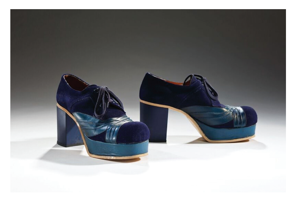
FIGURE 2: In the early 1970s, the most popular form of footwear remained traditional lace-ups, although these were updated by the addition of high heels and platform soles. American, early 1970s. Collection of the Bata Shoe Museum (S96.0066).

sexual exploits and throngs of female fans (Semmelhack 2015: 72). Even disco culture, which in its early years was a gender-nonconformist space, quickly became co-opted by mainstream culture, and the heels men wore as part of disco fashion became associated with the kind of macho heteronormativity embodied by John Travolta's character Tony Manero in the 1977 disco film Saturday Night Fever (Semmelhack 2015: 72). As Mark Siegel has written, these types of performances are an aspect of what anthropologists call the rite of intensification, which 'functions to restore social equilibrium where the patterns and laws of social interaction are changing' (Siegel 1980: 305).