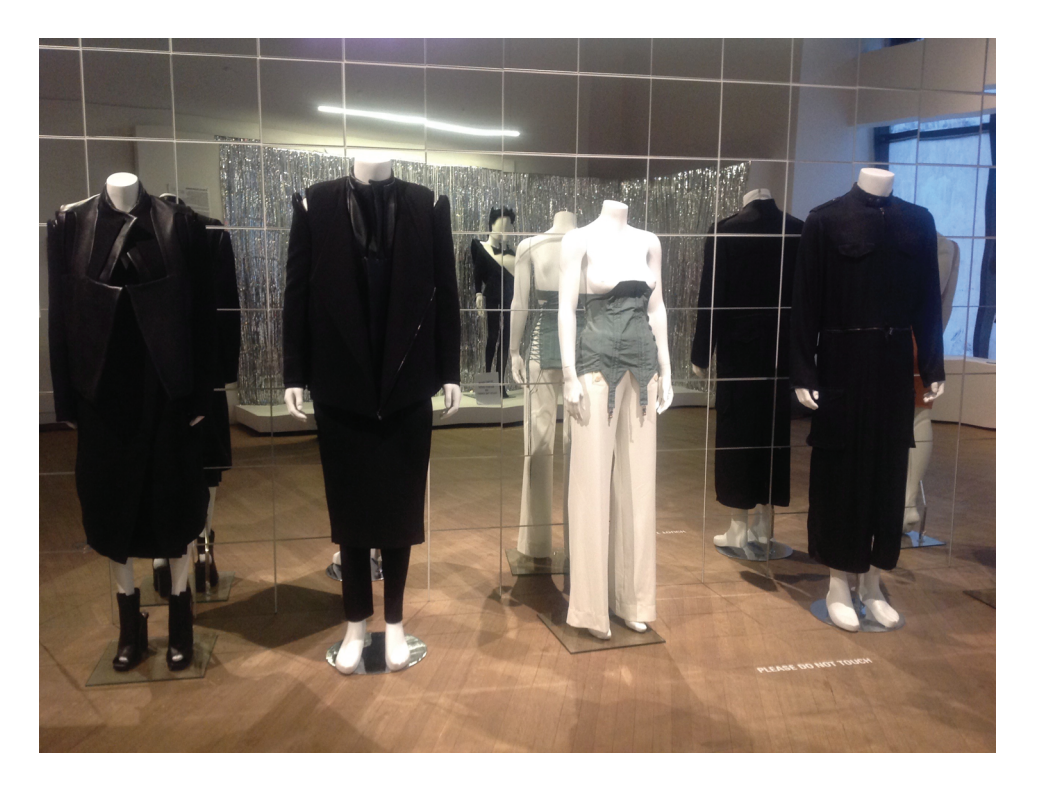
FIGURE 1: Hourani's work (left) featured in the exhibition Politics of Fashion | Fashion of Politics at Toronto's Design Exchange, juxtaposed with pieces from Gaultier.

the modernist principles and ideals of haute couture – a historical precedent that creates a productive tension with his forward aims. From its earliest incarnations in mid-1800s Paris, haute couture has been oriented toward a female consumer (see Evans 2013).¹ While couturiers such as Jean Paul Gaultier have pushed the boundaries of gender and queerness, none before Hourani have crafted unisex garments (for a comparison, see Figure 1). Hourani intends for his clothes to be adaptable to a spectrum of bodies, invoking couture's foundations in made-to-measure construction: indeed, he offers private fittings to preferred customers. Further, his intersections with the fine art world recall the professional crossovers of 1900s couturiers such as Paul Poiret (see Troy 2004). While Hourani finds in unisex a release from societal constraints, his aesthetic remains strikingly uniform – one component of a modernist ethos of repetition and streamlined forms whose semiotics perpetuate fashion's preference toward lean bodies. Nonetheless, his artistic work undercuts linearity and replication just as it invokes it, indicating