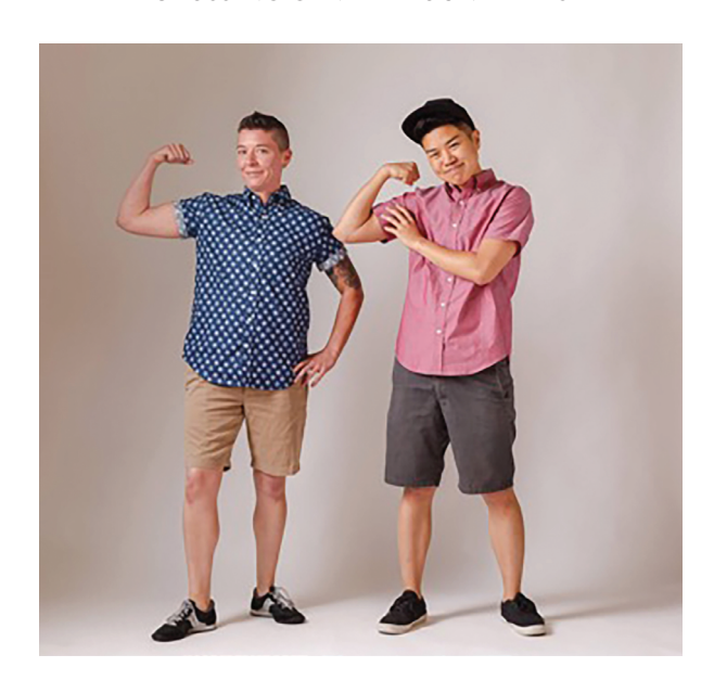
FIGURE 2: Models wearing some of Saint Harridan's casual options.

Going said that the made-to-order suits have a 'sleek masculine cut' that was 're-engineered for women and transmen' (Saint Harridan 2016a: para. 1). For example, one of the vests was designed with eight buttons down the center front to prevent gaping for someone with a larger bust (Going 2012). These custom suits were originally retailing between $695 and $840 (Huber 2013), but later the prices went up, and the same suits sold for $1,198. The suits were made in the United States, in union factories in both Massachusetts and North Carolina, which Going personally visited to ensure worker safety; she related, on the company website, that 'if we are going to rise, we must all rise together', which highlights her commitment to social justice in all aspects of her company (Saint Harridan 2016d).