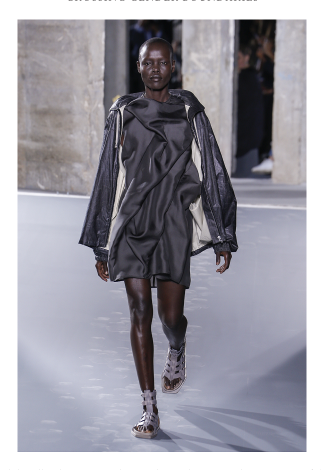
FIGURE 2: Model walks the runway during the Rick Owens show as part of the Paris Fashion Week Womenswear Spring/Summer 2016 on 1 October 2015 in Paris, France.

Garçons and Alexander McQueen, but also for her eponymous ungendered clothing brand (http://t-o-o-g-o-o-d.com). The department was described as follows: