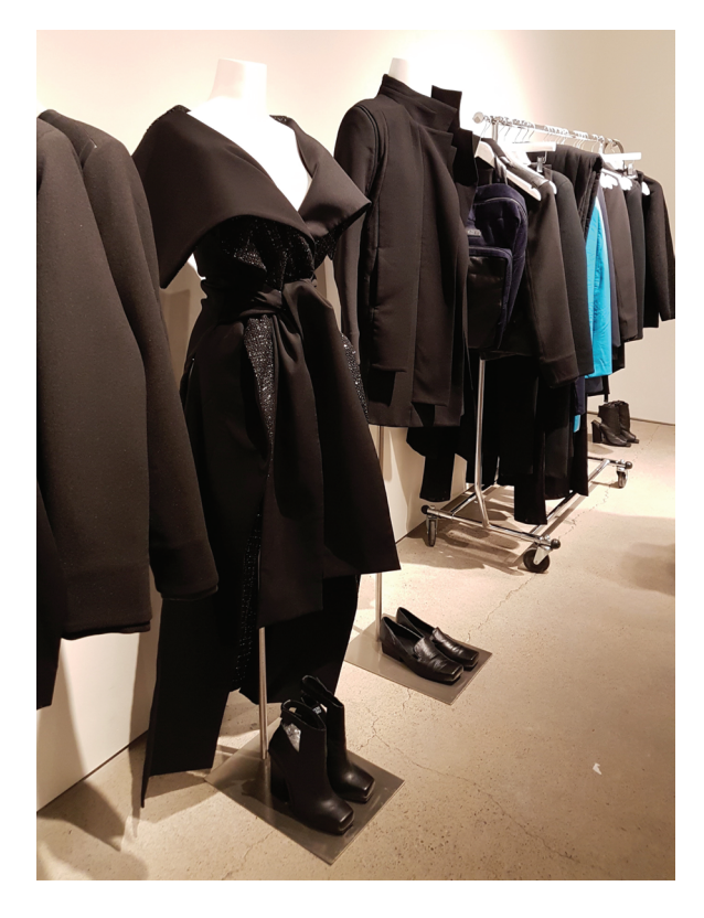
FIGURE 2: Fall 2016 Rad Hourani pop-up store, Toronto.

form or to efface it. Collections are founded on structured blazers and coats, often with pointed shoulders, that form a vertical line (see Grulovic 2014): such pieces appear minimalist but utilize complicated tailoring, hidden and/or visible ties and trompe l'oeil effects that permit wearers to transform or adapt them to their individual shape (see Friede 2013: A3). Hourani combines leather and PVC with wools and other luxurious materials, manifesting new possibilities in the manipulation of thicker, gnarled textures. His lesser-priced lines also include structured and jersey tunics, tapered trousers, shorts and leggings, all of which can be worn in multiple combinations. Hourani has launched limited-edition accessories, including a mesh tote bag, unisex platform shoes and a pair of futuristic sunglasses. His earliest collections were meditations on black (Anon. 2009a), though he has incorporated solid turquoises, purples and khakis in later seasons, and in 2016 released Unisex Red Collection, consisting of open-front wool coats