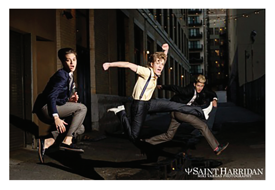
FIGURE 1: Models wearing Saint Harridan's suit and suit coordinates. The center model has on the 'queer it up a notch' bow tie.

Saint Harridan's product assortment included casual clothing, custom suits and related business-casual garments and accessories, such as the 'queer-it-up-a-notch bow tie' (see Figures 1 and 2) (Saint Harridan 2016d). Because the majority of apparel companies target those who are heterosexual and gender-conforming, Going explained that Saint Harridan's goal 'has always been to provide masculine clothing to women and trans men' (personal communication).