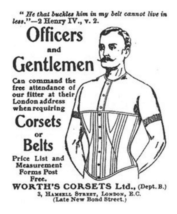
FIGURE 2: Worth Corset Advertisement. Punch, 4 January 1905: v.

The aforementioned article in Fashion also called upon 'soldiers and good sportsmen' and refers to them as 'hard and straight' thanks to their 'belt' (Shannon 2004: 623). It even went so far as to call upon the colonial desire in men by stating that 'when hunting in some of the wilder parts of the world, where the going was of the roughest, a good flexible supporting belt was of wonderful assistance in the preservation of one's staying powers' (Shannon 2004: 624).