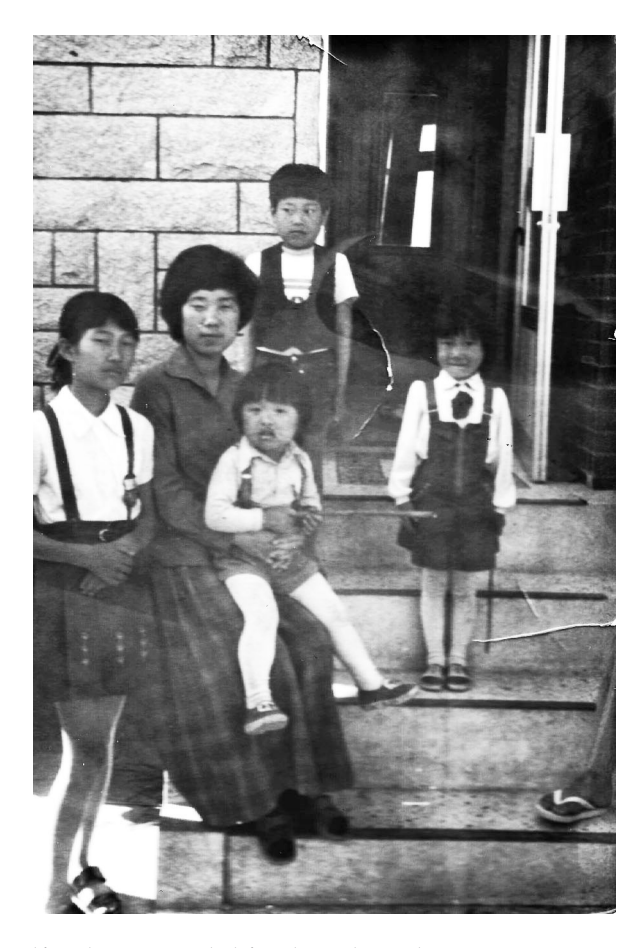
FIGURE 1: Myself with my extended family in the mid-1970s in Korea. I stand alone, away from the rest of the group. This is the time when my yearning for my life to be different from other girls started to develop.

Figure 1 shows me when I was 4 or 5 years old surrounded by my extended family in the mid-1970s. My mother was a quintessential conformist, and what others would think of her was a very important factor for her dress behavior. Dress behavior researchers explain this type of behavior as conformity in dress. That is, one's appearance management behavior is exhibited by their desire to conform to social influences. Therefore, conformity in dress shows a collective dress behavior and communicates the appearance standards in a certain society at a given period (Piamphongsant and Mandhachitara 2008). With conformity in her mind, my mother was in charge of selecting appropriate clothing for me