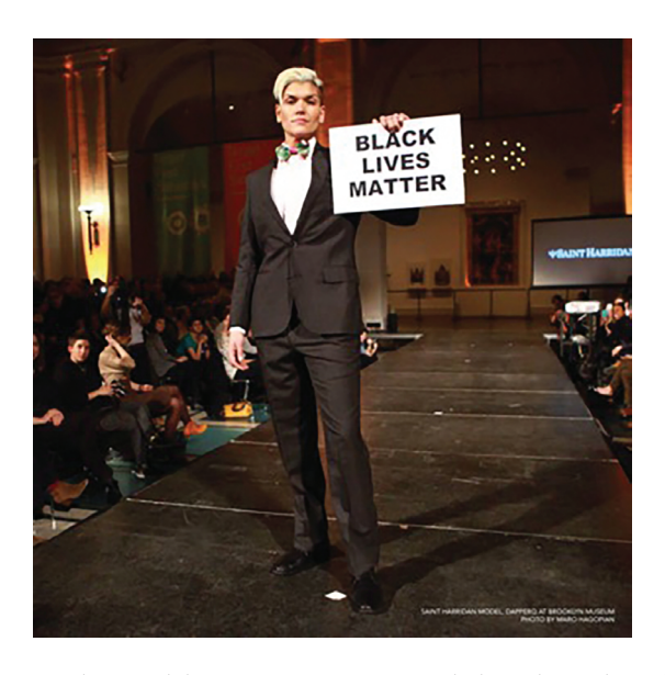
FIGURE 3: Saint Harridan model on runway at '(un)Heeled: Fashion show for the unconventionally masculine', held at the Brooklyn Museum in December 2014.

While gender and sexuality are central to the dialogue about and reproduction of gendered imagery, Saint Harridan also engaged in struggles surrounding race, as a form of solidarity with other marginalized groups. They participated in a fashion show titled '(un)Heeled: Fashion show for the unconventionally masculine', held at the Brooklyn Museum in December of 2014, which was put on by DapperQ, the premier queer style blog and website in the United States, which focuses on masculine-presenting women and transgender individuals. In the fashion show, saints marched the runways holding signs reading 'Black Lives Matter', drawing much of the attention away from the garments and styled bodies and onto the high-contrast signs seen in numerous protests that year due to the significant number of deaths of unarmed Black people at the hands of police officers (see Figure 3). Saint Harridan's models were later blogged about on Tumblr, with posts such as 'Kay for #Saint Harridan in Brooklyn, standing in solidarity with #blacklivesmatter. It cannot be said enough. All of our lives should be full of dignity and safe from violence, so we must make visible these inequalities which shorten or endanger the lives of some'.