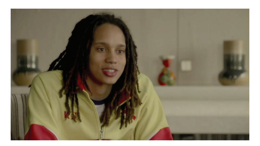
FIGURE 1: Image of Brittney Griner from Brittney Griner: Lifesize.

To be 'mannish' is to both transgress and instantiate dominantly outlined dictates around gender – to at once be recognized and misrecognized as masculine. When 'mannish' female-bodied people, particularly Black people, are ridiculed or castigated for being so it is because they ostensibly mark a failure and/or refusal with regards to gender – and in so doing potentially reveal the many (il)logics of gender, sexuality and race that fail to neatly and naturally cohere for all (Black) masculine people. Moreover, as Noble outlines in their engagement with Eve Sedgwick's axioms of gender, female masculinity is often, though not always, rooted in same-sex desire (Noble 2004). The frequent readied designation of female masculine people as sexually queer often becomes a shorthand deployed to apprehend their gendered difference, and highlights both a persistent homophobia as well as the difficulty to name female masculinity despite its ubiquity within public cultural