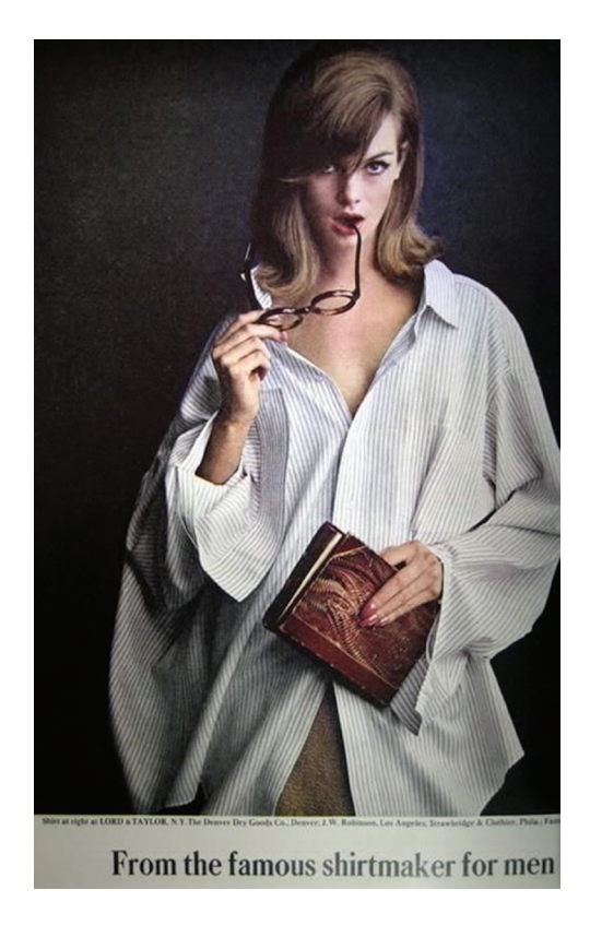
FIGURE 2: 'From the famous shirtmaker for men', Lady Van Heusen c. 1964.

Shrimpton is shown wearing a traditional striped button-front dress shirt with a high collar, French cuffs and right-over-left front buttoning that distinctly genders the shirt as female. Her beauty is downplayed and traits of feminine frivolousness are renounced as the headband, whistle, scholarly glasses and book in hand serve to frame her as a serious and intellectually assertive woman. Shrimpton's erect posture and self-possessed gaze furthermore reiterates her power over the viewer and in doing so evokes the expression of masculinity. In contrast, her role is reversed in the second, more sexually charged image (Figure 2) where she is featured wearing a partially unbuttoned shirt that displays more skin at the neck and reveals a hint of cleavage. Although the shirt in the second image appears remarkably similar to the first image, the breast pocket, baggy fit and left-over-right buttoning code it as masculine. At the same time, all figurative connotations of masculinity are eliminated as Shrimpton's tousled up hair, cleavage and sultry expression with her slightly open mouth function as seductive symbols that make her the spectacle of male desire and invites the viewer to gaze at her body.