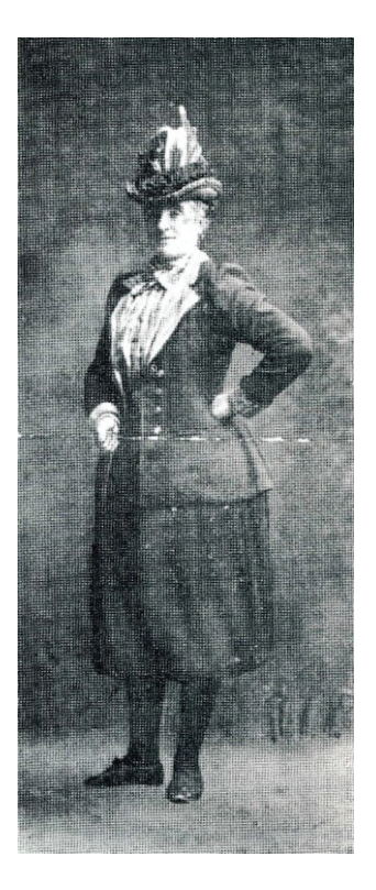
FIGURE 1: Viscountess Harberton in a bifurcated skirt, c. 1890. Wilson and Taylor 1989: 58.

beauty in dress was essential and that differences of 'colour, of texture, and of material, are a source of pleasure to the eye, and if these are discarded by women as they have already been discarded by men, much that is picturesque in modern life will disappear' (Anon. 1888: 2).