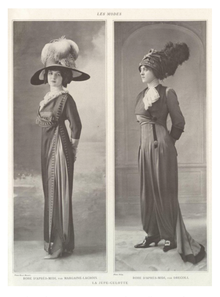
FIGURE 2: Jupe-culottes by Margaine-Lacroix and Drecoll. Les Modes, 1911.

Indeed, one of the dominant assumptions under modernism is that it 'rescued' women from the antiquated trappings of femininity in Victorian culture: the corset, the cage crinoline and the bustle. The donning of trousers might be viewed as the culmination of this tendency. Among the earliest of designers who proposed the 'harem skirt' or 'jupe culotte' as a form of fashionable attire were Drecoll and Bechoff-David (Fischer 2001: 175) (Figure 2). Paul Poiret is certainly the most popular designer to exploit a range of 'revolutionary' sartorial gestures, 'freeing' women from the constraints of Edwardian dress. However, in practice and in