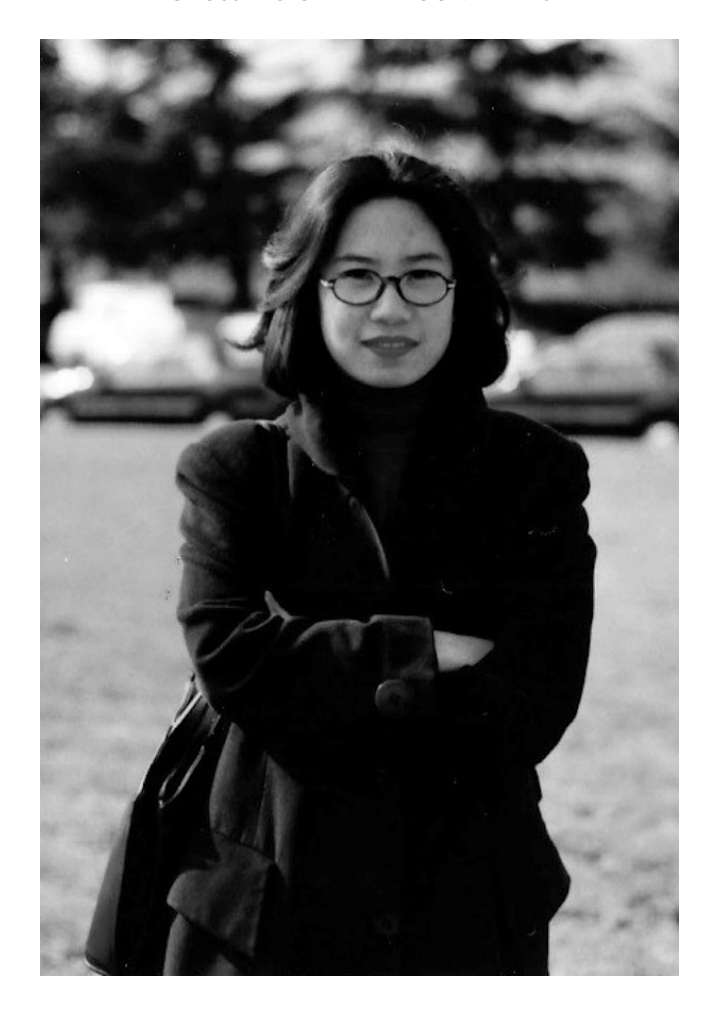
FIGURE 2: Myself in 1993 when I was a college student. This was my best attempt to be the 'beautiful professional woman' that I needed to be. I had longer hair and a dark green wool long coat.

However, this conforming dress behavior was completely disrupted when I moved to New York City in 1996. Instantly, overnight, I was exposed to completely different trends, society and environments. I looked very different from people in the streets. I could no longer find the ideal images as to how I should look or dress. Suddenly, I had to find my own way to dress myself to fit into this new world. Furthermore, ever since I started working full time, I traveled all over the world. I no longer needed to look certain ways. Everyone was so different. I already looked different. There was nothing to which I needed to conform. I felt totally free.