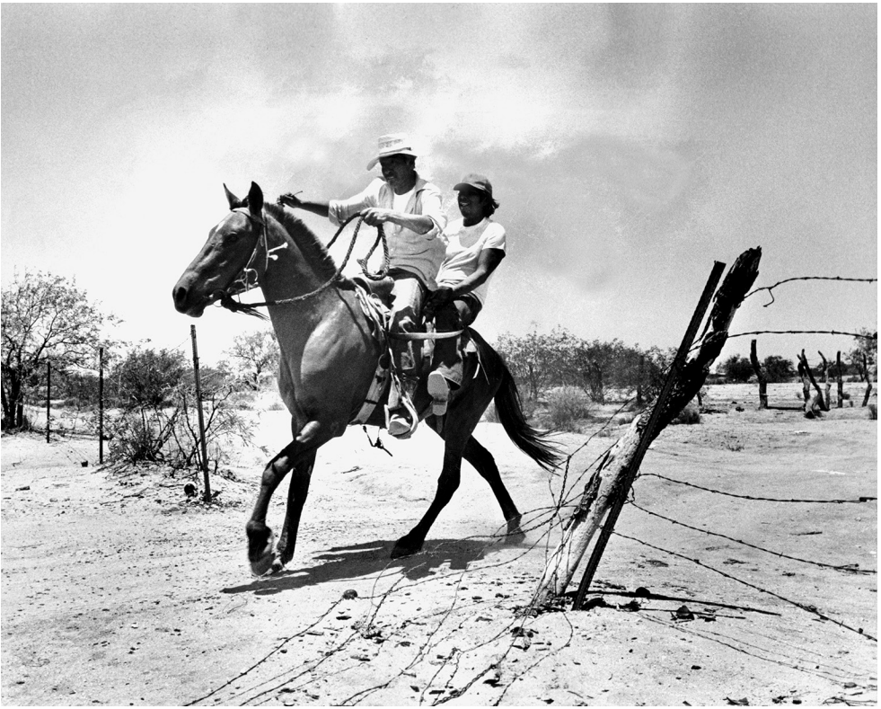
Two Tohono O’odham crossing a fallen section of border fence in southern Arizona.

States’ or ‘Bienvenido Mexico.’ There is nothing, in fact, to indicate that you are crossing from one country to another, just the barbed wire fence with its myriad openings.” The area had no border station and no agents checking for documents or questioning anyone’s citizenship. “Officials of both countries,” the author adds, “pay no attention to people moving back and forth—so long as they are Indians. For this is Papago country.” “It is the strangest section of the 1,966-mile line separating the two nations,” the article concludes.