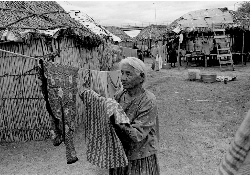
Woman hanging laundry in the Kickapoos' makeshift village near Eagle Pass, Texas.

In 1981, Congress passed H.R. 4496, a bill granting federally recognized status to the Kickapoo “Band.” It included provisions that placed lands in Maverick County, Texas, in federal trust and made the tribe eligible for federal services available to other federally recognized tribes. Then, in the mid-1980s, the tribe pushed for an additional clarification of their status. “Holdout Kickapoo Indians Relent, Become U.S. Citizens,” read one headline. Describing the Mexican Kickapoos as a “renegade band,” the article explained that immigration officials granted 143 Kickapoos certificates that bestowed upon them “permanent alien status.” Interestingly, the recognition bill gave the tribe the option of acquiring either U.S. or Mexican citizenship, yet another unique twist in the Kickapoos’ recognition saga. While U.S. officials expressed pride that “so many of them have chosen to become U.S. citizens,” federal recognition actually was not dependent on which country they chose for citizenship status. It did, however, affect their eligibility for state and federal welfare programs that fell outside of BIA auspices, which for many made U.S. citizenship a no-brainer. 78