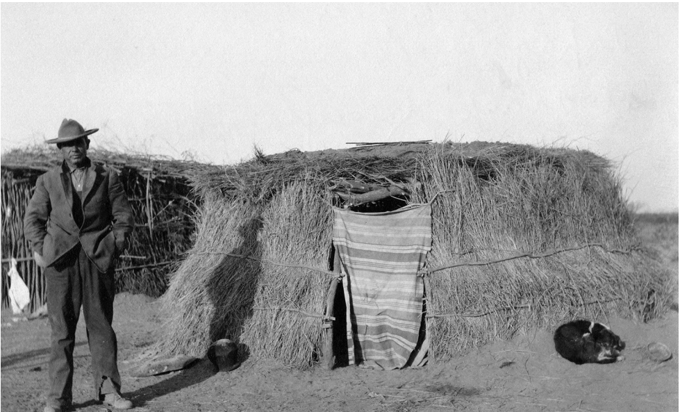
A Tohono O'odham man poses in front of his off-reservation home in the Sonoyta Valley, Arizona. No date given.

where the group had access to water sources, and summer settlements in the desert below near the deltas of washes, where they waited for the late-summer monsoons. They also maintained encampments near sources of saguaro cactus, the fruit of which the O'odham used to make wine for ceremonial purposes. 9