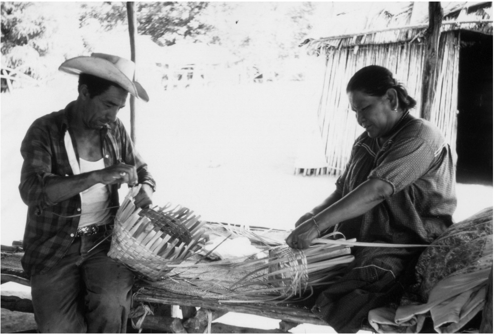
Kickapoo couple weaving sotol baskets in “Kickapoo Village,” which likely refers to their settlement near Eagle Pass, between 1965 and 1967. The caption reads, “Although this is women’s work, in this instance the Mexican husband of this Kickapoo woman is giving her a hand.”

of saplings, scrap lumber, cardboard, and sheets of black plastic, all held together by strips of the trimmed salvages [ sic ] of denim obtained from the local Wrangler jeans factory.” On more than one occasion, several huts burned because of cigarette butts or burning matches carelessly tossed out of a car window by passersby. At one point a freak flood washed away most of the tribal members’ personal belongings. Local assistance in these kinds of cases was usually not forthcoming. “One less Indian to worry about, says the government” seemed to be the consensus, according to one Kickapoo. 54 Such attitudes were perhaps not surprising, considering the fact that most Americans recognized the Kickapoos only through the popular L’il Abner comic strip, which included a Kickapoo character named Lonesome Polecat. His pastime was the production of a beverage called Kickapoo Joy Juice, an alcoholic concoction. 55