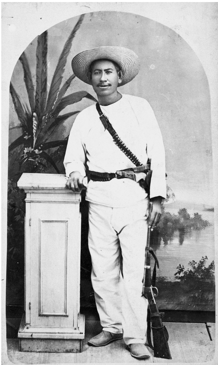
Portrait of José María Leyva (Cajeme), taken while he was under arrest.