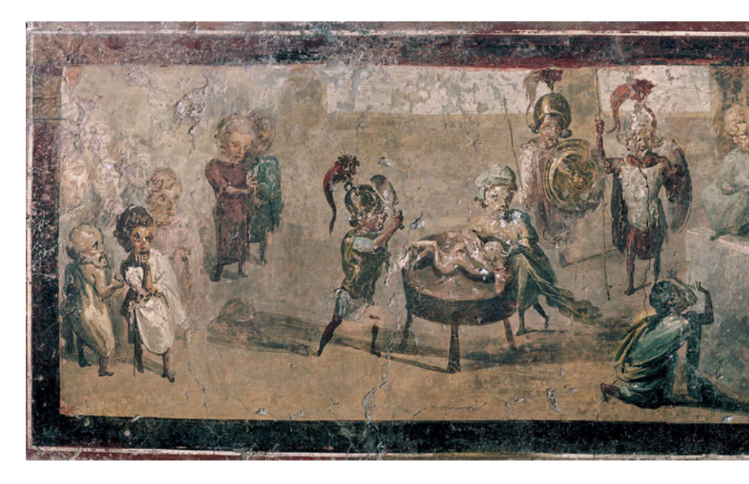
Fig. 3 A wall painting from Pompeii depicting Aristotle and Socrates regarding Solomon, who sits in judgment. Roman art: Judgment of Solomon. Naples, National Archaeological Museum.

orum ) above Egypt,<sup>837</sup> the fifteenth and sixteenth centuries saw Solomon take the form of an ancient Jewish super-sage, greater in occultism than Hermes Trismegistus. Jewish culture could now boast not only an ancient magus of its own but one who could take his place among the other ancient magi in universal wisdom. Yet, Solomon, unlike Moses, was born too late to be regarded as the teacher of the legendary Hermes Trismegistus, who was believed to be a contemporary of Moses. Aristotle, on the other hand, postdated Solomon by centuries, and this made possible the invention of a tradition in which the Greek super-sage became Solomon's pupil.