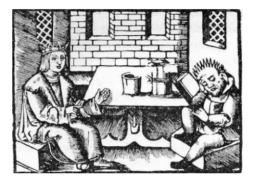
Fig. 4 King Salomon and Marcolphus

"Heavenly King, who rules magnificently by Thy virtue, who wieldest the scepters of justice, give sovereignty to the King; give him the government of the state an inviolable justice so that he may rule the people with fair laws; that he, as protector, may set free the good by justice and restrain the guilty by rigid law; that he may give charitable aid to those miserably effected [....] The king, just judge of the wretched, the distressed, judge of the poor, righteous judge of the needy, the King, Solomon, will give laws for the pious. The King will resolve any quarrel among fierce adversaries. There shall be no room from oppression in this King".<sup>885</sup>