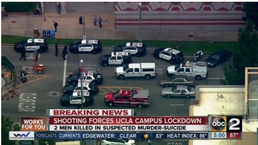
Fig. 1: Police force assembled on UCLA campus [public domain].

I want to close by briefly addressing the overwhelming show of militarized police force that occurred in response to a murder-suicide at UCLA, on the first of June, 2016, as a way of underscoring my concern that securitization is as much or more to be feared than the acts of criminal violence that are lumped under the rubric of 'terrorism.' For those not familiar with this event, at around 10:00 AM police received the first of several 911 emergency calls reporting three shots fired and possible victims.