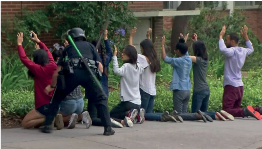
Fig. 6: Students with hands up on their knees being searched by police on UCLA campus.

In retrospect this response proved to be massively disproportionate to the threat, which ended when the murderer, a former graduate student, killed himself after killing his advisor. Of course, one might argue that because there was no way to know this at the time, it was better for the police to be safe than to be sorry. And this argument makes a certain kind of practical sense. But what I find most troubling about this event is not the murder itself, as tragic as it was, nor the threat of future murders with greater numbers of victims. No, what is most troubling to me is the fact that such a massively militarized law enforcement infrastructure pre-exists and that the authority of the police to take complete control over any public space, including a college campus, is undisputed, particularly when, as was the case in this incident, every student on campus is transformed into a potential suspect.