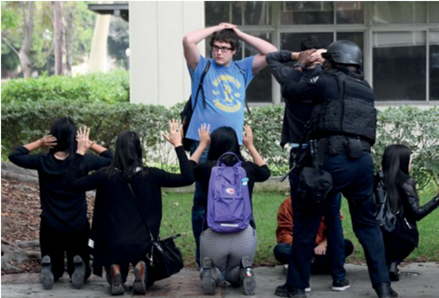
Fig. 5: Students being searched by police on UCLA campus [public domain].

In addition to shutting down the campus for two hours, police searched every student carrying a backpack, which as we all know means almost every student on campus.