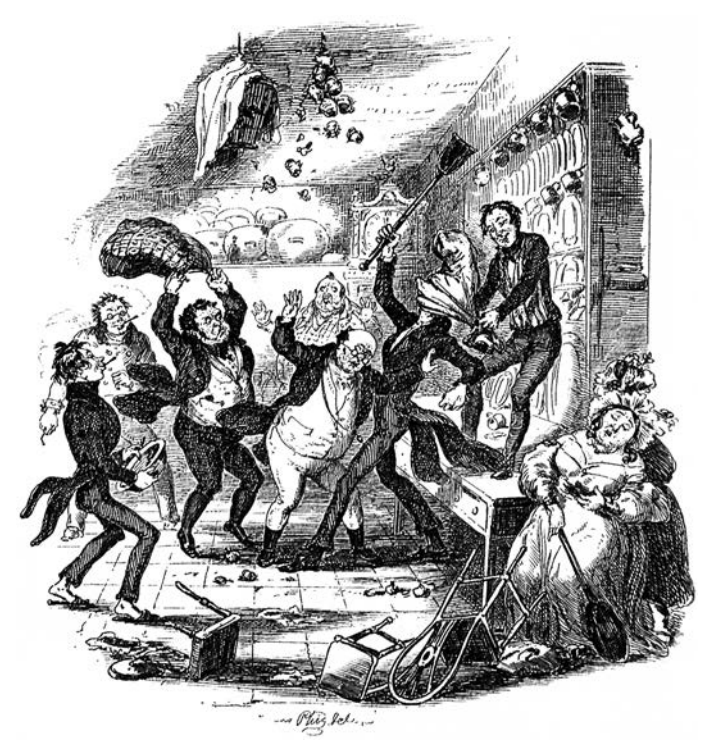
Figure 8: Hablot K. Browne, "The Rival Editors"

aspires in fighting what he believes to be evil, so the physical interventions of Pickwick, the passionately moralistic philanthropist, fail whenever he wants to achieve something good. The illustration by Phiz is an excellent visual equivalent of Dickens's graphic description. It captures the comic moment in which Mr. Pickwick is entangled in the battle, in a totally ineffectual way, about to become the victim as the third in the combat and only saved by the intervention of his servant. However, the artist cannot render the irony of the narrator's comment. This kind of ironic narration continues the tradition of Fielding's 'comic epic in prose,' which is in turn indebted to Cervantes. This aspect of the novel's style – like the ironic creation of an editorial fiction – is an aspect of the Cervantean heritage of The Pickwick Papers with which this article cannot deal. It is ingenious on the part of Dickens to refer in the only explicit allusion to Cervantes' Don Quixote to Mr. Pickwick's philosophy as his armour, which does not always protect him from mischief. Obviously Dickens was entirely aware of how deep-reachingly he transformed the figure of Don Quixote.