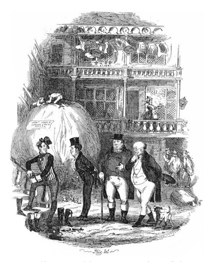
Figure 9: Hablot K. Browne, "The First Appearance of Sam Weller"

solution by adding a string of pointless proverbs, introduced by an illogically used "because":