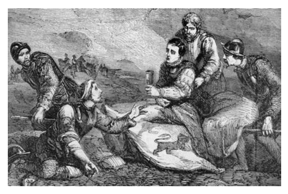
Figure 3: Death of Sir Philip Sidney at the Battle of Zutphen, Cassell's Illustrated History of England (1858).

The impression is even stronger in this illustration from Cassell's Illustrated History of England of 1858,<sup>27</sup> which, partly because of the long coat and the cushion or flag on which Sidney is seated, is not entirely unlike the picture of the woman in the Penny Illustrated Paper (fig. 3).