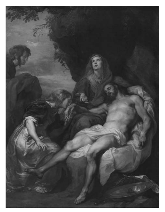
Figure 5: Anthony van Dyck, The Lamentation of Christ (circa 1629) (mirror-inverted).

reader of the Penny Illustrated Paper the aesthetic and literary suggestiveness of the water-giving Dickens need not have been a matter of conscious reflection. Nevertheless, the illustrator and the editors of the paper subtly create an icon of Dickens by establishing a sort of subconscious link to a popular pictorial tradition. In doing so, they take up the notions of the literary artist, the knight, and the selfless Christian that were fused in the representation of Sidney and rearrange them by making Dickens hand the water to the angelic but suffering young woman, who assumes the position of the writer-hero. We are thus reminded that the feminine virtue of selflessness, presented by Dickens himself in such characters as Agnes (in David Copperfield ) and Little Dorrit, but also in Joe (in Great Expectations ) is a human quality pertaining to men and women alike.<sup>31</sup>