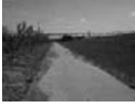
Dow: Phytoremediation for Groundwater Decontamination, Ontario, Canada