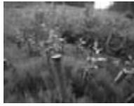
Shell: Natural Reclamation and Erosion Control for Onshore Pipelines, NE British Columbia, Canada