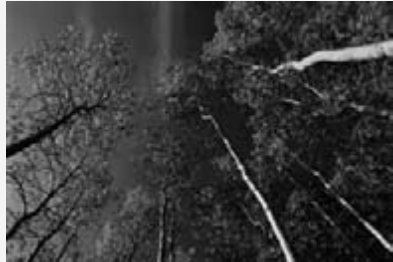
The Dow Chemical Company

Geographical location: Houston-Galveston-Brazoria (HGB) area near Dow's Freeport Texas Operations