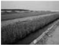
Shell: Produced Water Treatment Using Reed Beds, Nimr, Oman