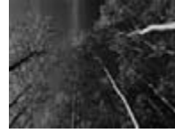
Dow and TNC: Air Pollution Mitigation via Reforestation, Texas, USA