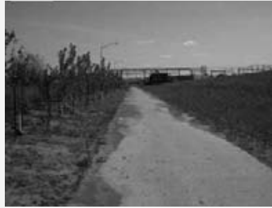
Sarnia Site, the Dow Chemical Company

Geographical location: Sarnia, Ontario, Canada