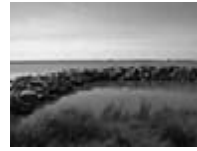
Shell and TNC: Coastal Pipeline Erosion Control Using Oyster Reefs, Louisiana, USA