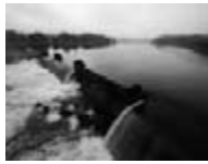
TNC: Integrated Reservoir Floodplain Management, Georgia and South Carolina, USA