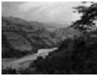
TNC: Cauca Valley Water Fund, Cali, Colombia