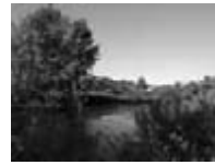
TNC: Managing Storm Water Runoff with Wetlands, Philadelphia, PA, USA