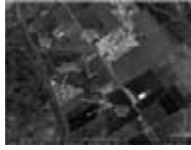
Dow: Constructed Wetland for Waste Water Treatment, Texas, USA