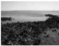
TNC: Oyster Reef Building and Restoration for Coastal Protection, Louisiana, Mississippi and Alabama, USA